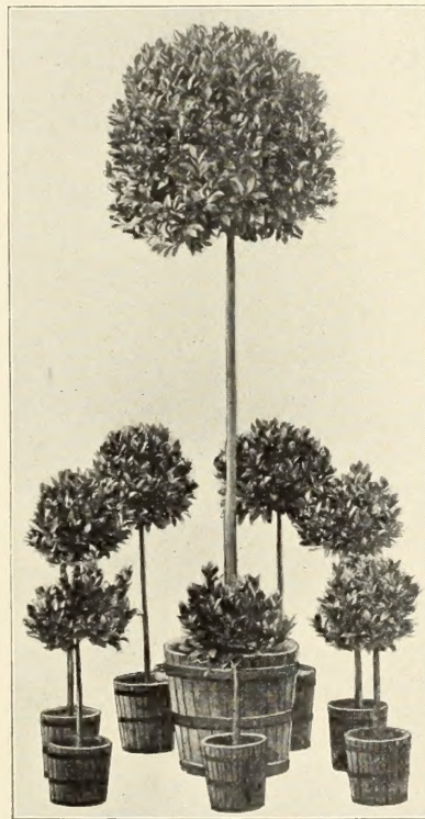
Imperial Standard and Dwarf Standard Bays

Splendid specimens in strong solid tubs with stems 3, 3½, 4, 4½ and 5 feet high, and fine bushy crowns, from 9 to 10 feet in diameter, and from 8 to 9 feet in depth. $175.00 each.