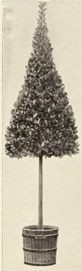
Imperial Pyramid-Shaped Bay