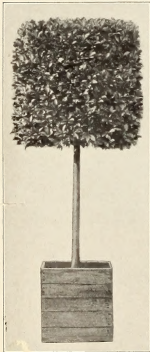
Standard Bay with Square Head

This is a new form in Bays, stems 45 to 48 inches high, the square heads being 40 inches in diameter. These are growing in square tubs to conform to the shape of the crowns. $25.00 each.