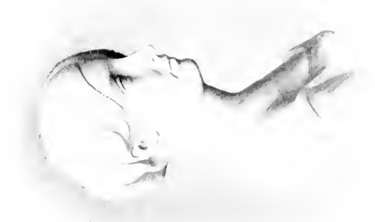
From a marble bust by WILLIAM BROOKE, R.S.A.