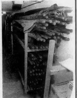
During a full-scale emergency "key personnel" would be expected to seal themselves in and sleep on these uncomfortable bunks.

Similar HQs are to be found beneath the Tandridge Council Offices in Oxted and the Mole Valley Offices in Dorking. Council officers and some councillors receive special train-