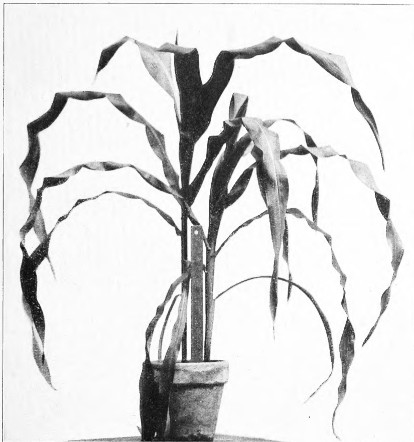
Plants grown from grains of Zea mays immersed in kerosene from February 6, 1906, to February 6, 1914. On removal from the kerosene the grains were cleared of superficial oil by means of absorptive towels, and then washed vigorously for five minutes in chloroform and exposed to dry air at room temperature for five days. They were planted February 11, 1914, and this photograph was taken April 22, 1914.