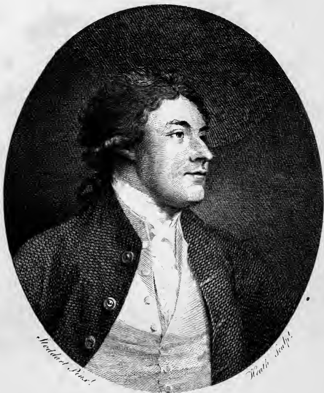
H. L. DE LOLME.