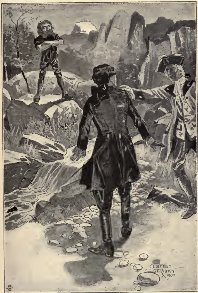
HIS FOOT WAS ARRESTED BY THE VOICE OF HIS COMPANION.