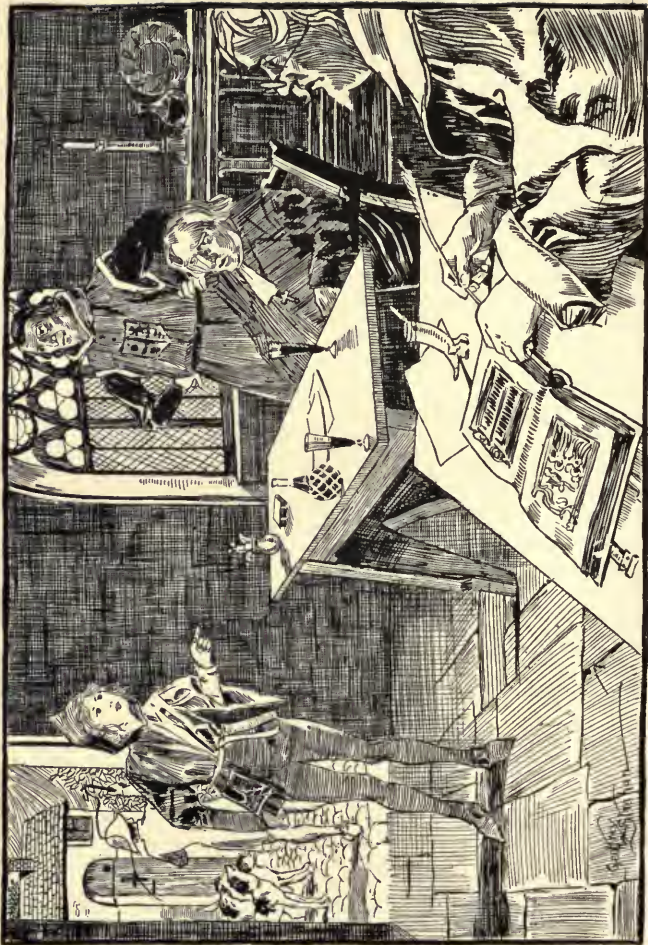
LAW AND CHURCH AGAINST THE DEVIL.