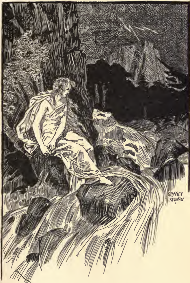
ENJOYING THE RUSTLING OF THE STORM.