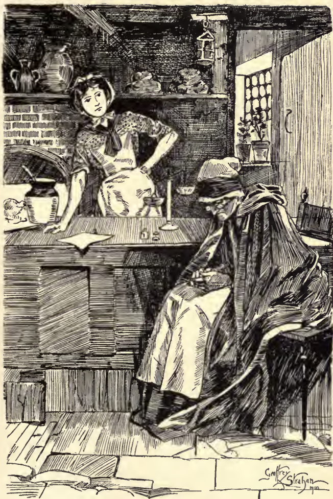
THE OLD WOMAN SAT DOWN.