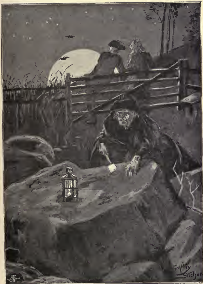
NELLY'S UNWEARIED HAMMER.