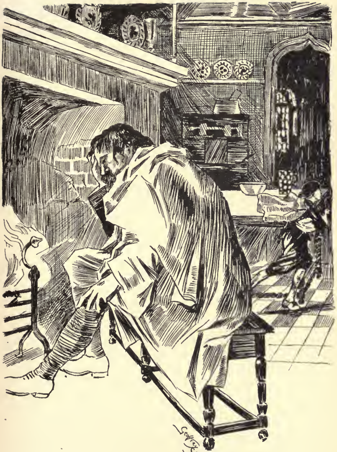
JACK SEIZED THE HEN.