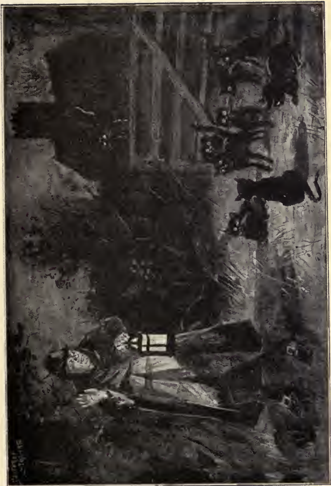
AND THE LIGHTS WERE THE FLASHES FROM THEIR EYES.