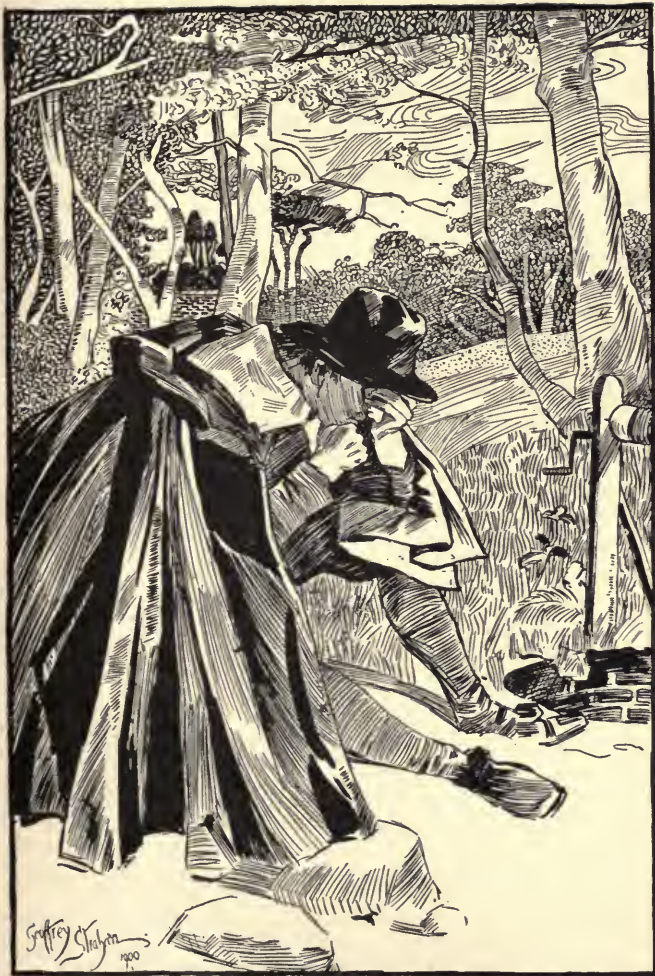
HE SAT CRYING INTO THE WELL.