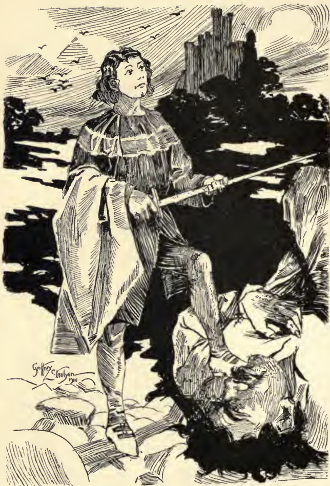
HERE'S THE VALLIANT CORNISHMAN.