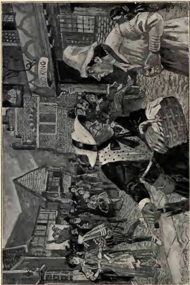
ENQUIRING FOR HIS CHEESE