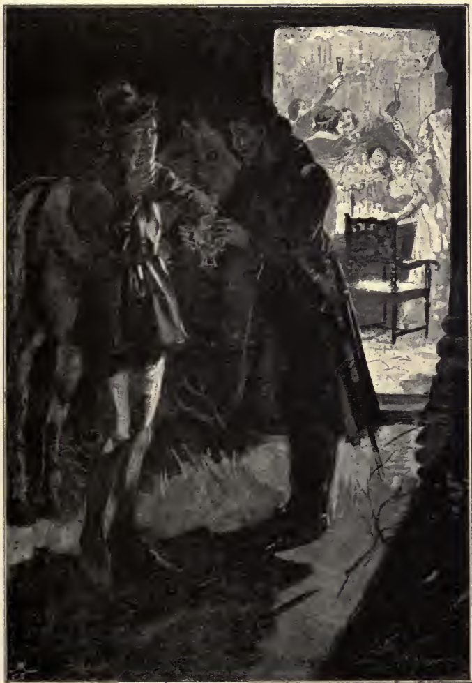
ONE OF THE ATTENDANTS OFFERED HIM A CUP