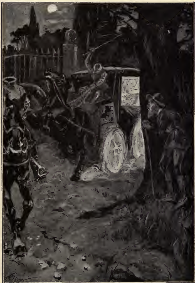
A STRANGE PROCESSION.