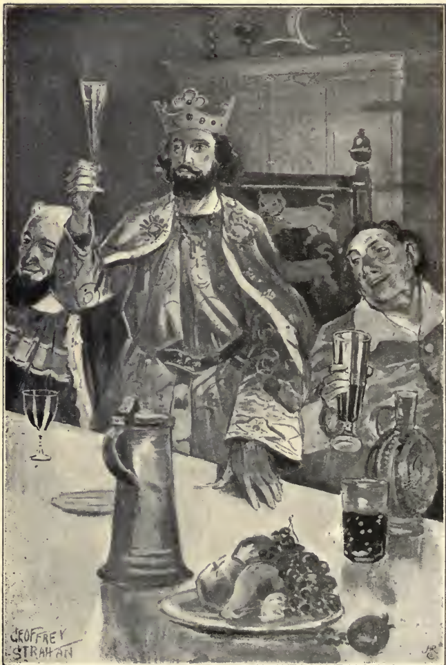
THESE ARE MY TRUSTY AND WELL-BELOVED SUBJECTS,