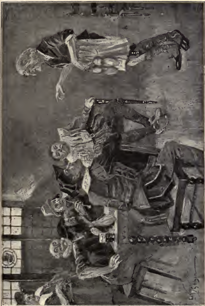
THERE CAME AMONG THEM A POOR COBBLER.