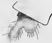
♀ genitalia (side view).