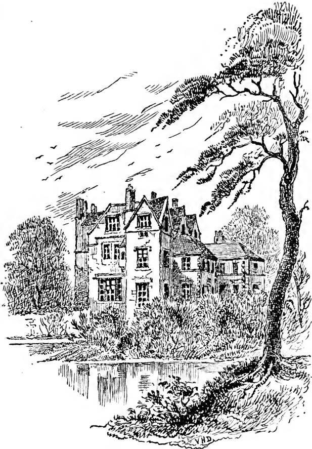
BREADSALL PRIORY, WHERE ERASMUS DARWIN DIED.