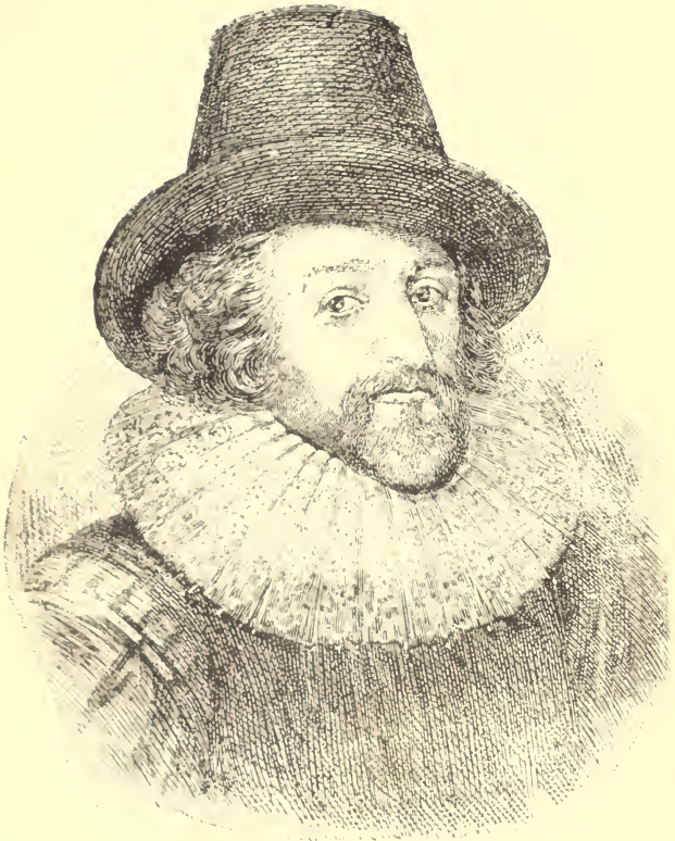
FRANCIS BACON, VISCOUNT ST. ALBANS.