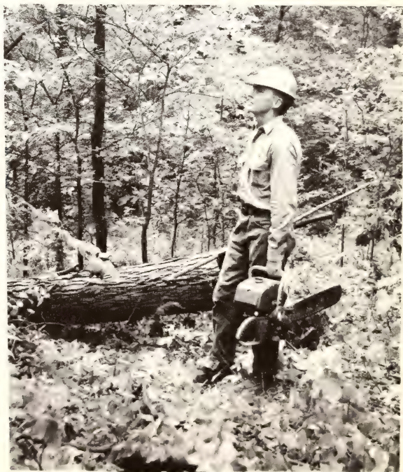
FIGURE 4. — Traveling be- tween trees with felling and buck- ing equipment.