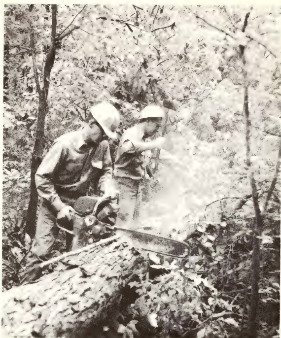
FIGURE 3. — Bucking bole into logs with two- man crew: One man saws while the other clears away brush and limbs.