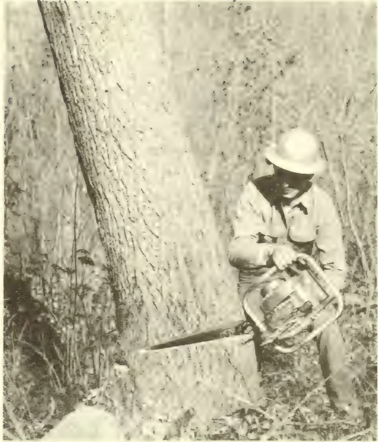
FIGURE 1.—Felling with one-man powersaw.