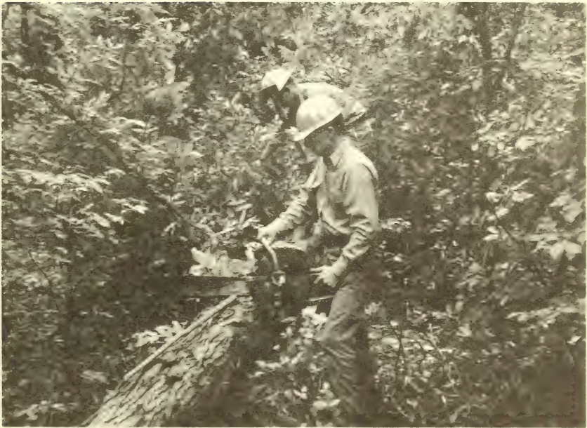
FIGURE 2.—Limbing tree and marking bole for bucking with a two-man crew.