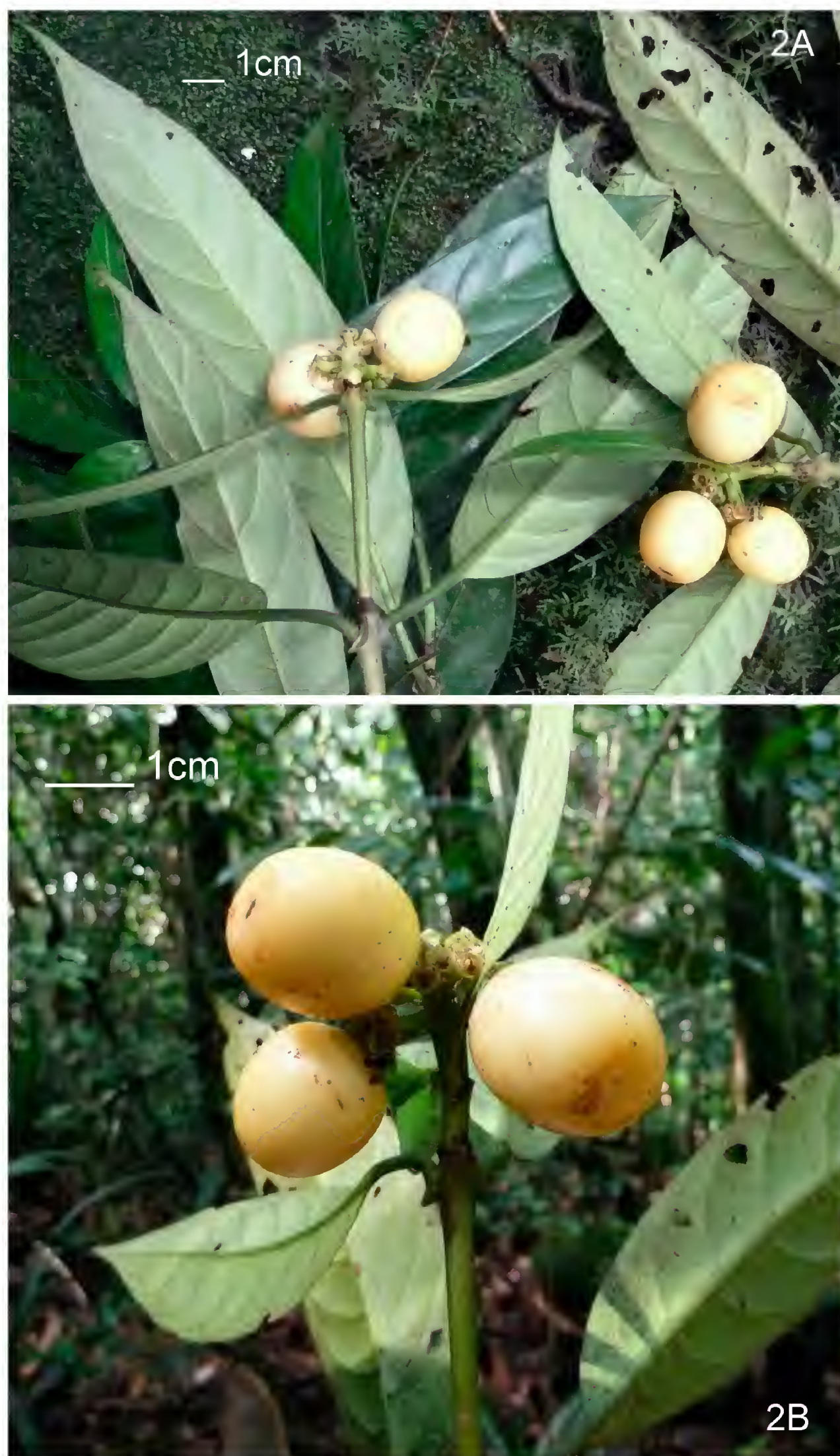
Fig. 2. Gaertnera luteocarpa sp. nov. subsp. sinoensis subsp. nov. A. Fruits and leaves. B. Close up of fruits. From Jongkind, Bilivogui & Daniels 9832.

LIBERIA. Sino County, SSW of Jalay's Town near the Sinoe River, 5°20' N, 8°49' W, alt: 90–100 m, fl. bud, 10 Mar. 2009, Jongkind, Bilivogui & Dorbor 8923 (WAG); c. 50 km east of Greenville, 5°04.61' N, 8°30.42' W, alt: 59 m, fl., 18 Mar. 2014, Jongkind & Mulbah 12500 (BR, K, MO).