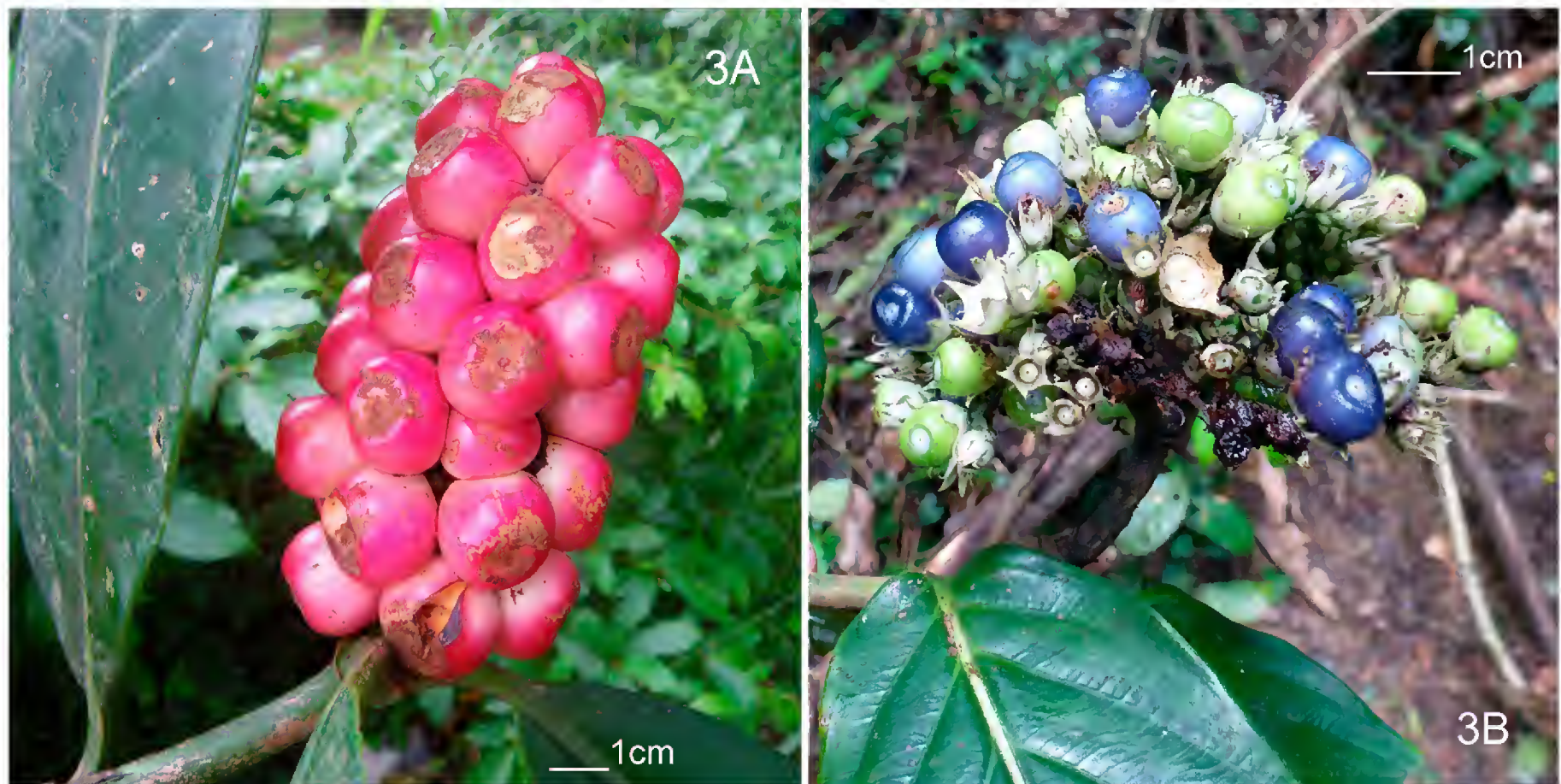
Fig. 3. A. Gaertnera spicata fruits. B. Gaertnera cooperi fruits. A from Lachenaud & Walters 1163 . B from Jongkind, de Wet & Sambolah 12104 .

The EOO is 54 km 2 and the AOO is 12 km 2 , both count as “Endangered”. The AOO is based on a cell width of 2 km. Only one of the specimens was collected in a protected area. Considering all the economical development planned in this part of Liberia, I propose “Endangered” for this subspecies (B1 & B2 ab(iii) IUCN 2015).