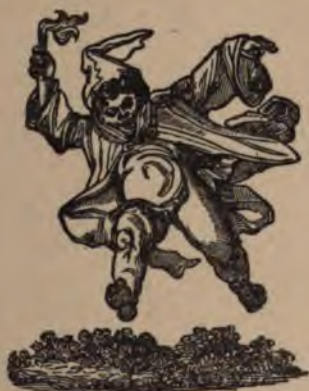
Alter et Idem