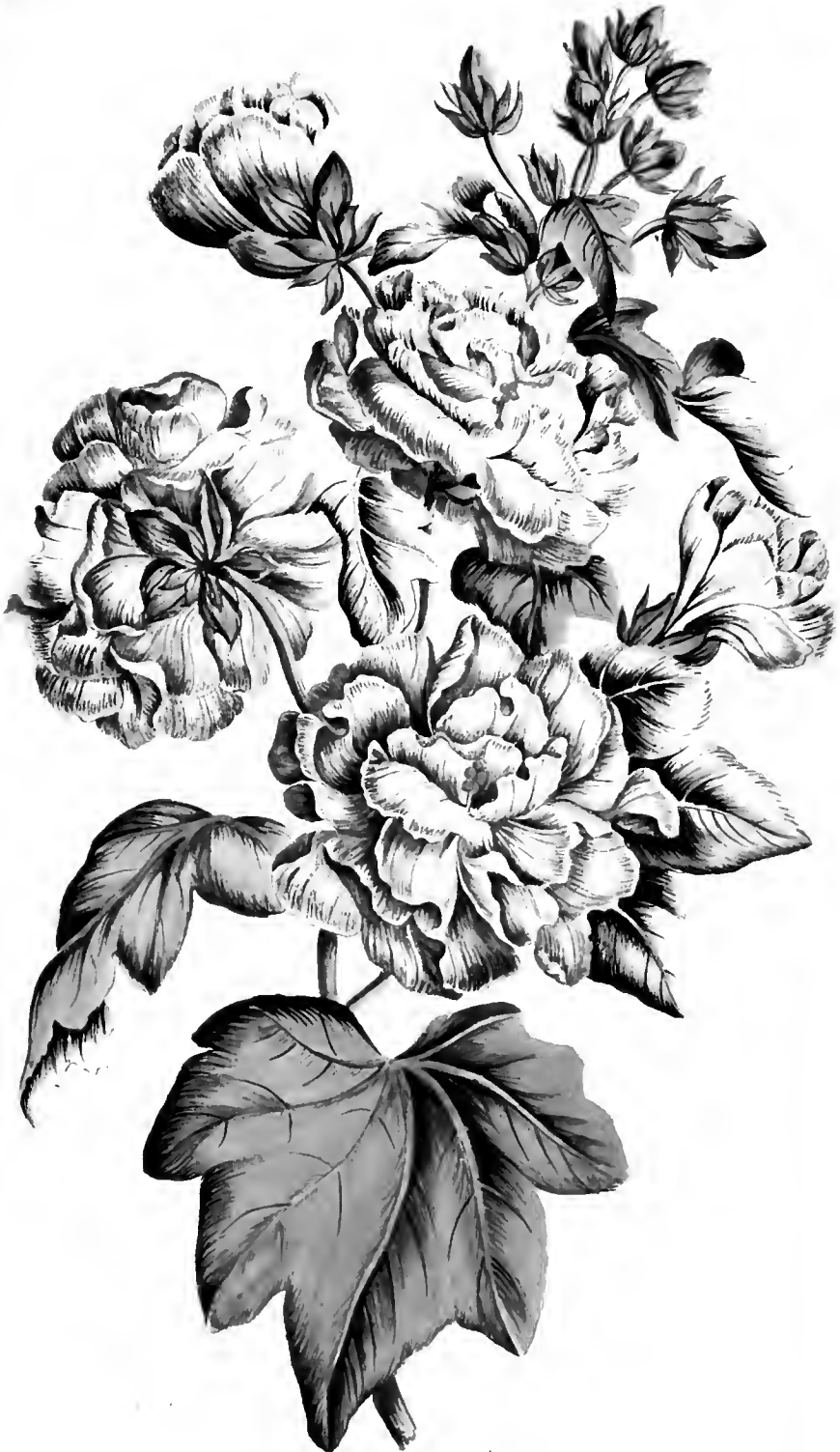
Paeonia moutanensis , Siebold.