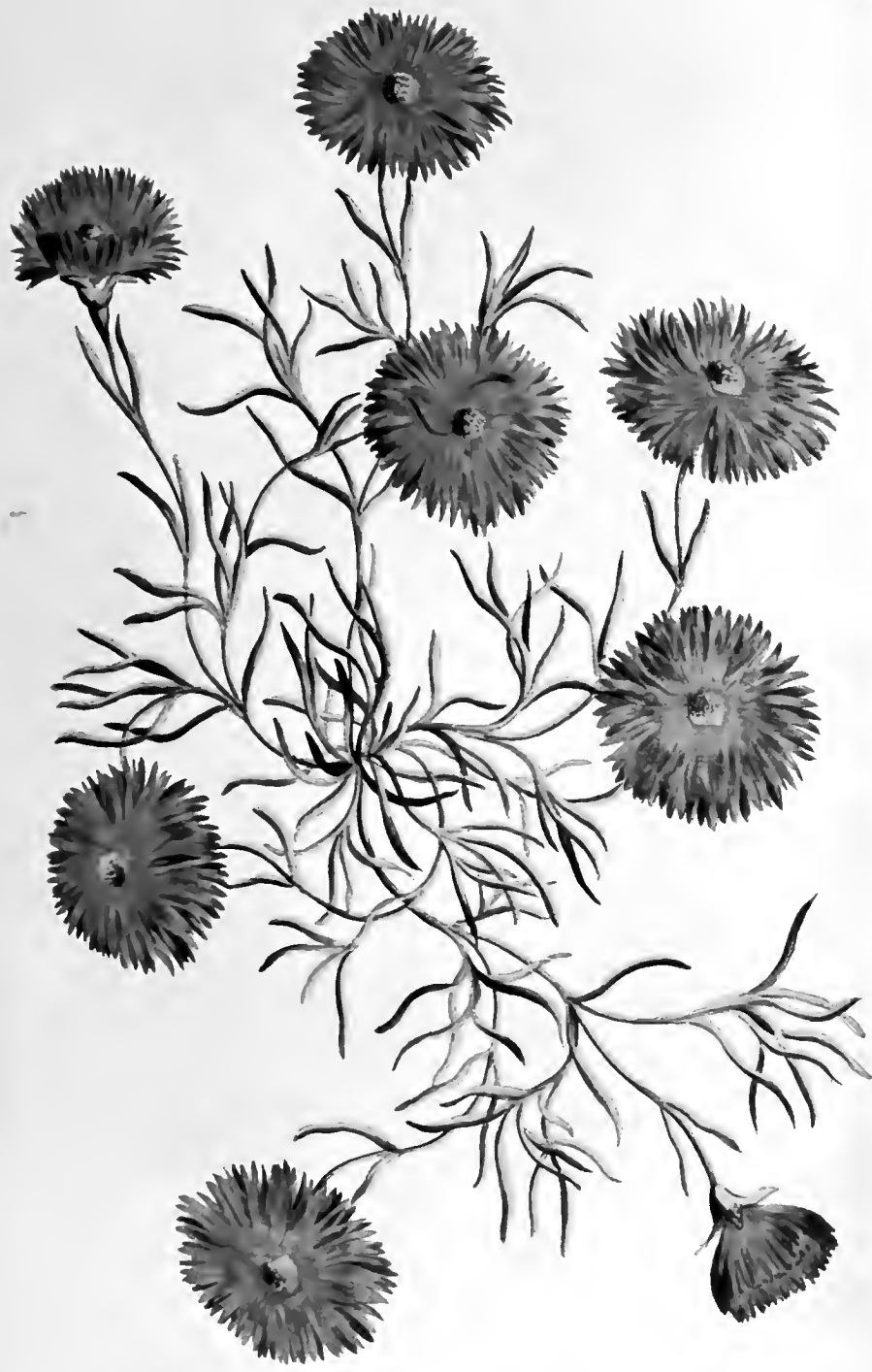
Aster multiflorus L.