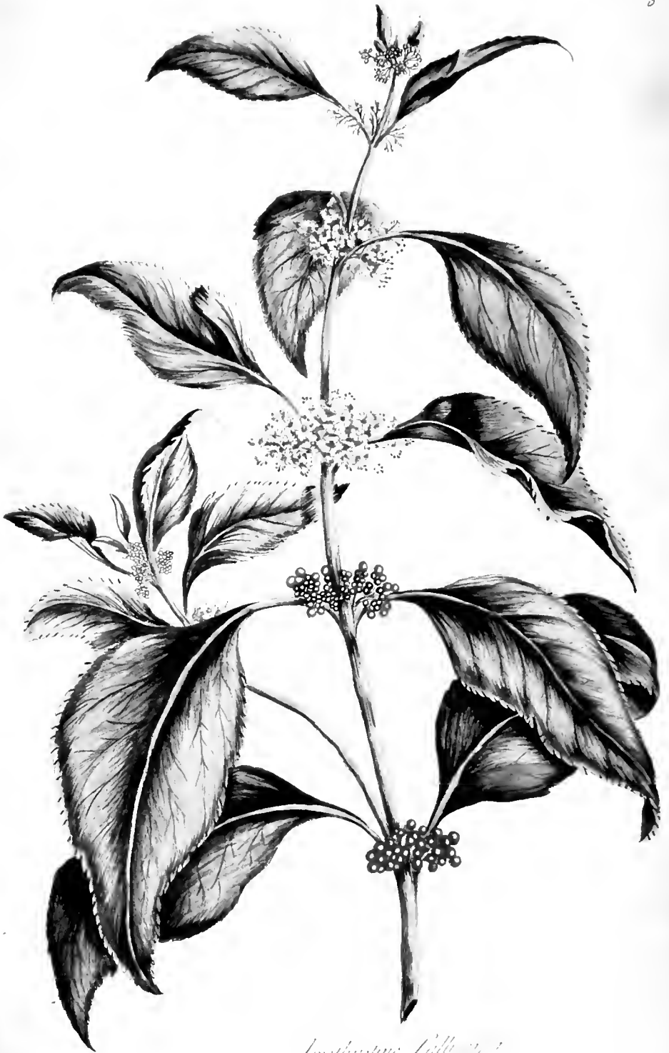
Amelanchier (Vill. 177)