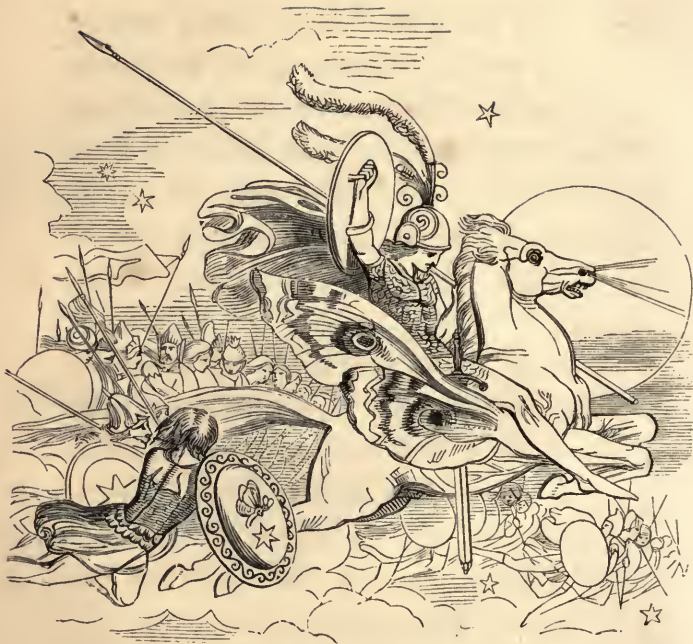
THE BATTLE OF THE FAIRIES.