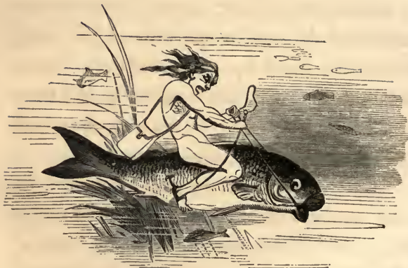
THE WICKED WATER FAIRY.