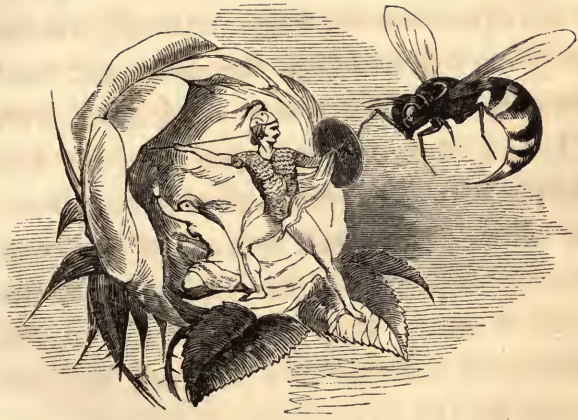
SLYBOOTS FIGHTING THE WASP.