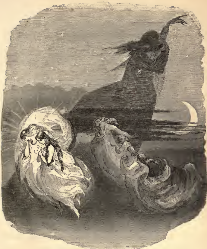
THE ANGEL OF DEATH.