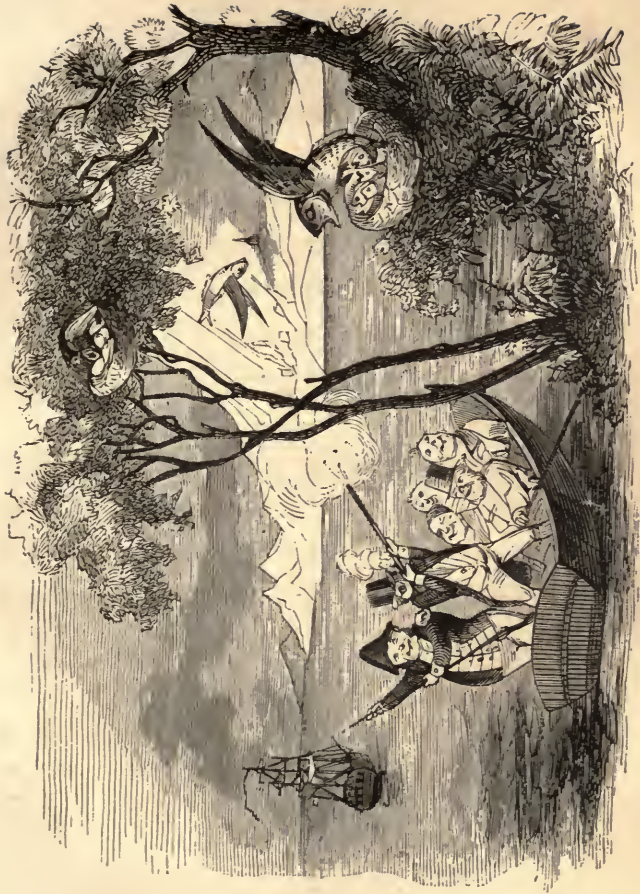
DEATH OF THE SILVER TROUT.