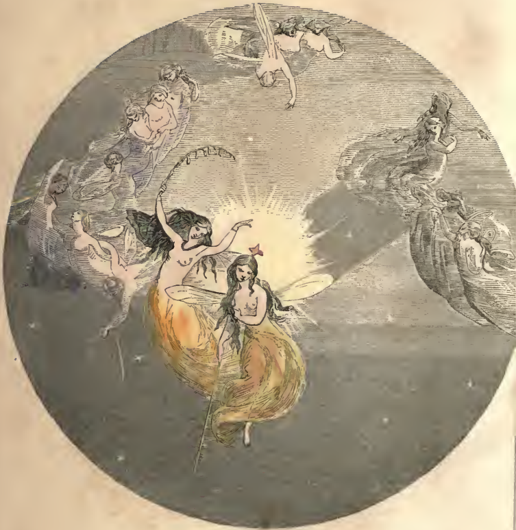
GOING TO THE MIDSUMMER BALL.