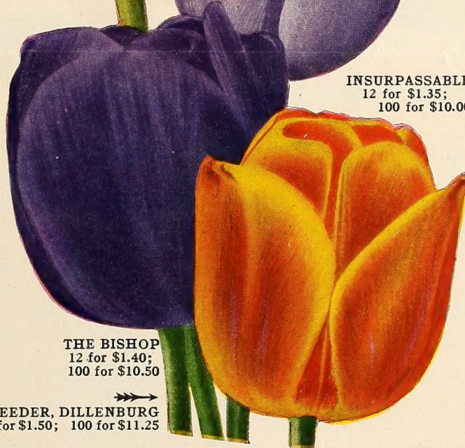
INSURPASSABLE 12 for $1.35; 100 for $10.00