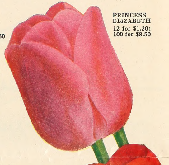
PRINCESS ELIZABETH 12 for $1.20; 100 for $8.50