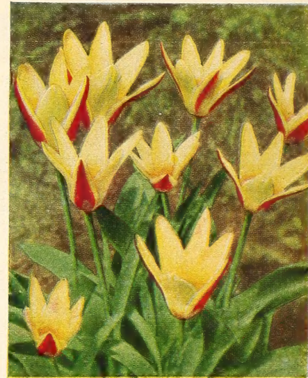
BOTANICAL TULIP KAUFMANNIANA

Separately packed and labeled 5 bulbs each of the 6 Double Early varieties 30 for $3.65