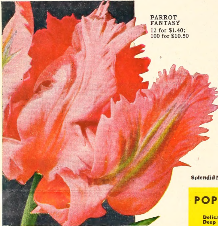
PARROT FANTASY 12 for $1.40; 100 for $10.50