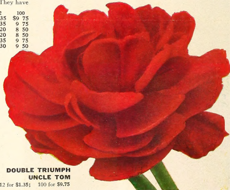
DOUBLE TRIUMPH UNCLE TOM

The "Waterlily" Tulip. Blooms early in April, grows 6 inches tall. Very attractive in the rock-garden and alongside the water pool. 12 for $1.45; 100 for $10.75