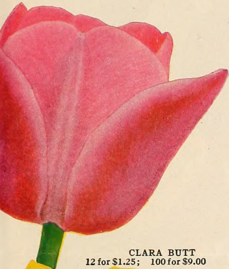
CLARA BUTT 12 for $1.25; 100 for $9.00