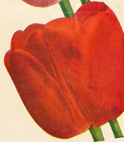
FARNCOMBE SANDERS 12 for $1.20; 100 for $8.50