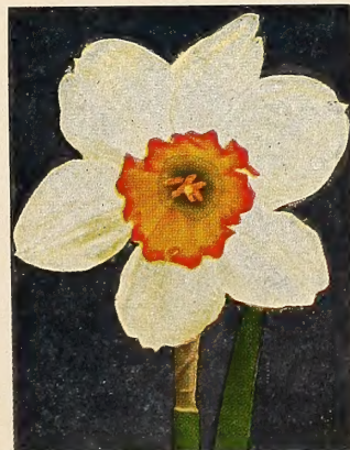
LADY DIANA MANNERS