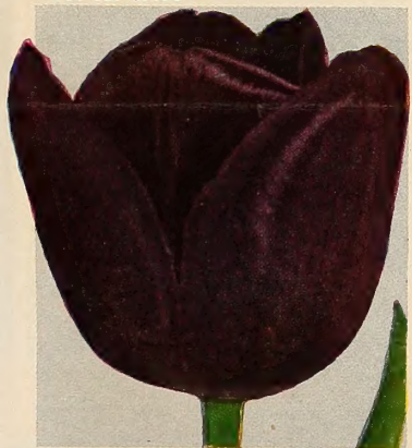
LA TULIPE NOIRE 12 for $1.40; 100 for $10.50