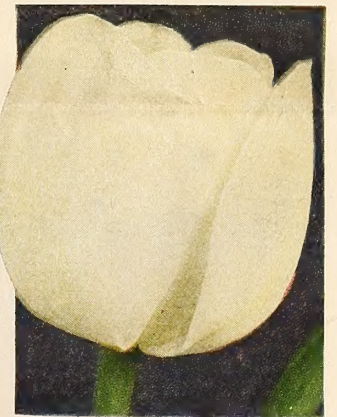
WHITE GIANT 12 for $1.40; 100 for $10.50