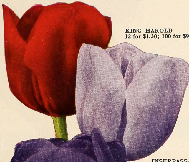
KING HAROLD 12 for $1.30; 100 for $9.50