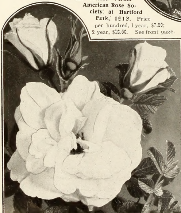
Rugosa Rose.—Sir Thomas Lipton

Excelsa. Red. Dorothy Perkins habit. The color is deep cerise or crimson, with tips of the petals tinged scarlet. Flowers are large and double, and produced in rich full clusters with dazzling effect. A Sure Winner. Won Highest Award (from American Rose Society) at Hartford Park, 1913. Price per hundred, 1 year, $7.50; 2 year, $12.50. See front page.