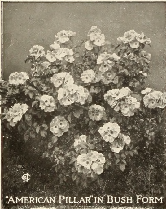
"AMERICAN PILLAR" IN BUSH FORM

It Will Bloom as Freely When Allowed to Climb and Will Grow 20 ft. in One Season.