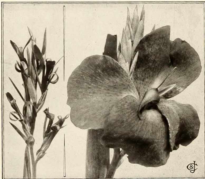
Original Native Canna

On account of their free-blooming qualities, we strongly recommend the following varieties for planting in beds: Brilliant, Buttercup, California, Compte de Bouchard, Gladiator, King Humbert, Mrs. A. F. Conard, Pillar of Fire, Pres. McKinley, Venus, Wyoming. We recommend planting beds all one color for best effect.