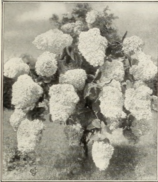
Hydrangea paniculata grandiflora