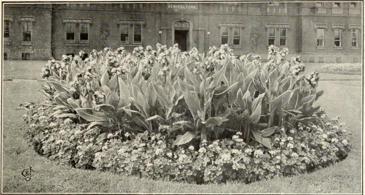
A Bed of C. & J. Rosea Gigantea in front of Department of Agriculture Building, Washington, D. C., where "Only the Best are wanted"