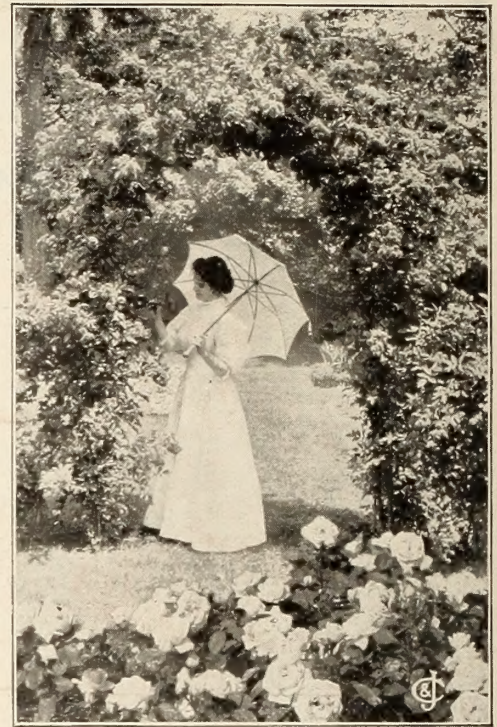
We have them for Easter Bloom as well