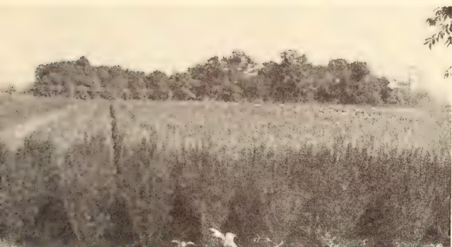
Specimen plants of California Privet—well spaced for top and root development.