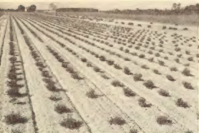
Some of our Azalea Hinodegiri. Note space allowed for top and root development.

A. indica alba (Snow Azalea). 4 to 5 ft. Best by far of the white flowered evergreen Azaleas with its large snow-white bloom appearing in late Spring, offering a superb contrast to Hinodegiri.