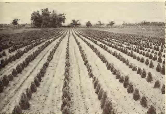
Biota or. aurea nana, of which we have 50,000 specimens.

B. or. aurea nana globosa (Berckman's Golden Globe Arborvitae). 2 ft. Slow growing, compact globes of golden foliage, valuable for formal gardens or rockeries.