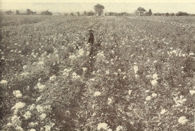
One of our Rose Fields. Note sturdy vigorous growth.