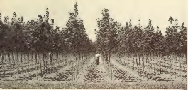
Norway Maples—Grown properly with plenty of space between the trees.

A. platanoides (Norway Maple). 60 to 70 ft. Probably the most popular of all shade trees with its familiar round head and yellow Fall foliage.