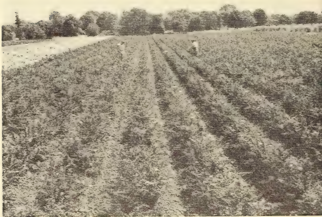
Berberis thun. atropurpurea. Part of our supply of over 100,000 transplanted plants.