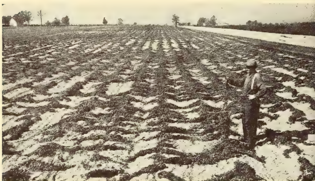
Ampelopsis Veitchi as grown at Little Silver.