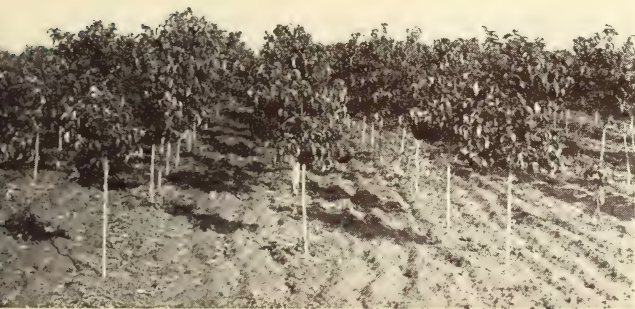
Some of our Pink-flowering Dogwoods—Properly spaced for top and root development

C. florida rubra (Pinkflowering Dogwood). 15 to 20 ft. Like the above but with deep pink bloom—a gorgeous sight in Spring.