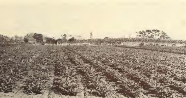
One of our several blocks of Ligustrum regelianum

L. regelianum (Regal Privet). 5 to 6 ft. This popular spreading Privet thrives in a city planting, is invaluable for shrub groupings, or for a low compact hedge.