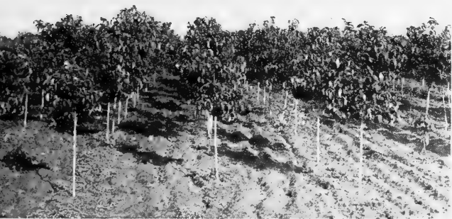
Some of our Pink-flowering Dogwoods—Properly spaced for top and root development

C. florida rubra (Pinkflowering Dogwood). 15 to 20 ft. Like the above but with deep pink bloom—a gorgeous sight in Spring.