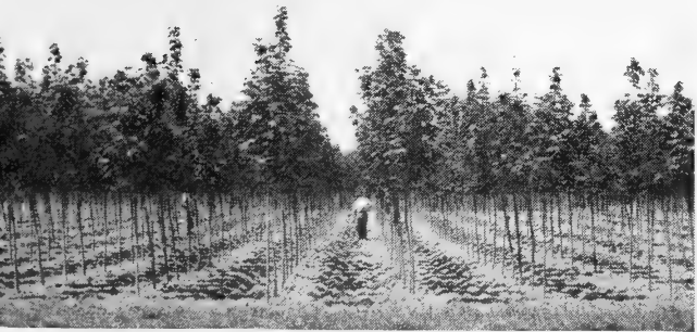
Norway Maples—Grown properly with plenty of space between the trees.

A. platanoides (Norway Maple). 60 to 70 ft. Probably the most popular of all shade trees with its familiar round head and yellow Fall foliage.