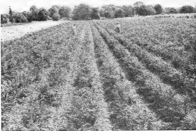
Berberis thun. atropurpurea. Part of our supply of over 100,000 transplanted plants.