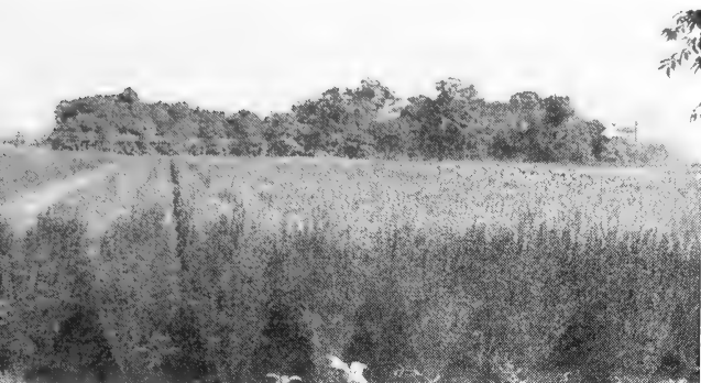
Specimen plants of California Privet—well spaced for top and root development.