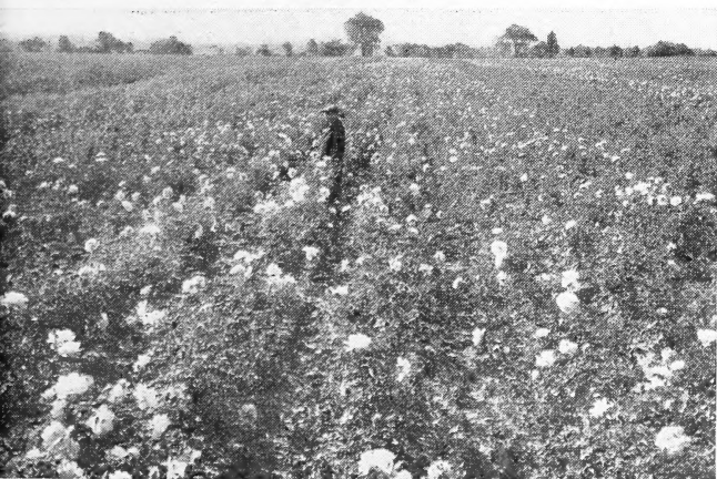
One of our Rose Fields. Note sturdy vigorous growth.