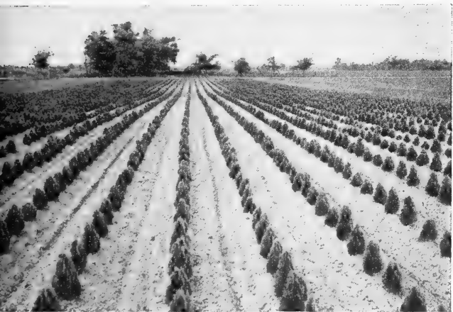
Biota or. aurea nana, of which we have 50,000 specimens.

B. or. aurea nana globosa (Berckman's Golden Globe Arborvitae). 2 ft. Slow growing, compact globes of golden foliage, valuable for formal gardens or rockeries.