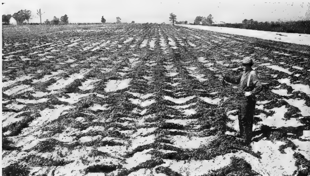
Ampelopsis Veitchi as grown at Little Silver.