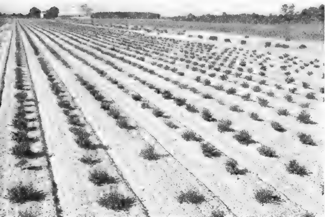
Some of our Azalea Hinodegiri. Note space allowed for top and root development.

A. indica alba (Snow Azalea). 4 to 5 ft. Best by far of the white flowered evergreen Azaleas with its large snow-white bloom appearing in late Spring, offering a superb contrast to Hinodegiri.