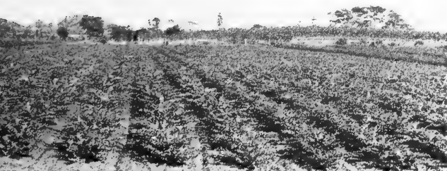
One of our several blocks of Ligustrum regelianum

L. regelianum (Regal Privet). 5 to 6 ft. This popular spreading Privet thrives in a city planting, is invaluable for shrub groupings, or for a low compact hedge.