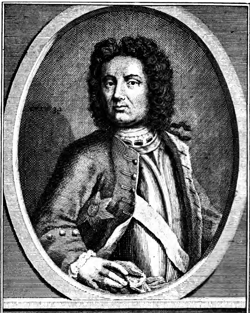
AUGUSTUS II, SURNAMED "THE STRONG" ELECTOR OF SAXONY AND KING OF POLAND 1697-1733

He was the founder of the famous collection of gems preserved in the "Green Vaults" of Dresden, Saxony, which contains the "Dresden Green" diamond