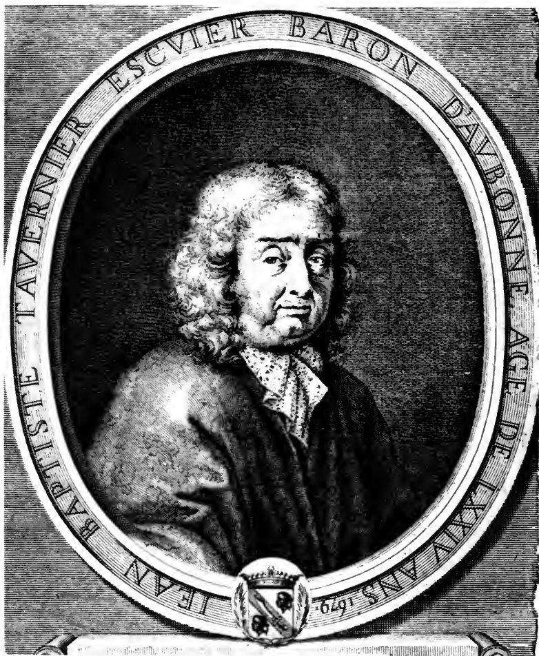
JEAN-BAPTISTE TAVERNIER A FRENCH TRAVELER AND GEM MERCHANT

He made six journeys to the East, 1630-1669, and accurately described many large diamonds which he saw there