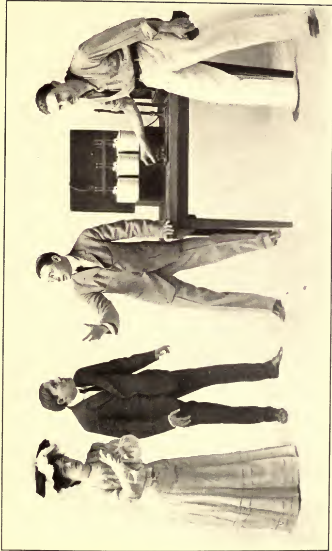
"We've hooked something! We've tapped a real wire!"