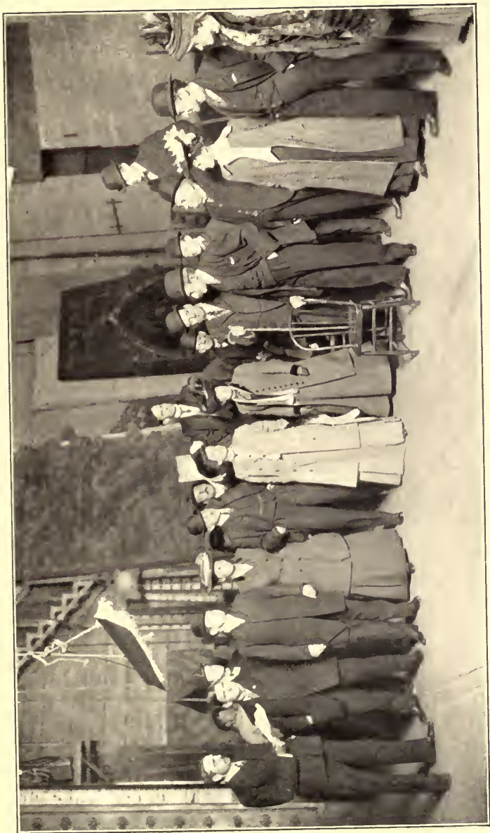
The original cast of "The Galloper" at rehearsal.