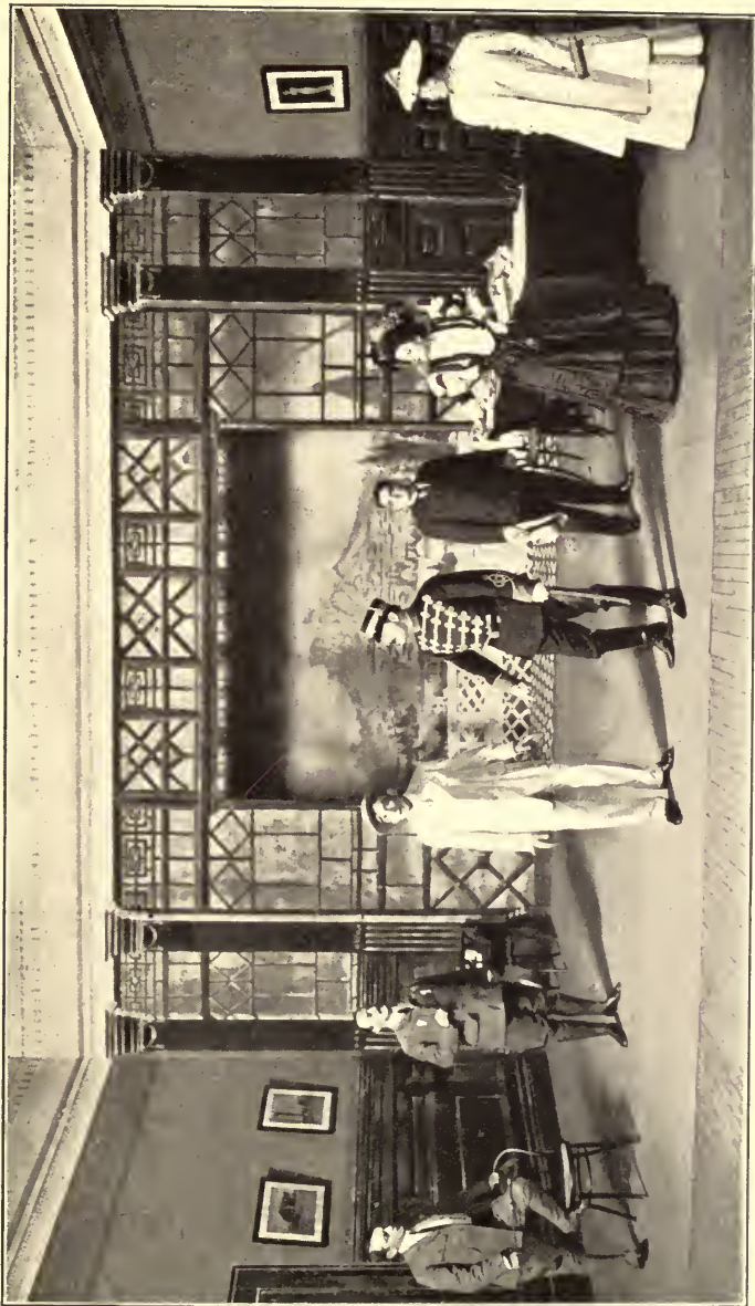
“There are eight officers. You will find us waiting for you on the wharf!”