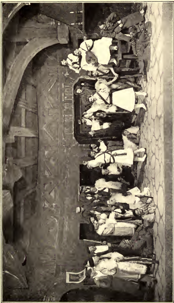
The Greek soldiers dancing in the Inn near Volo.