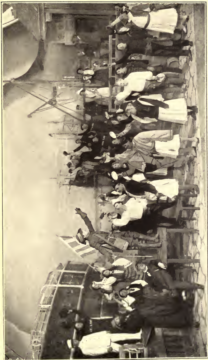
“Men of Athens! Remember Marathon! And I ask you—what has the Republican party ever done for Greece?”