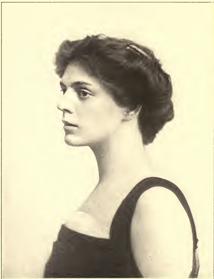
MISS BARRYMORE, THE ORIGINAL "ALICE GARDNER" IN "MISS CIVILIZATION."