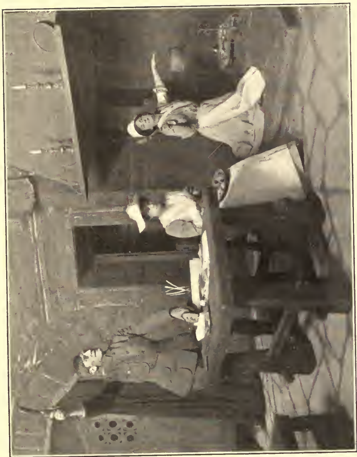
“Why don't you sing?”