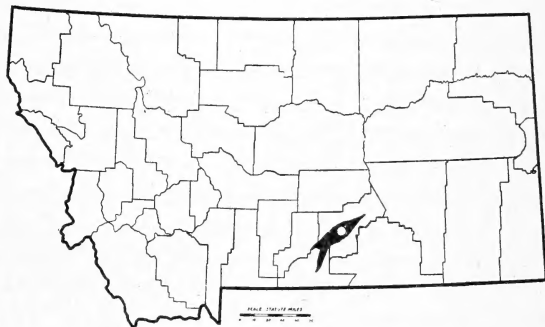
FIG. 1.—Outline map of the State of Montana, showing (in black) the approximate location of the sugar-beet region studied. The white dot in the black area indicates the location of the sugar-beet factory at Billings.

The area in the Yellowstone Valley west of Billings comprises a strip of land extending from about 1 mile east of Billings to 1 mile west of Park City, a distance of nearly 25 miles. At Billings this area is about 4 miles wide, and it gradually widens toward the west until at a distance of about 8 miles west of Billings a maximum width of 7 miles is reached. It then narrows abruptly to about 3 miles, which width it approximately maintains to Park City. The area comprises 68,416 acres, or about 107 square miles. The soils of this area for the most part are inclined to be a little heavy, although they seem well adapted to the growth of sugar beets and other crops that are found in this region.