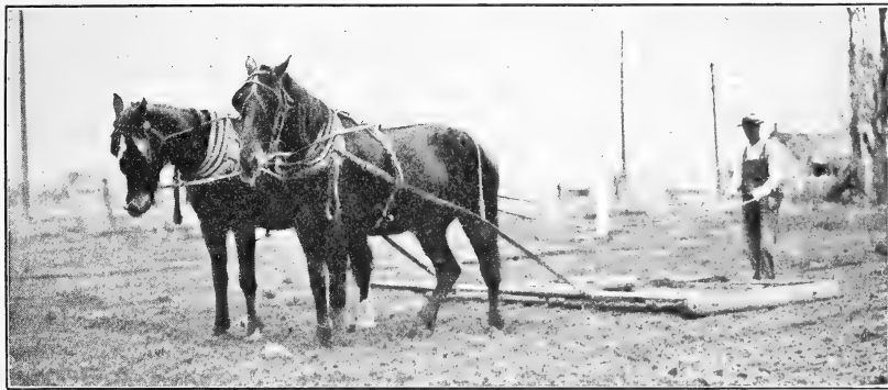
FIG. 2.—Floating sugar-beet land. The homemade implement here shown is used after disking to level the ground and put it into good condition for irrigation.

The growers who did not use a box level of this sort used a drag made of overlapping planks. These drags are usually from 3 to 5