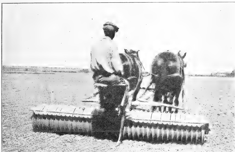
FIG. 4.—A corrugated roller used on beet land. A good type of roller for firming the seed bed.

After being planted, 4,935 acres, or 56 per cent of the total area in beets, was rolled. This rolling is usually done after the beets have come through the ground and before they have grown very much. It cost 31 cents to roll an acre of beets, or 0.77 of an hour of man labor and 1.55 hours of horse labor. Rolling is done for two purposes: (1) To break any crust that may have formed on the ground and enable many beets to come up that would not otherwise be able to get through, and (2) to break and crush clods that would be likely to be thrown on the beet row at the first cultivation. Most growers use corrugated rollers run crosswise of the beet rows. (Fig. 4.) Very few use smooth rollers, as they are not as efficient for breaking