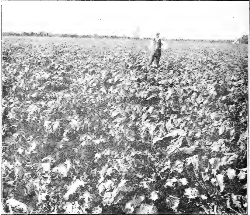
FIG. 6.—A flourishing field of sugar beets. When the beets cover the ground as shown in this picture, cultivation ceases.

and shade it (fig. 6), so that the heavy crusts will not form in the furrows where the water has run. The beets are usually ready for irrigation about July 15 to 25. There is a popular belief that early irrigation tends to shorten the root of the beet, but this is not true where the beet is suffering for want of water. If the season is dry the farmer should not wait too long to irrigate. A beet should be kept in the best growing condition possible at all times and should not be allowed to lie dormant or have its growth checked when an application of irrigation water would make it grow rapidly. The