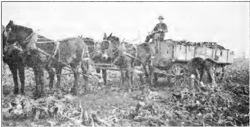
FIG. 7.—Loading and hauling sugar beets. Wagons are specially constructed to dump the load directly into a freight car or storage sheds.

Beets are hauled in special wagon boxes, which permit the beets to be dumped from the wagon directly into the cars that are to transport them to the factory. (Fig. 7.) The men do not have to shovel the beets when cars are available, but in many cases the number of