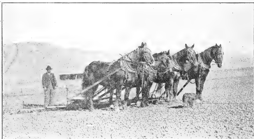
FIG. 3.—A 4-horse team harrowing a field of sugar beets. This crew economizes man labor.

It required an average of 1.75 hours of man labor and 5.75 hours of horse labor to harrow an acre. All of the farmers harrowed their land in preparing the seed bed for beets; 246 growers used 2-section harrows, and 49 used 3-section harrows, while 13 used harrows of unclassified types. (Fig. 3.)