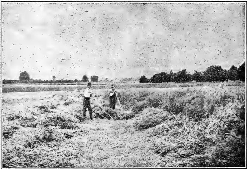
FIG. 1.—A common method of cutting tangled vetch. The first swath cut is rolled on the uncut vetch; after the mower passes again, the double swath is rolled on the uncut vetch; when the mower has cut under this, the triple swath is rolled outward.

It is very difficult to separate the seeds of wheat or rye from vetch seed, while those of oats and vetch can be separated reasonably well. For a seed crop that is intended for market, therefore, oats and vetch