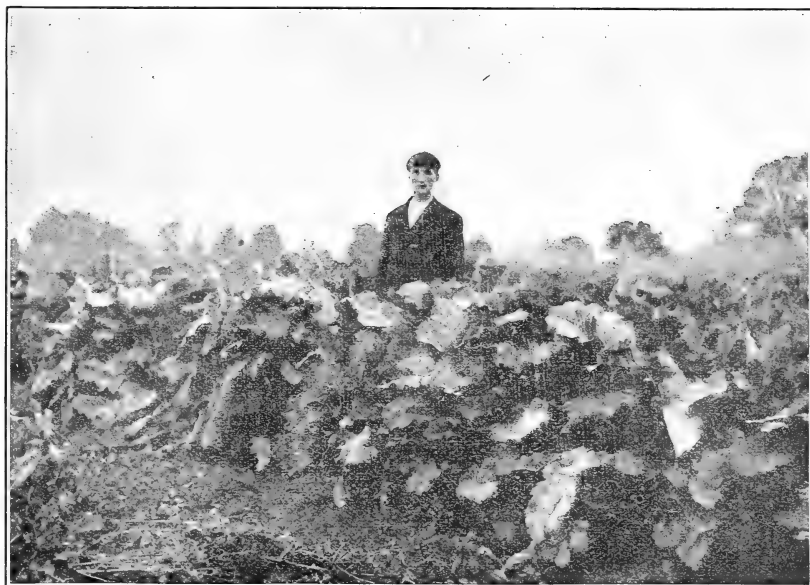
FIG. 2.—A field of thousand-headed kale on Martins Island, near Kalama, Wash. A valuable winter soiling crop, available from October 1 to April 1.

Thousand-headed kale ( Brassica oleracea ) has been grown in the Willamette Valley for 27 years. It attracted little attention among the dairymen until recent years, but is now rapidly becoming a very popular fall and winter soiling crop. It stands the mild winters