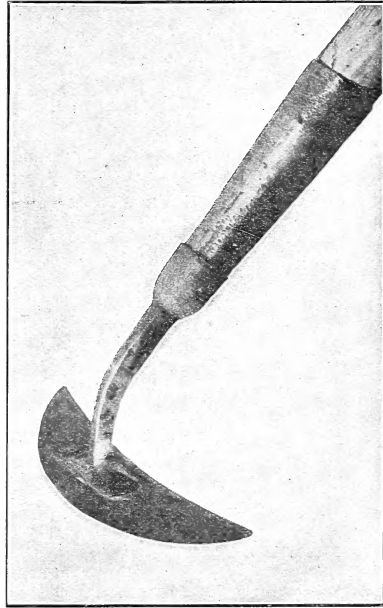
FIG. 4.—A "scuffle" hoe similar in principle to that shown in figure 3, devised by A. B. Leckenby, Seattle, Wash. The blade of either of these hoes may be made from an old saw blade.

About the 1st of November the roots are topped, pulled, and placed in narrow bins in the barn. Upon the approach of cold weather they are covered with hay or straw. The tops are sometimes cut off with a sharp hoe and the roots then dug with a potato fork. More generally they are dug first, the worker pulling on the top of the root with one hand as he bears down upon the handle of the potato fork with the other. The roots of two or three rows are laid together with the tops one way. The tops are then cut off with a long-handled knife. Some twist the tops off, claiming that the roots do not bleed and wither so much as they do when the tops are cut off. Roots are grown mostly for winter use and are fed up to the 1st of April. They are generally sliced before being fed to dairy cattle. Some dairymen feed them whole, claiming that cows can handle large roots nicely and that, unless the slicing is carefully done, they do not choke so frequently when feeding on whole roots as they do on sliced roots.