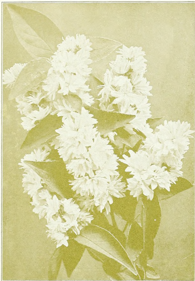
Deutzia crenata rosea fl. pl.

Kerria japonica fl. pl. Corchorus. Double orange-yellow, 75c. each; $8.00 per doz.