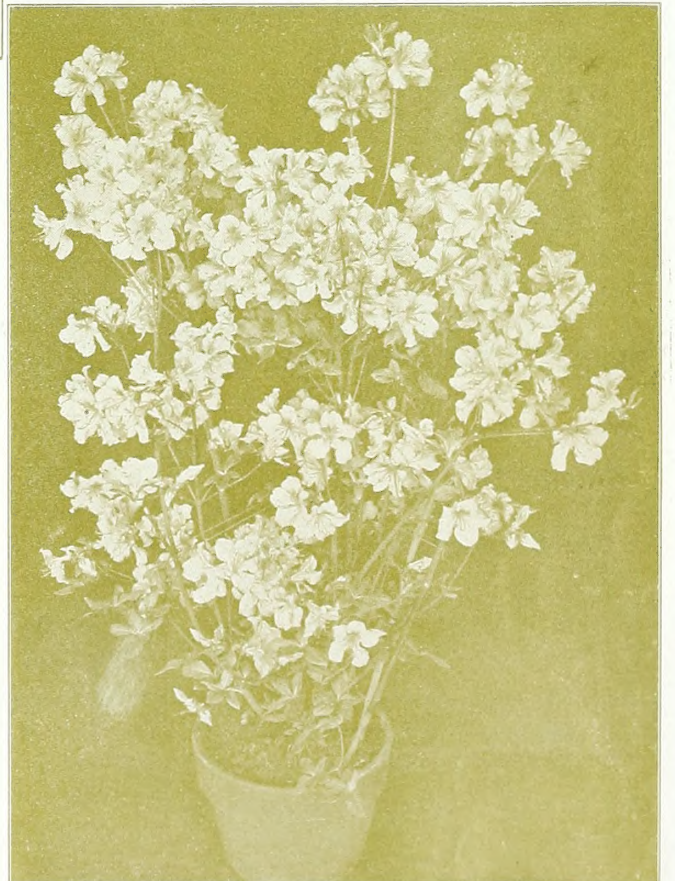
Azalea Kämpferi. Japanese Azalea.

The supply of Azalea Indica from Belgium is uncertain owing to the war, but should conditions change before fall, we shall endeavour to procure our usual supply. We have on hand some fine carried-over plants, a list of which will be sent on request.