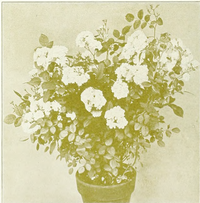
Rose Baby Rambler.

Strong, Field-grown plants in variety, $5.00 per dozen.