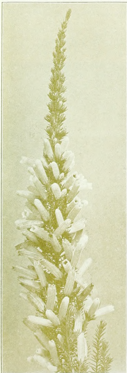
Erica Wilmoreana King Edward VII.

Stuarti. (Ready in September.) Large flowers of bright yellow. Plants in 5 in. pots, 50c. each; $5.00 per doz.