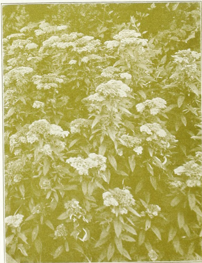
Spiraea Anthony Waterer

Wistaria chinensis. Purple } Bushy plants, $1.75 each; Wistaria chinensis. White } $18.00 per doz.