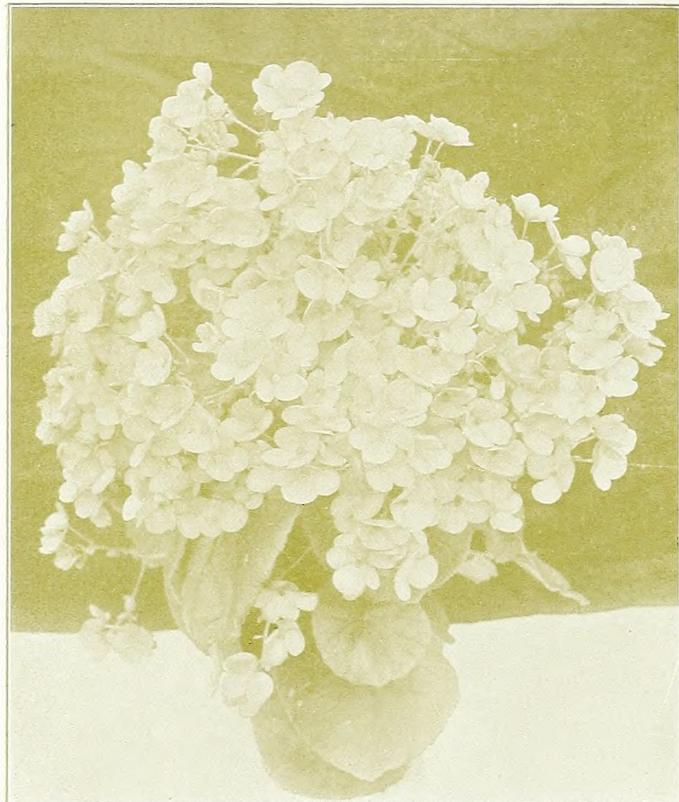
Begonia Glory of Cincinnati.

Allamanda Hendersoni. A strong growing climber; flowers golden yellow. 35c. each; $3.50 per doz..