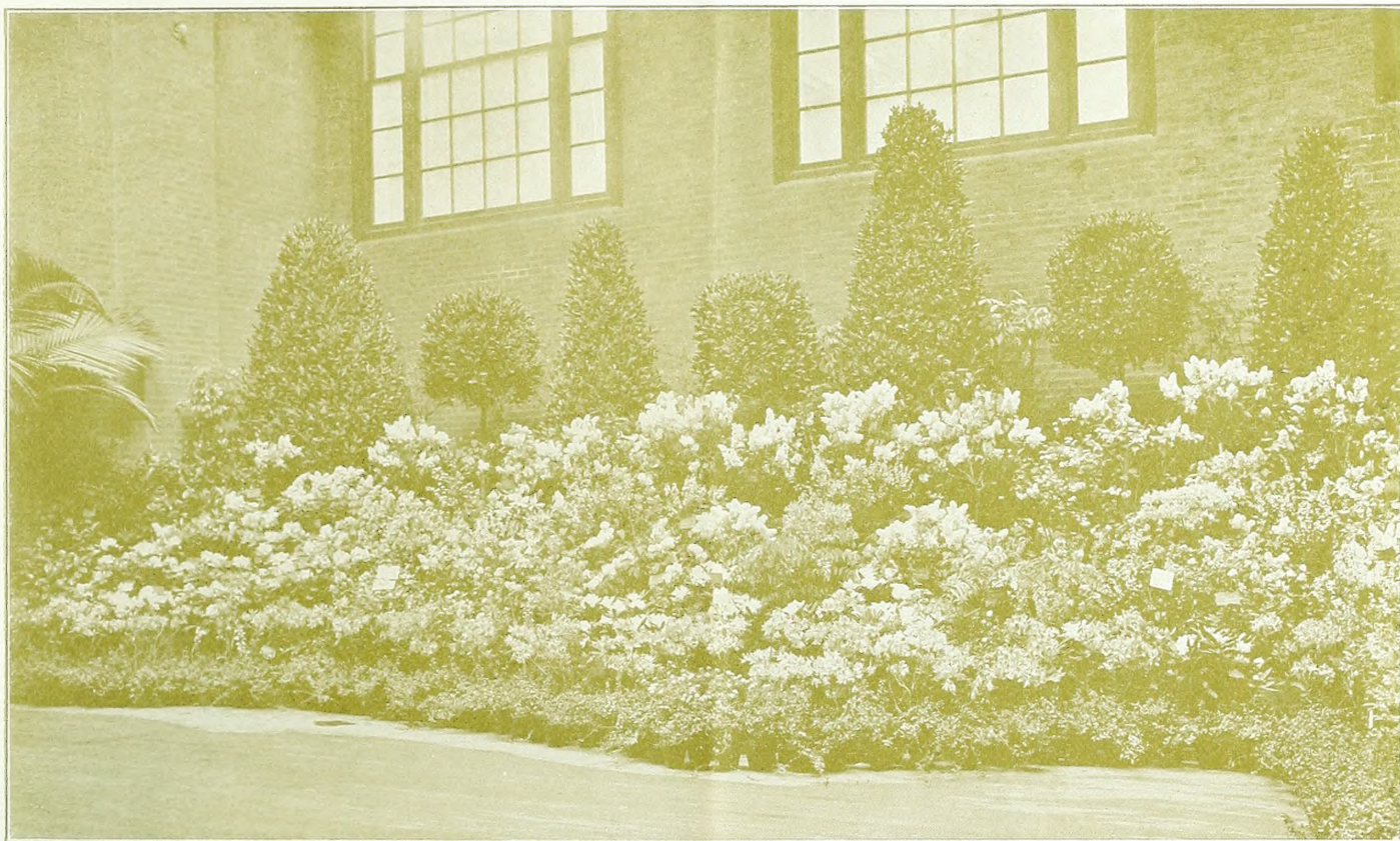
Group of Forced Shrubs exhibited by R. & J. Farquhar & Co. at the Spring Show of the Massachusetts Horticultural Society, March, 1914.

The following are all pot-grown unless otherwise specified.