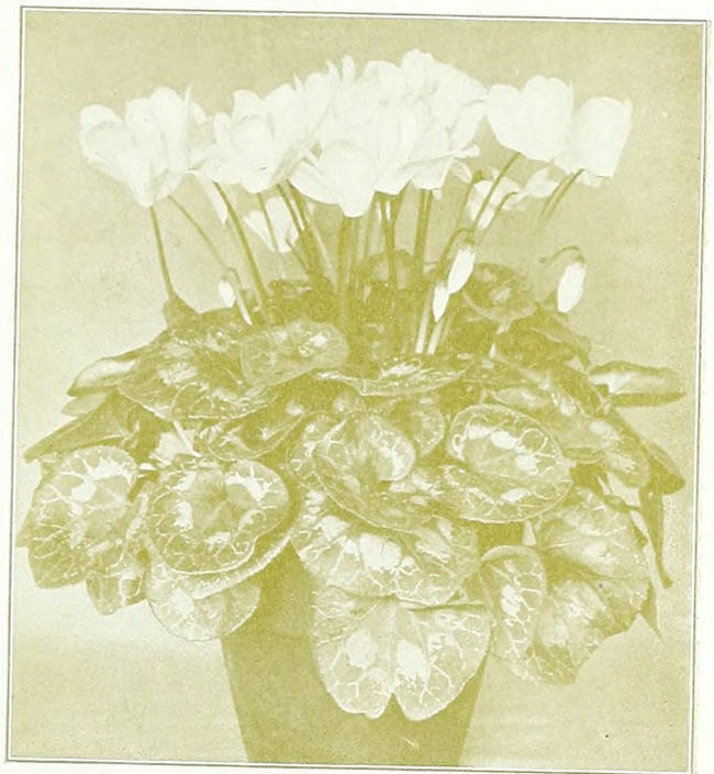
Cyclamen Farquhar's Giant.

Cineraria Farquhar's Superb strain. (Ready in September.) This strain includes the richest and brightest self-colors as well as perfectly marked, ringed and margined forms of all colors.