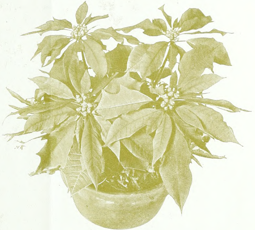
Poinsettia Double Flowered.

Wallflower. Single red or yellow. Strong plants for winter flowering. $2.50 per doz.