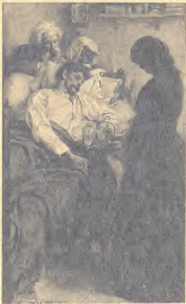
She cast a glance at Bazároff. From a drawing by S. IVANOWSKI.