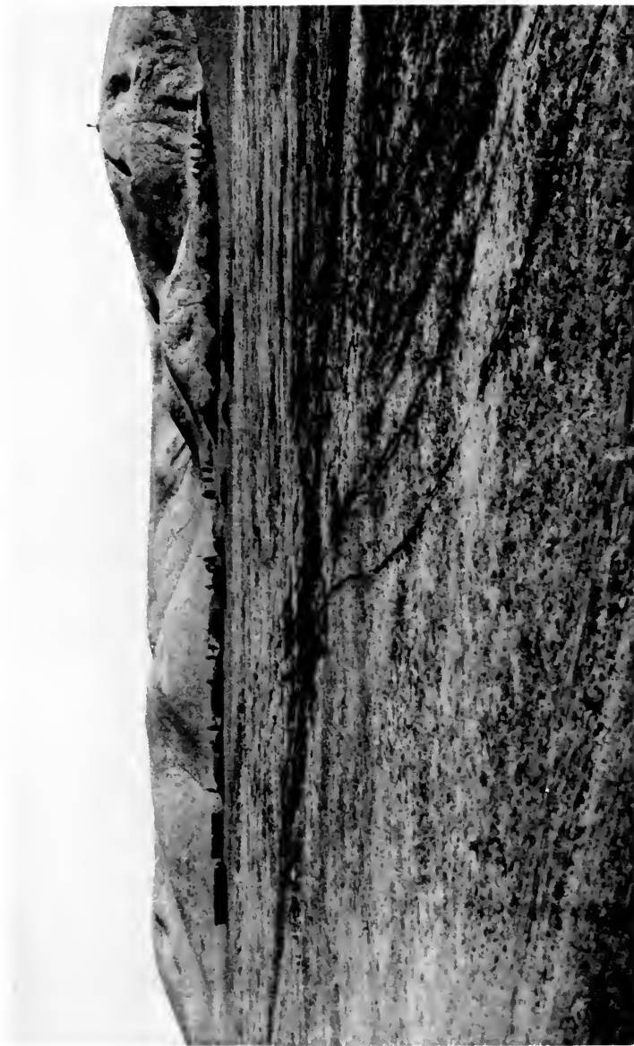
GENERAL VIEW OF THE MOUNDS AND EXCAVATIONS From the level of the plain