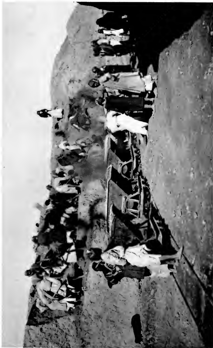
LOADING THE LIGHT RAILWAY TRUCKS