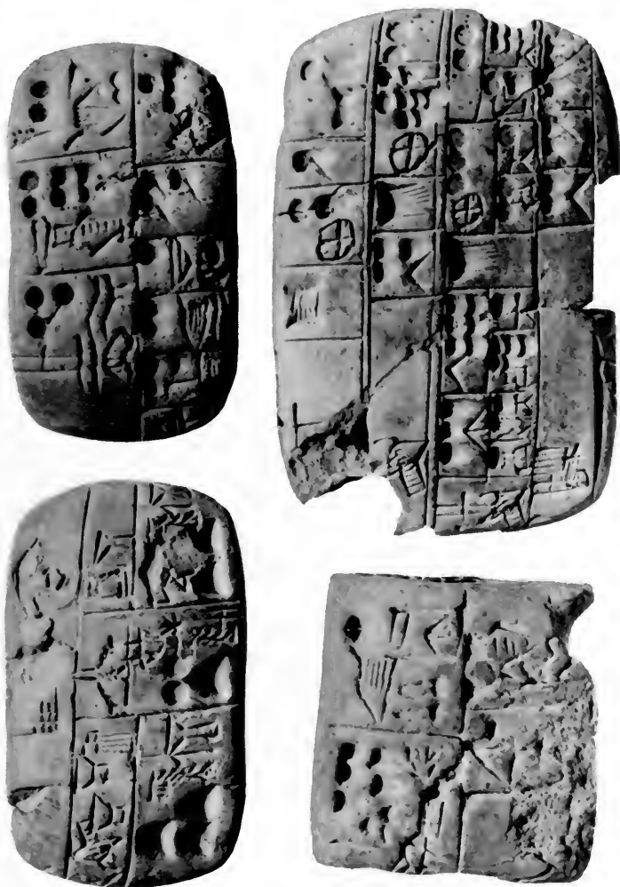
FOUR EARLY CLAY TABLETS In early pictographic script, from Jemdet Nasr