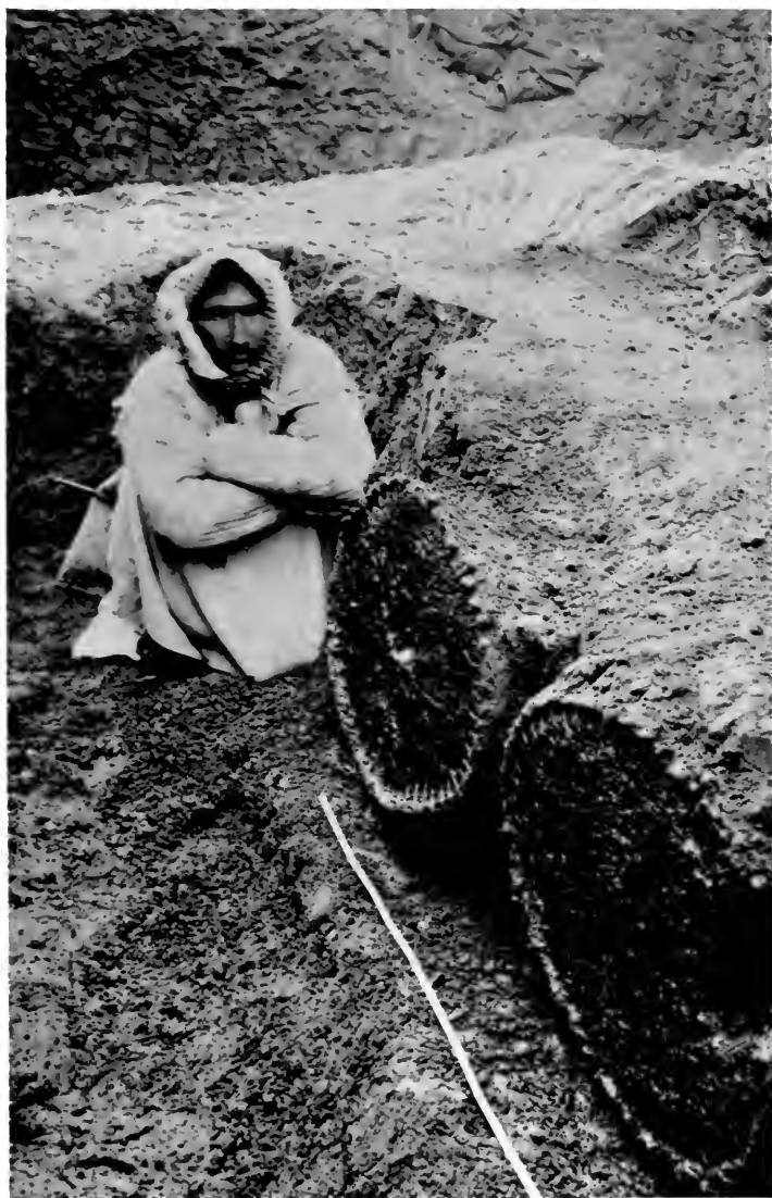
TWO CHARIOT WHEELS

Just exposed after excavation. Note the animal skeletons above