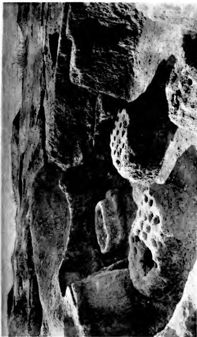
FOUR BREAD-MAKING OVENS Excavated at Jemdet Nasr