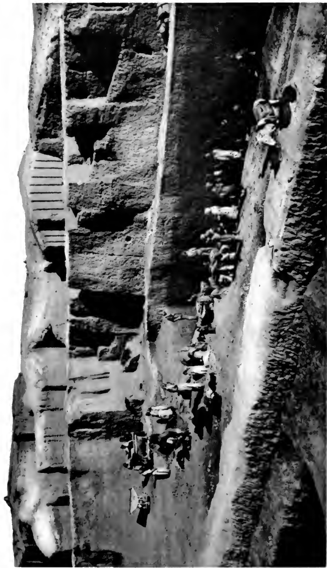
VIEW OVER "Y," TRENCH The temple of Nabonidus is visible in the upper section