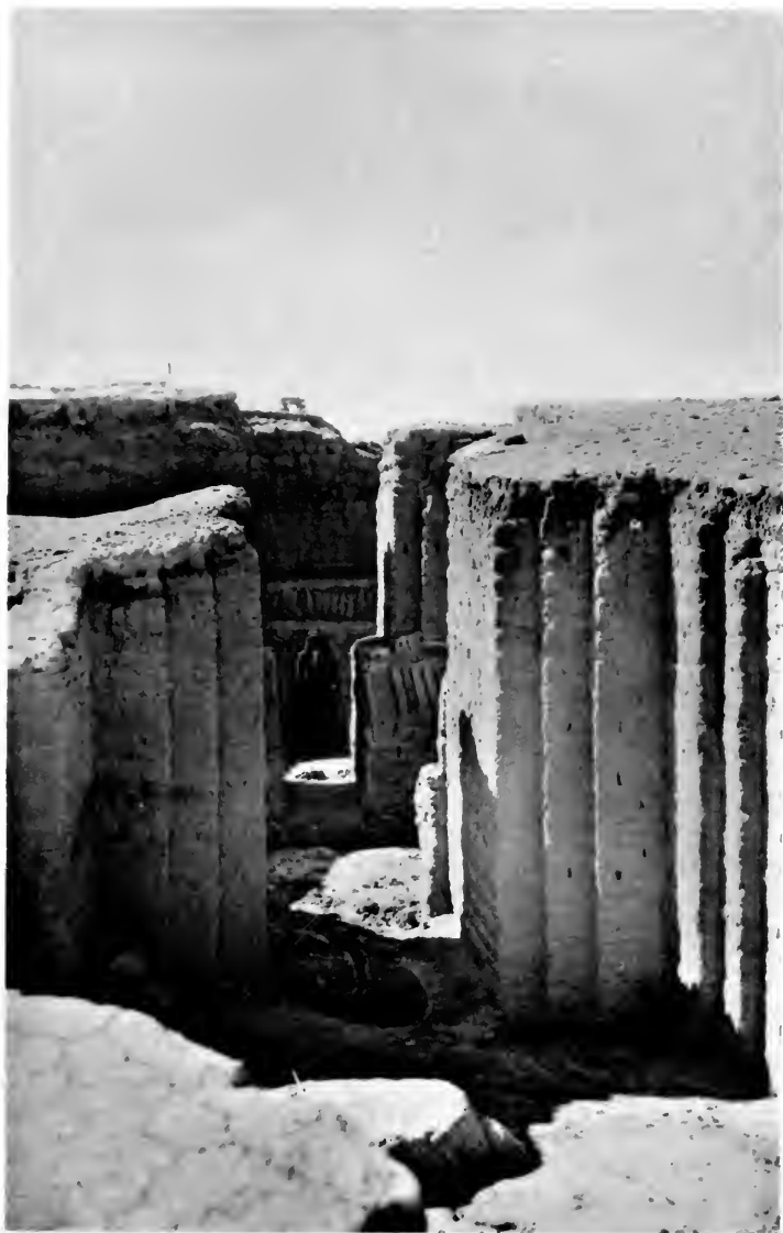
NORTHWESTERN ENTRANCE TO THE TEMPLE OF NABONIDUS