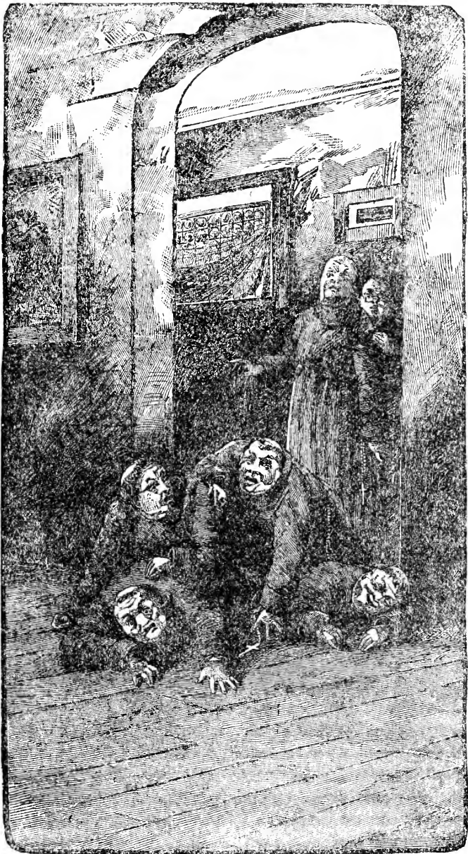
FALL OF THE "HOLY FATHERS."