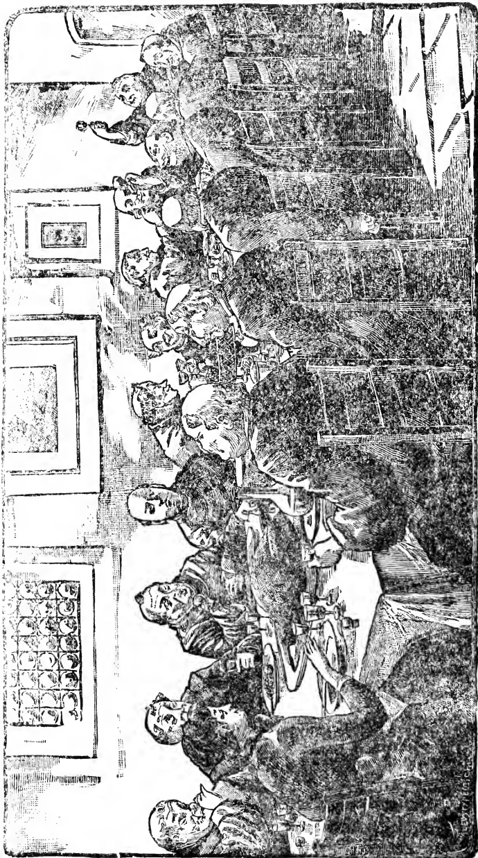
GRAND DINNER OF THE PRIESTS.