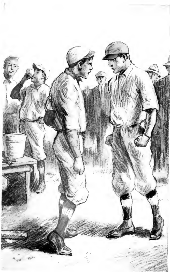
"I—I'm going to fight," Van said . . . [PAGE 176]