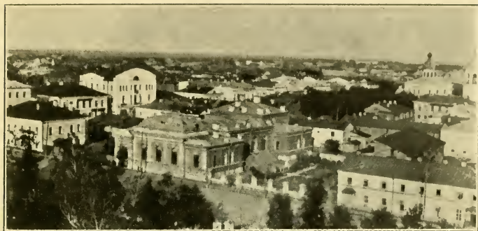
Archangel has many excellent and substantial buildings.