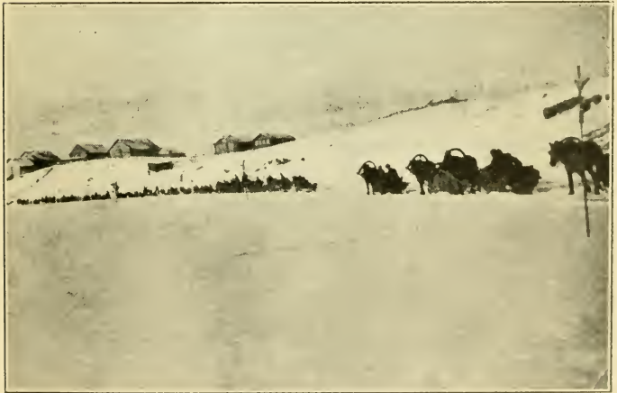
This was our only possible communication with Archangel, 300 miles to the north.