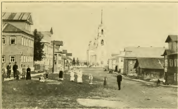
The church at Yemetskoye is visible for many miles up the Dvina.