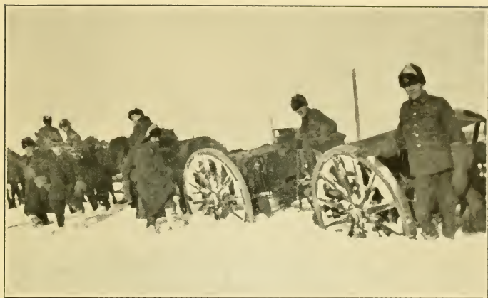
The Canadian artillery got there every time.