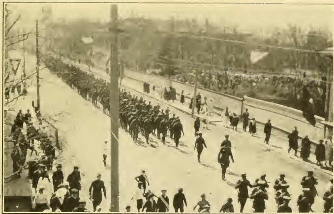
The new British army entered Archangel in June with great pomp and ceremony.