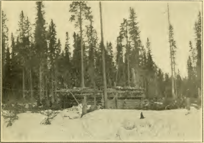
The American Engineers built scores of block houses like this.