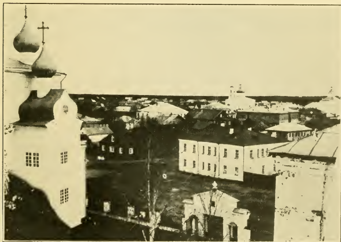
Shenkursk is a quiet and romantic spot on the Vaga River.