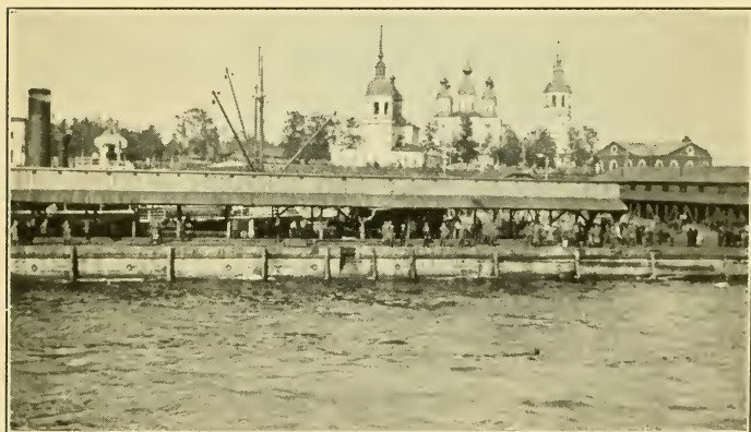
The Archangel water-front has miles of good docking facilities.