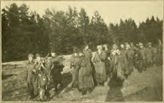
Bringing Bolsheviki prisoners into Malobereznik.