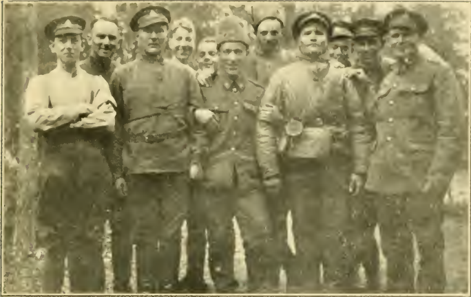
Canadian soldiers with two captives, having changed caps.