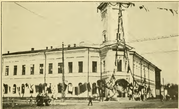
The Duma building at Archangel was decorated in honor of the new army that came to finish the Bolsheviki.