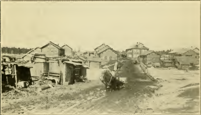
Russians love their homes and their villages devotedly.