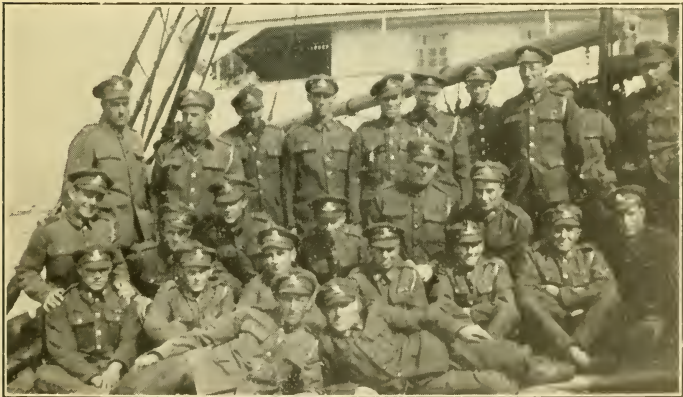
These Canadians fought in France before they went to Russia.