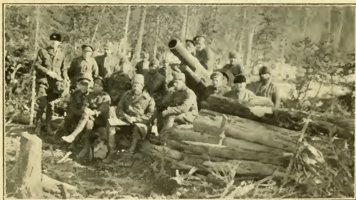
This Russian gun crew on the railroad front enjoys warmer weather.