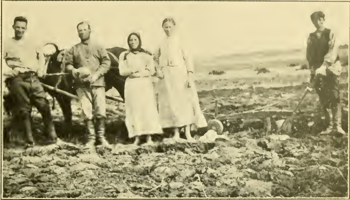
The women work in the fields with the men.