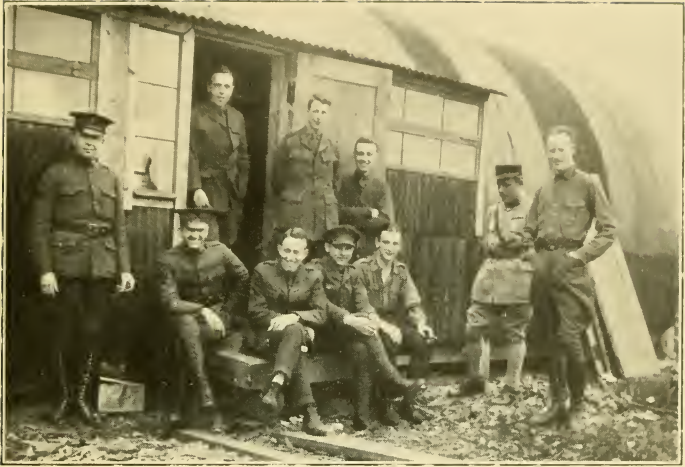
The "Y" was always on the job.