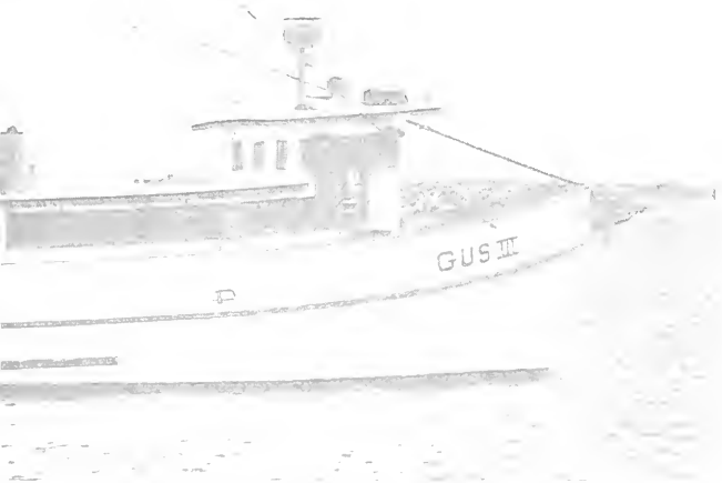
A shrimp trawler used by fishermen to exploit stocks of white, brown, and pink shrimp in the Gulf of Mexico. This vessel was chartered to assist biologists in their research on shrimp.