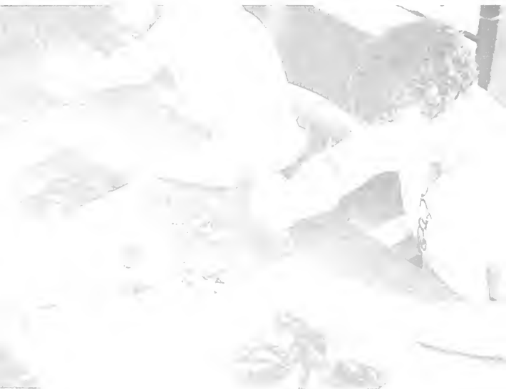
Shrimp that are caught, stained or tagged, and released on the job are handled by biologists provide information on migration, growth, and mortality when recaptured by fisherman and returned to the biologist. These men are staining shrimp aboard a shrimp trawler.

The major research of the Laboratory is directed at commercially important species of shrimp in the Gulf of Mexico through four research programs: (1) Shrimp Dynamics; (2) Shrimp Aquaculture; (3) Estuarine Studies; and (4) Gulf Oceanography. The programs are designed to: determine growth, survival, and movements of shrimp stocks; determine the maximum yield of the stocks of shrimp by deciding what size the shrimp should be when they are harvested; refine the methods developed for predicting the abundance of