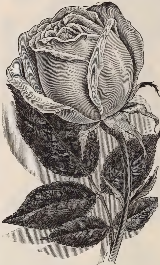
COMTESSE DE FRIGNEUSE.

This Rose is identical with Marie Van Houte, except that it is claimed to be twice the size. Of a fine faultless straw-yellow color, with the outer petals washed and outlined with a bright rosy crimson; occasionally the whole flower will be suffused with light pink. It grows vigorously, blooms freely, and is most deliciously scented. In cool weather it almost changes color, taking on gorgeous crimson tints. A beautiful and superb Rose. Price, 15 cents; large two year old plants, 30 cents.