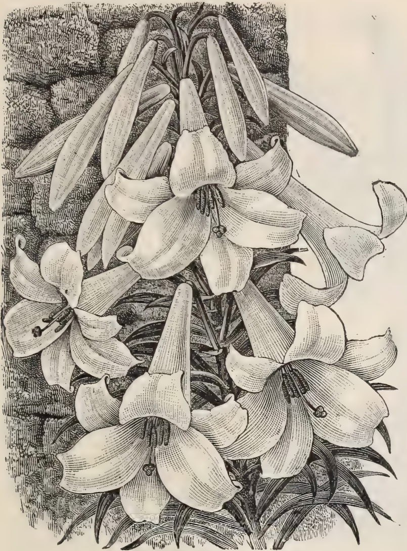
Bermuda Easter Lily.