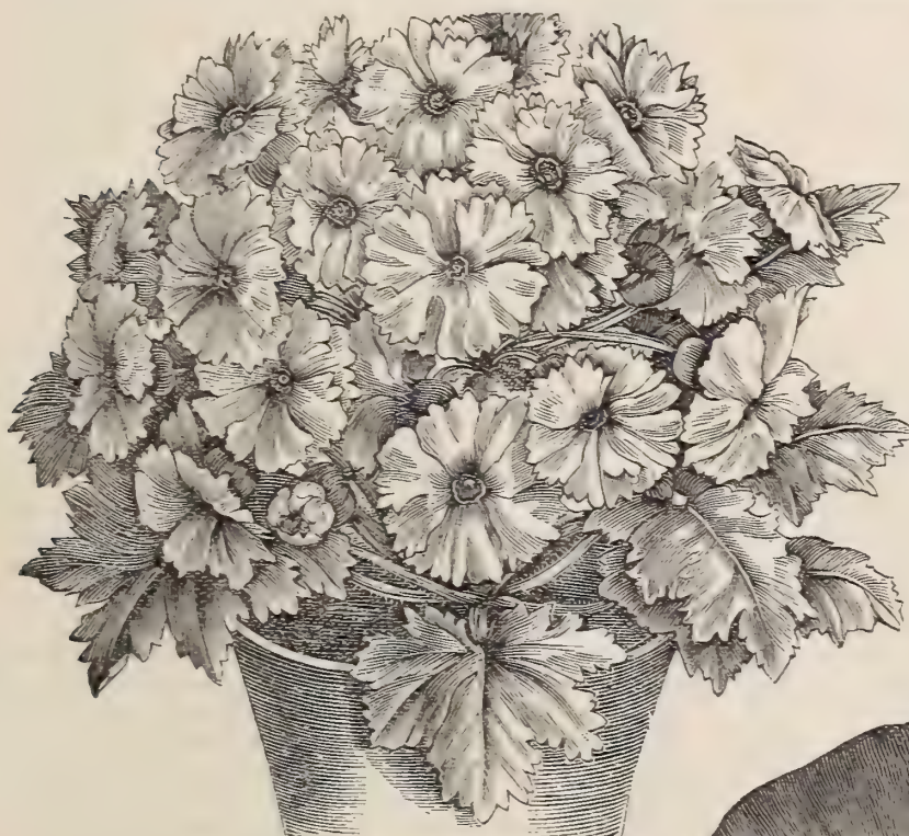
SINGLE CHINESE PRIMROSE.