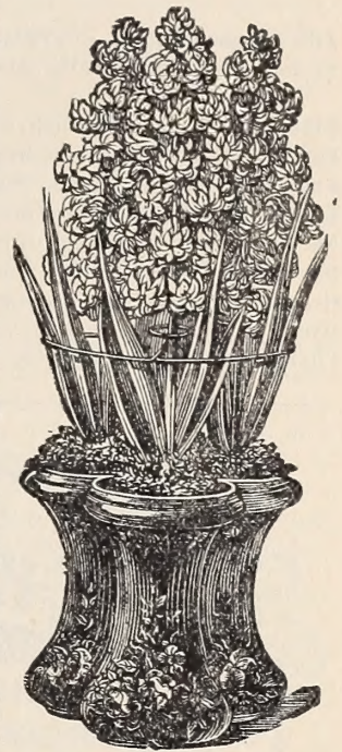
Hyacinths in Glass.

The bulbs should be placed in the glasses as early in the season as possible, keeping them in a cool, dark cellar or similar situation until the roots have nearly reached the bottom of the glass, which requires usually from six to eight weeks' time, after which the lightest and sunniest situation that can be had is the best; the water in the glasses should be changed two or three times a week, and in severe weather the bulbs must be removed from the window, so as to be secure from frost. After filling the glass with water, place the bulb so that the base only will touch the water.