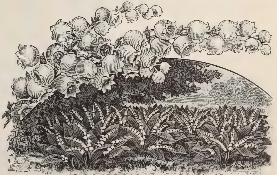
Lily of the Valley,

One of the most charming of Spring flowering plants, producing in profusion its delicate, bell-shaped, delightfully fragrant white flowers. It will thrive in any common soil, and will do well in shady situations, where few other plants will succeed. Five cents each; six for 25 cents.