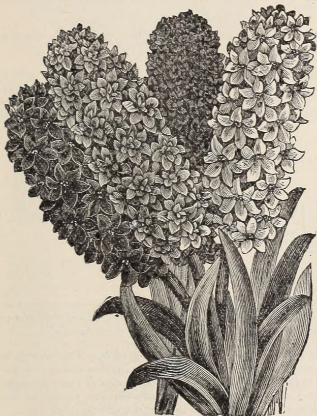
Single and Double Hyacinths.

B ULBS are the most important Winter bloomers for window culture. They are the easiest cared for of all flowers, and almost sure to bloom abundantly. Nothing is more pleasant or cheerful during a dreary Winter than a few pots filled with Hyacinths, Tulips, Crocus, Narcissus, etc., displaying their brilliant colors and delightful fragrance for weeks. Add to these the many new Bulbs which are now being cultivated for Winter flowers, and at a very little trouble or expense a display of Winter flowers can be produced which will be the center of attraction of any neighborhood.