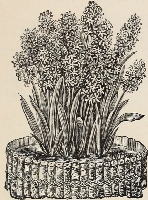
Cluster of Hyacinths.

The pots should then be set away in a cool cellar, or other convenient place where the temperature will range from forty degrees to fifty degrees, and covered to the depth of four or five inches with soil, sand or litter, where