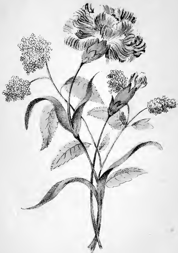
MICRONETTE PINK PINK BUD

Your qualities surpassing yours - but we have drawn from me a contest, not a prize