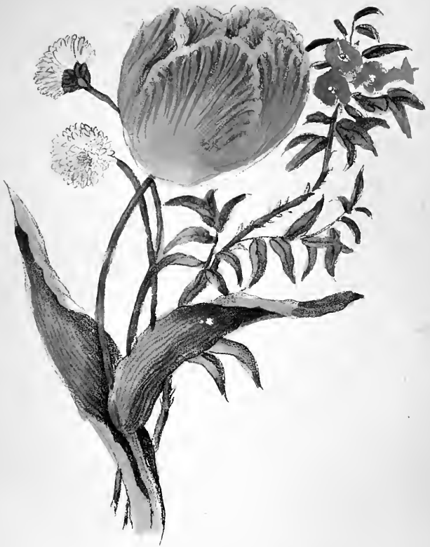
DAISY WALL FLOWER AND TULIP

Your innocence and fidelity in misfortune have caused me to declare my love for you