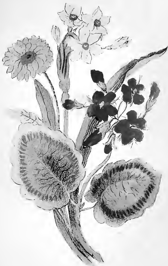
NARCISSUS, SCARLET, GERANIUM, MARIGOLD

Your self love and stupidity overleaps me