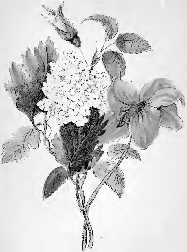
ROSE BUD, YELLOW LILY, LIAC

Leafless Year majestic beauty Has awakened my first emotions of love