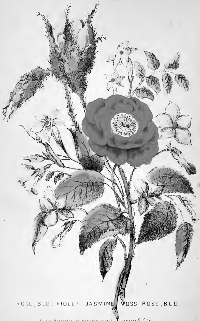
ROSE, BLUE VIOLET JASMINE, MOSS ROSE, BUD.

Your beauty, sweetness and amiability, Have drawn from me a confession of love