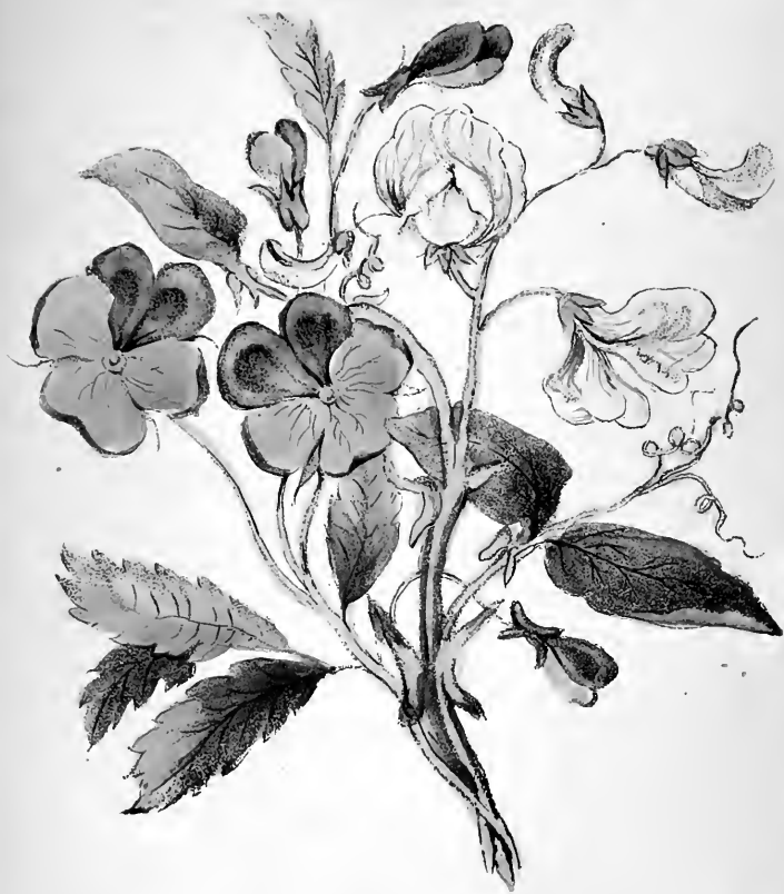
SWEET PEA PANSY.