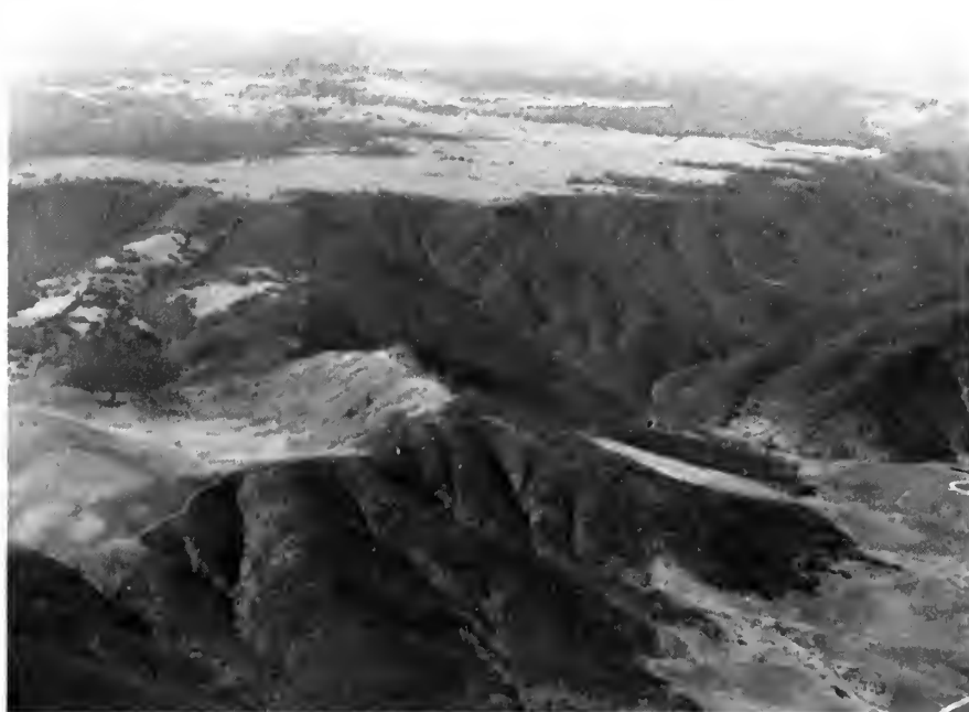
Fig. 2-3. -2. View of the Santa Rosa Plateau taken from Redonda Mesa showing chamise chaparral, grassland, and oak woodland communities. -3. Aerial view showing the topographic features of Mesa de Burro on the plateau.