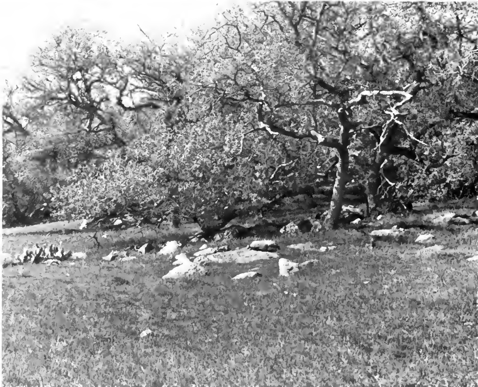
Fig. 6-7.-6. Southern oak woodland community. View facing southeast from the Tenaja Road within the Santa Rosa Plateau Preserve. -7. Close up of Engelmann oaks on the upper slope of a hill.