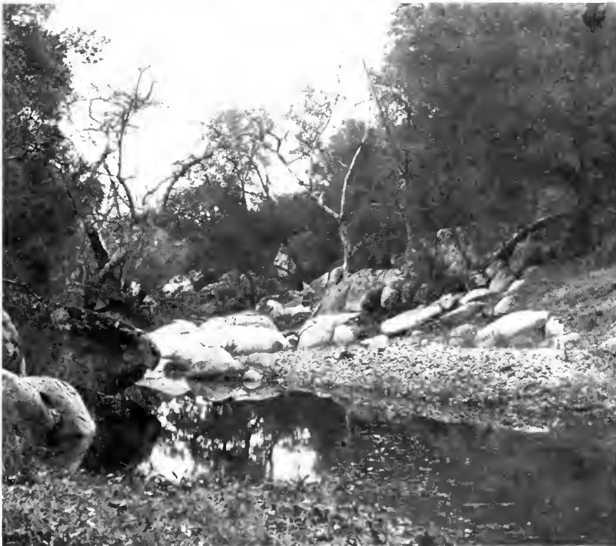
Fig. 8-9.-8. Southern California grassland. View looking north with Los Alamos Canyon and the Santa Ana Mountains in the background. -9. Riparian woodland in Cole Canyon.