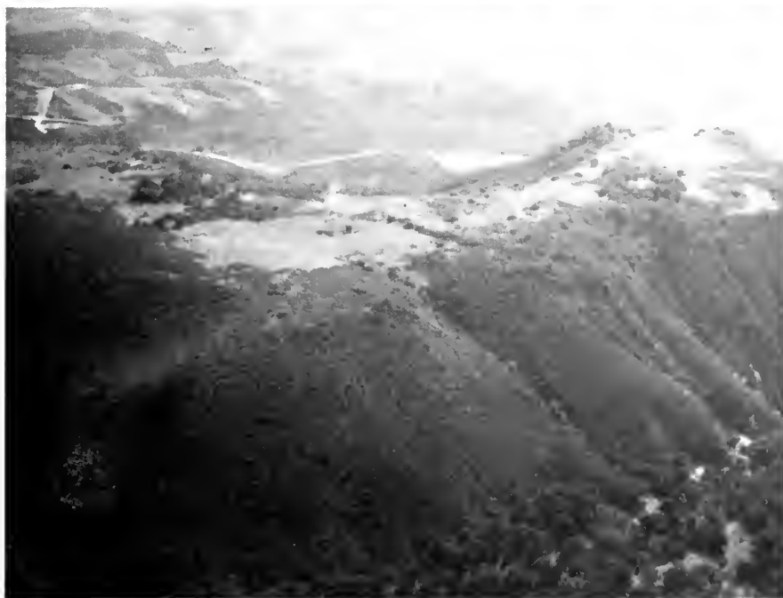
Fig. 4-5.-4. Aerial view of the four vernal pools on Mesa de Colorado. -5. Aerial view of Mesa de la Punta on the Santa Rosa Plateau Preserve.