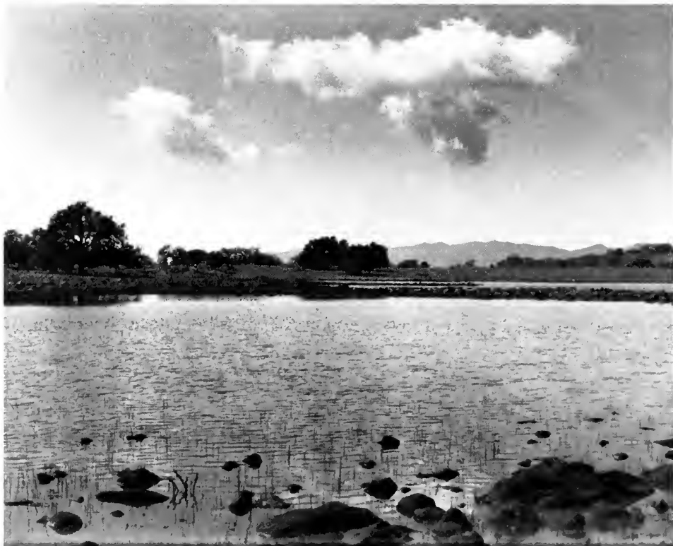
Fig. 10-11. -10. Fresh water aquatic community in a shallow depression on the upper east slope of Redonda Mesa. -11. Vernal pool on Mesa de Colorado.