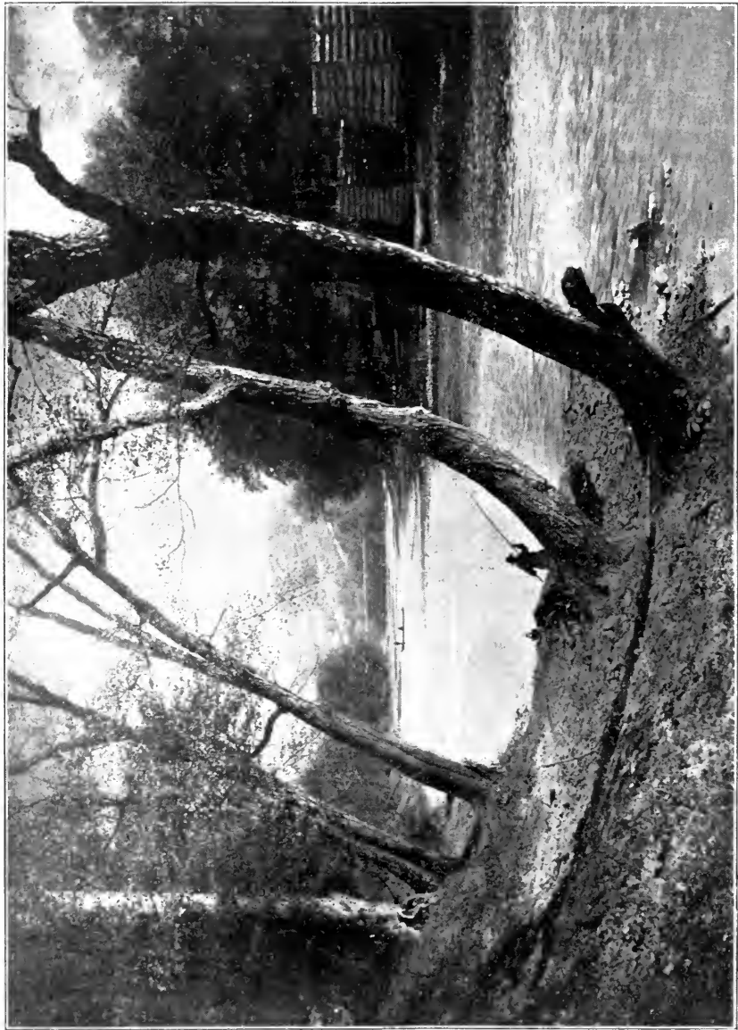
RIVER BIRCHES AT SUTTON, W. VIRGINIA. ( Betula Nigra L. )