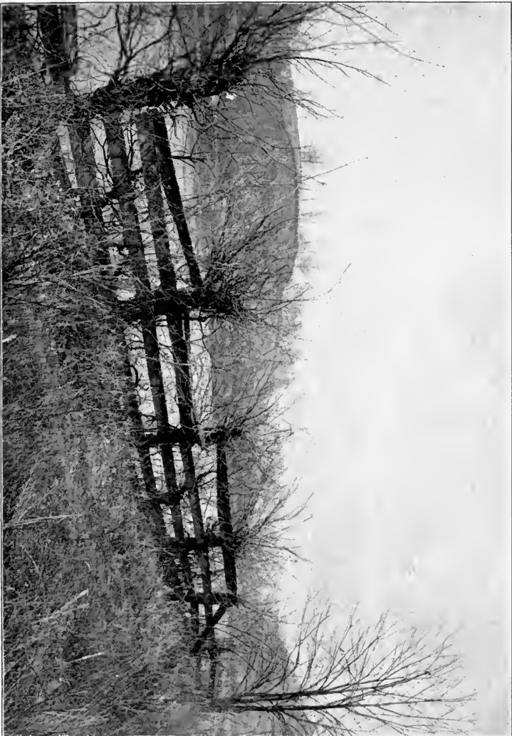
RHUS RADICANS Linn.