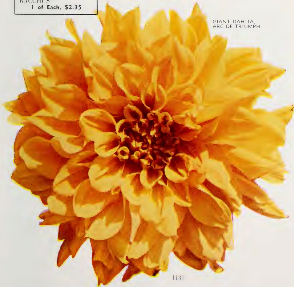
GIANT DAHLIA, ARC DE TRIUMPH