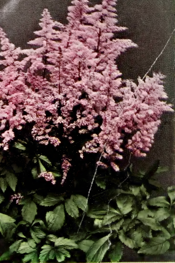
ASTILBE, PEACH BLOSSOM