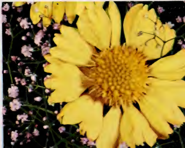
GAILLARDIA, SUN GOD and GYPSOPHILA, FLAMINGO