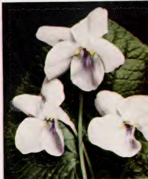
VIOLA, WHITE WONDER