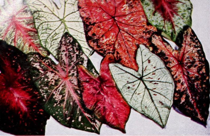
FANCY LEAVED CALADIUMS

CALADIUMS are grown for their "fancy" leaves. Decorative as pot plants indoors (about 20 inches tall), the plants may be transferred to the open when the weather warms. Or, plant the bulbs in the open ground after it is thoroughly warm. Garden site should be out of direct sun. Leaves are prized for arrangements.