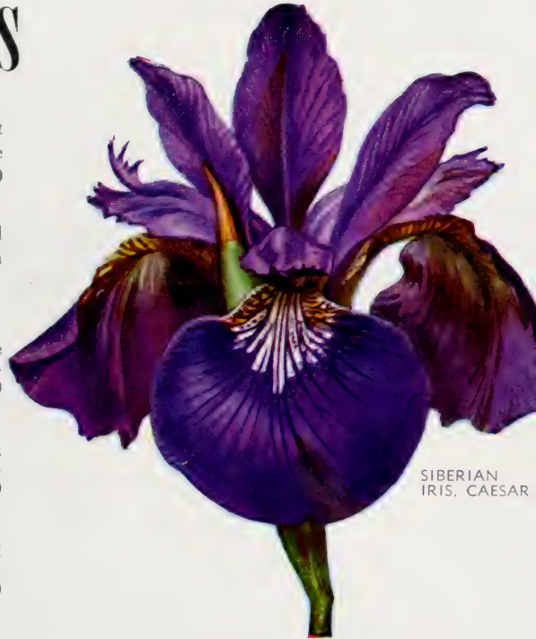
SIBERIAN IRIS. CAESAR

WHITE DOVE. Large pure white flowers produced in great abundance. Height 40 inches. Three $1.75, Doz. $6.00