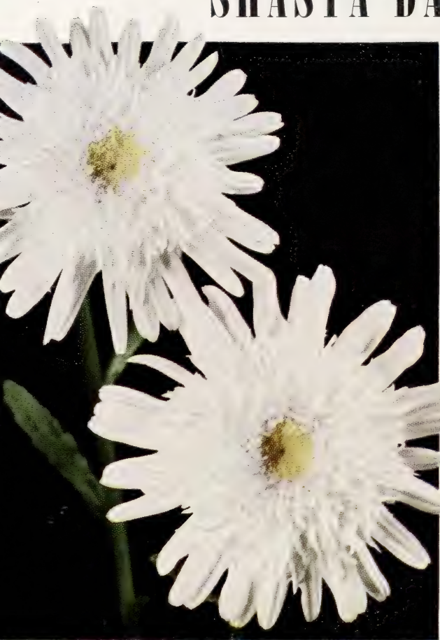
SHASTA DAISY, MOUNT SHASTA