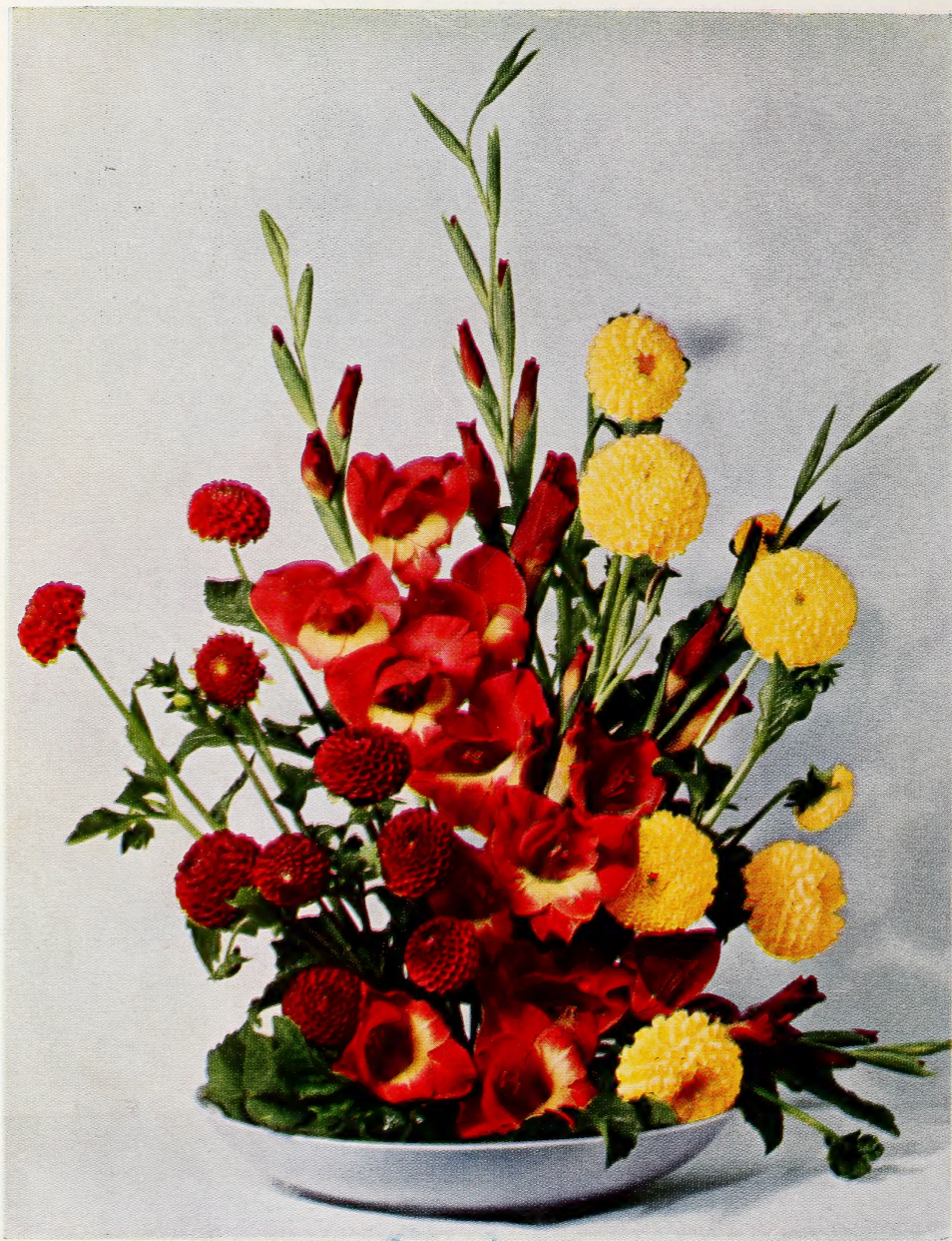
POMPON DAHLIAS CARDINAL AND YELLOW GEM WITH MINIATURE GLAD GREMLIN COMBINATION OF 10 GLADS AND 2 DAHLIAS FOR $4.00

FLOWERFIELD BULB FARM Box 90 Oyster Bay, Long Island, N.Y.