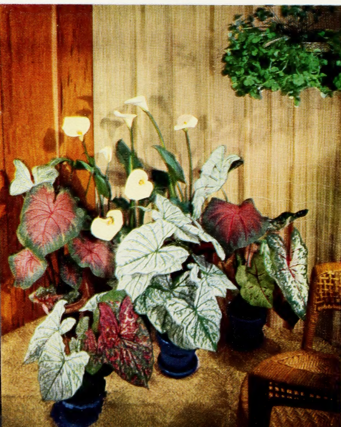
A COLOR PLATE FROM THE BOOK, "BULB MAGIC IN YOUR WINDOW"