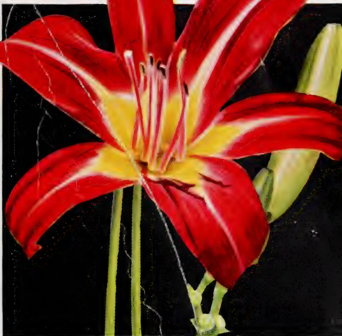
HEMEROCALLIS, RED SOX