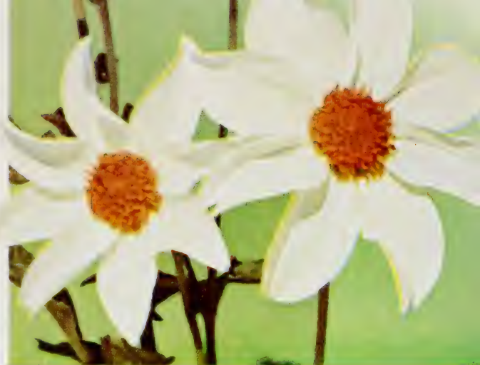
SINGLE DAHLIA, SNOW PRINCESS

SNOW PRINCESS. Large 3½ to 4-inch blooms of pure white with golden centers. Plants are 3 feet in height, producing quantities of beautifully formed flowers.