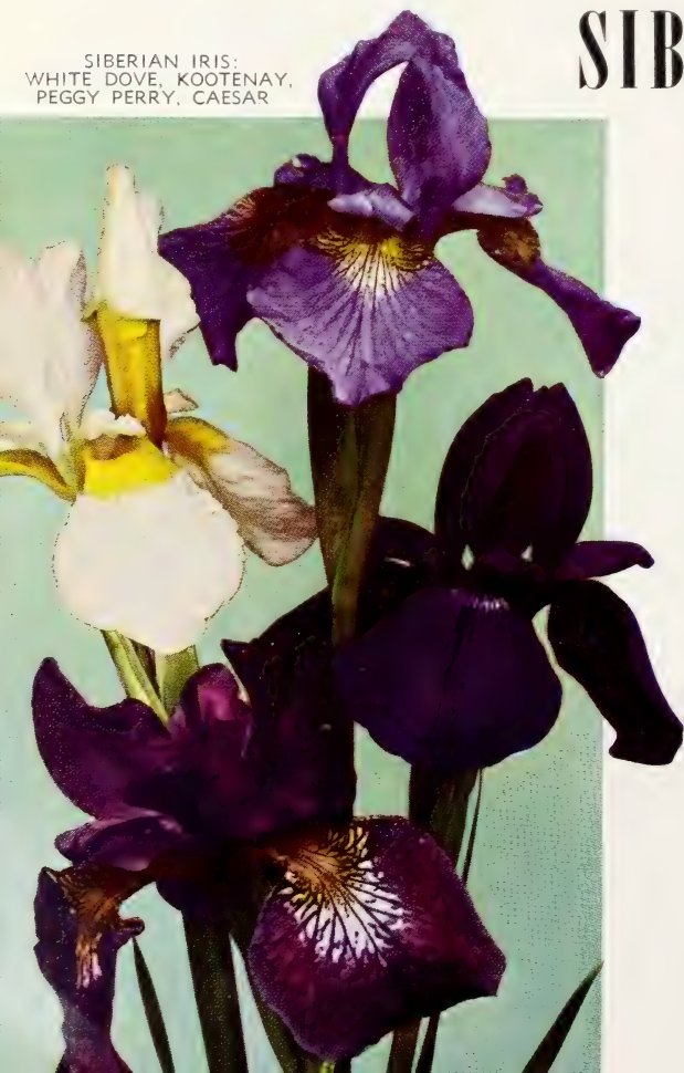
SIBERIAN IRIS: WHITE DOVE, KOOTENAY, PEGGY PERRY, CAESAR

GOLD DUST. Lovely flowers of bright golden yellow on low growing plants, 24 inches. Excellent for flower beds. Bloom in May. Each 75c, Three $1.50