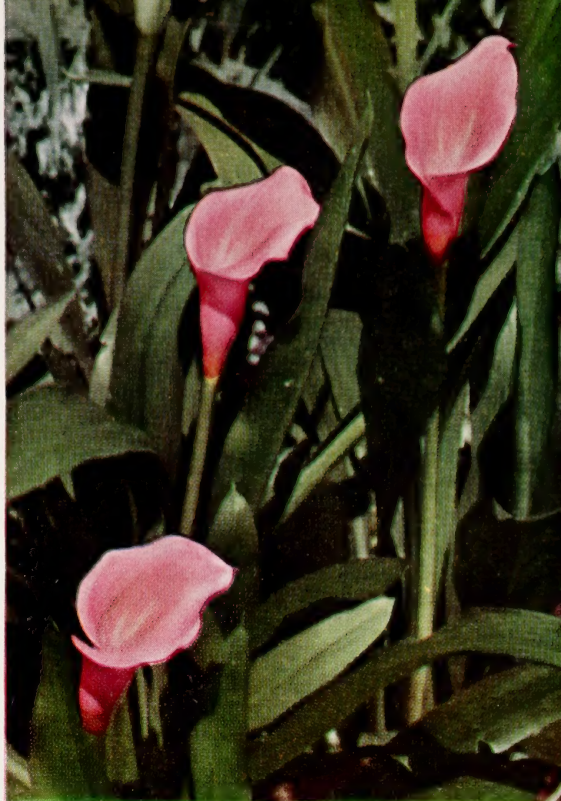
PINK CALLA, REHMANNI