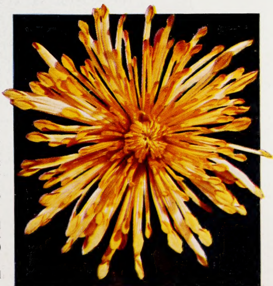
SPOON CHRYSANTHEMUM, REMEMBER ME