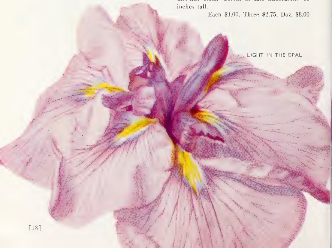
LIGHT IN THE OPAL