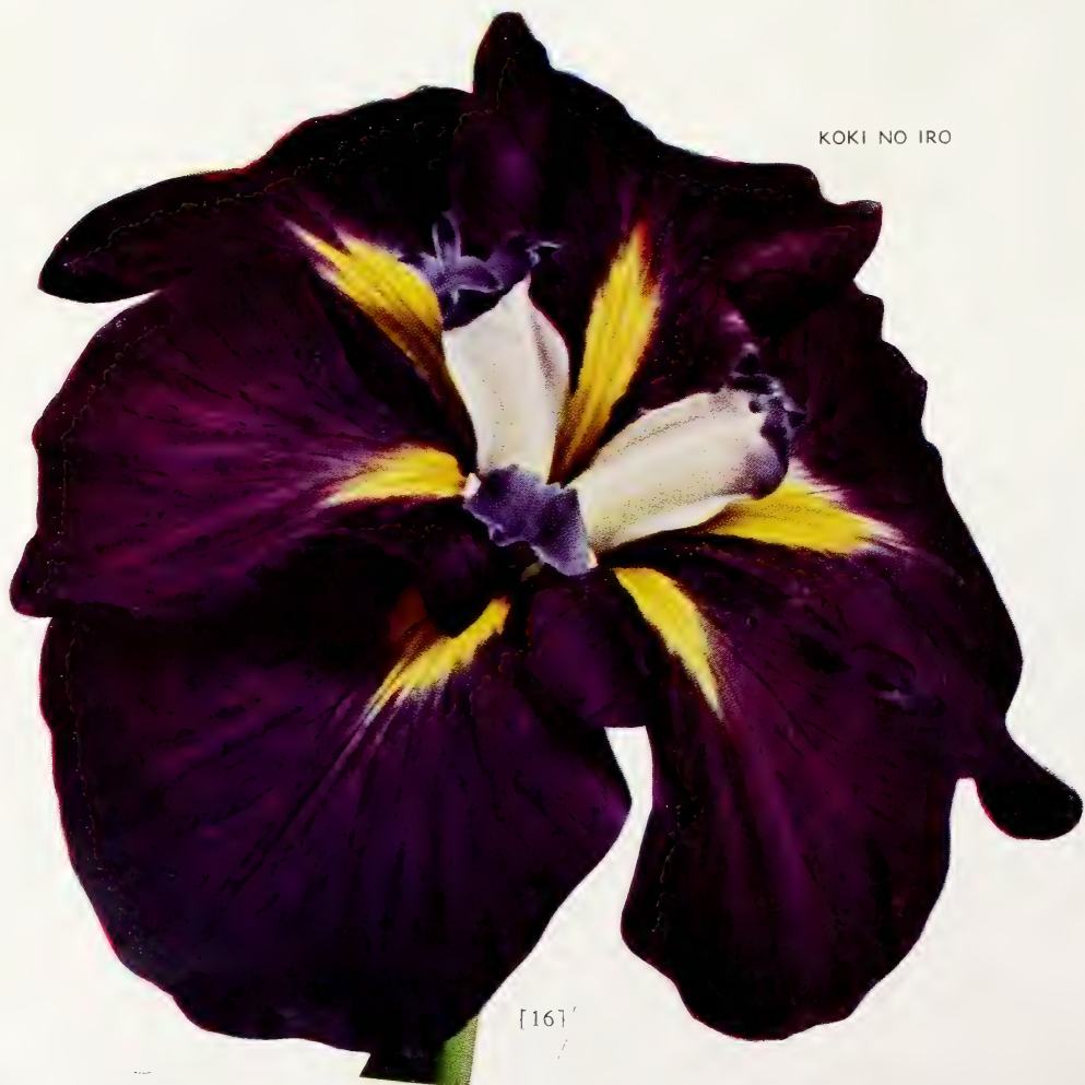
KOKI NO IRO