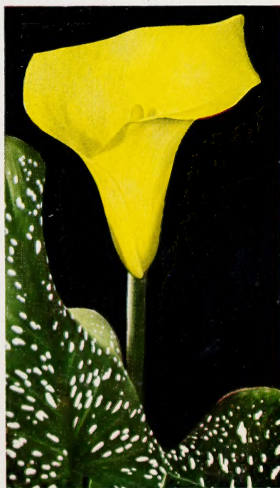
YELLOW CALLA, ELLIOTTIANA