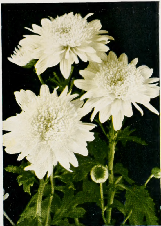
SHASTA DAISY, MOUNT SHASTA

WIRRAL SUPREME. A new variety; enormous flowers 4 inches in diameter, fully double center and long florets. The plant grows 2½ to 3 feet high, bearing an average of up to 50 flowers. Each $1.00, Three $2.50