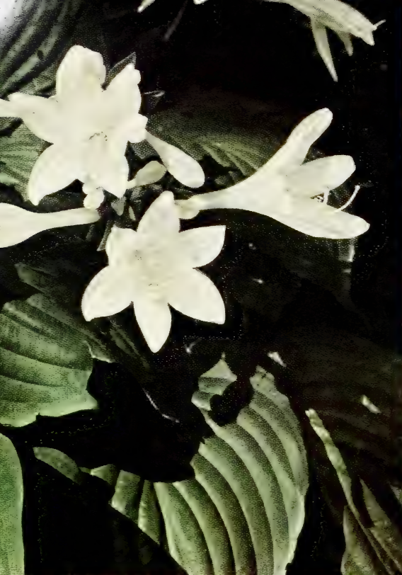
HOSTA SUBCORDATA GRANDIFLORA ALBA