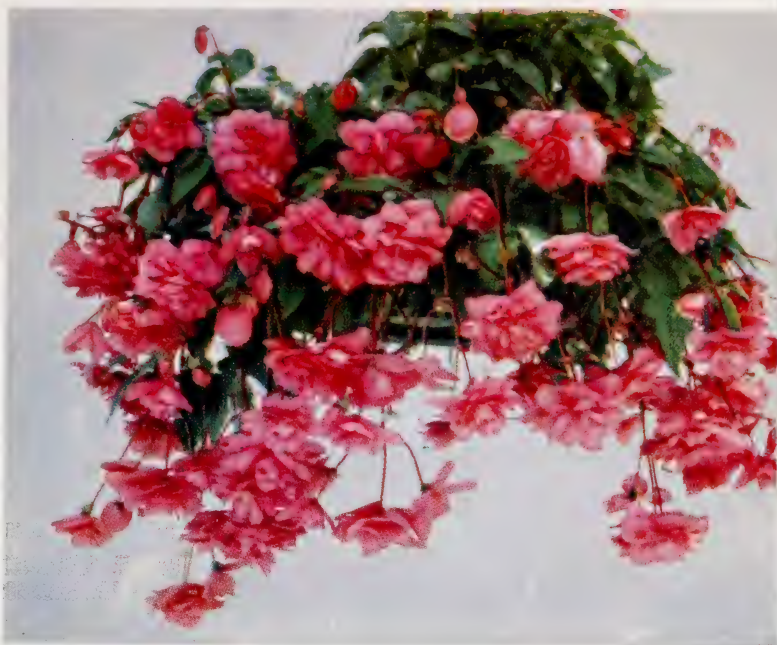
HANGING BASKET BEGONIAS