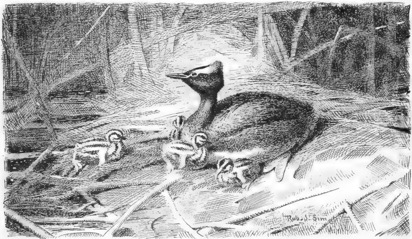
FIG. 3.—Horned grebe.

From this survey of the food of the Holboell grebe it appears that though fish formed slightly more than half the sustenance of the individuals examined, this fact is of small significance, as the species taken are in the main of little commercial value. These birds have no special predilection for food fishes valuable to man, but are merely in search of something to satisfy hunger, so that to them a sculpin is as valuable as a species considered more edible by man. As these common forms of little worth are found in abundance, they often furnish a ready supply of food. It can not be considered, therefore, that this grebe is in any true sense an enemy of the fishing industry, while it is probable that, when more material is available for the summer months, when the birds are in the shallow fresh-water inland lakes, insects and crustaceans will be found to furnish a much larger proportion of the food than is indicated above.