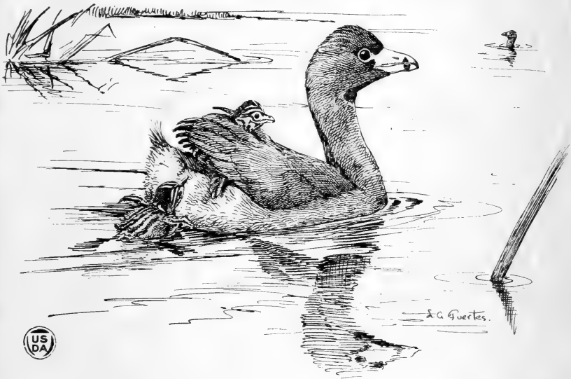
FIG. 4.—Pied-billed grebe.

The pied-billed grebe, the most widely distributed species of its family occurring in the United States, ranges over most of North and South America where suitable conditions are found. In North America it breeds as far north as Canada, though in the southern part of the United States it is often local in distribution. While