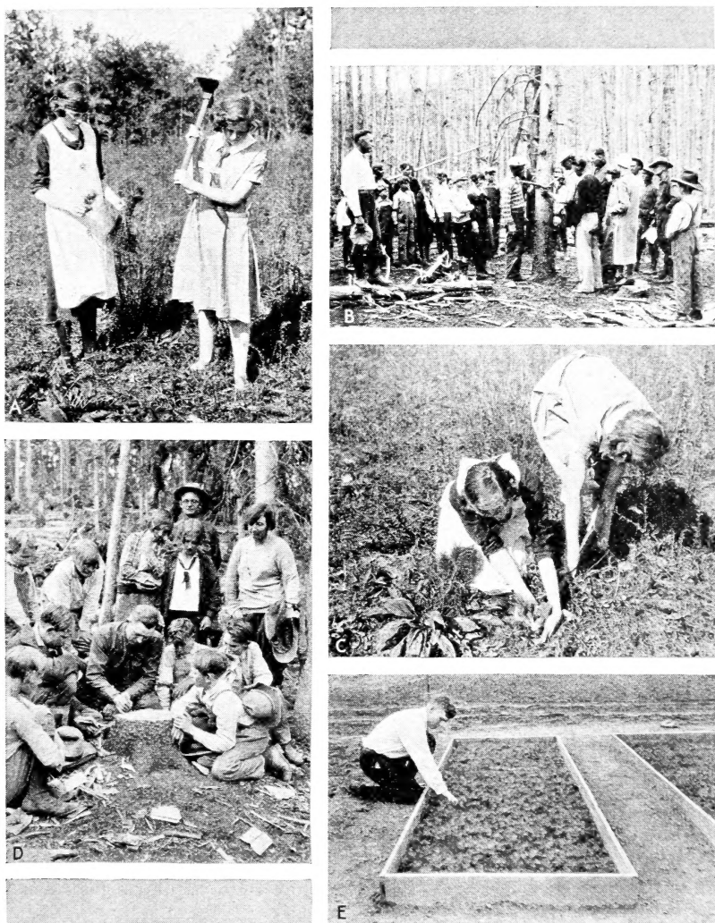
FIGURE 1.—4-H CLUB MEMBERS ENGAGE IN FOREST WORK

Forestry was adopted as a standard project by the New Hampshire 4-H organization in 1924, and enrollment in the forestry clubs has