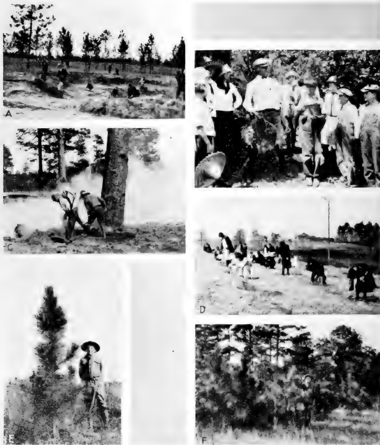
FIGURE 2.—FUTURE TAXPAYERS LEARNING WHY AND HOW TO HAVE THRIFTY FORESTS

A, Agricultural high-school boys planting slash pine on school grounds; B, 4-H club members on tree identification hike with forest ranger; C, Boy Scouts help forest officers in fighting fire, D, high-school girls do their bit in planting school grounds; E, 3-year-old slash pine protected from fire on Boy Scout tract; F, slash pine grown from seed on Boy Scout tract.