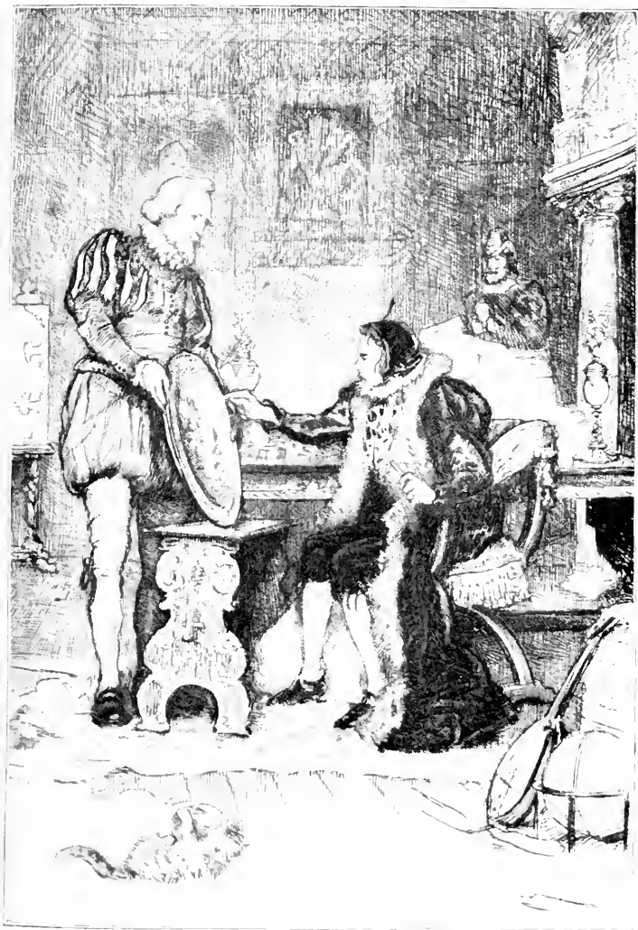
HERIOT AND THE KING.