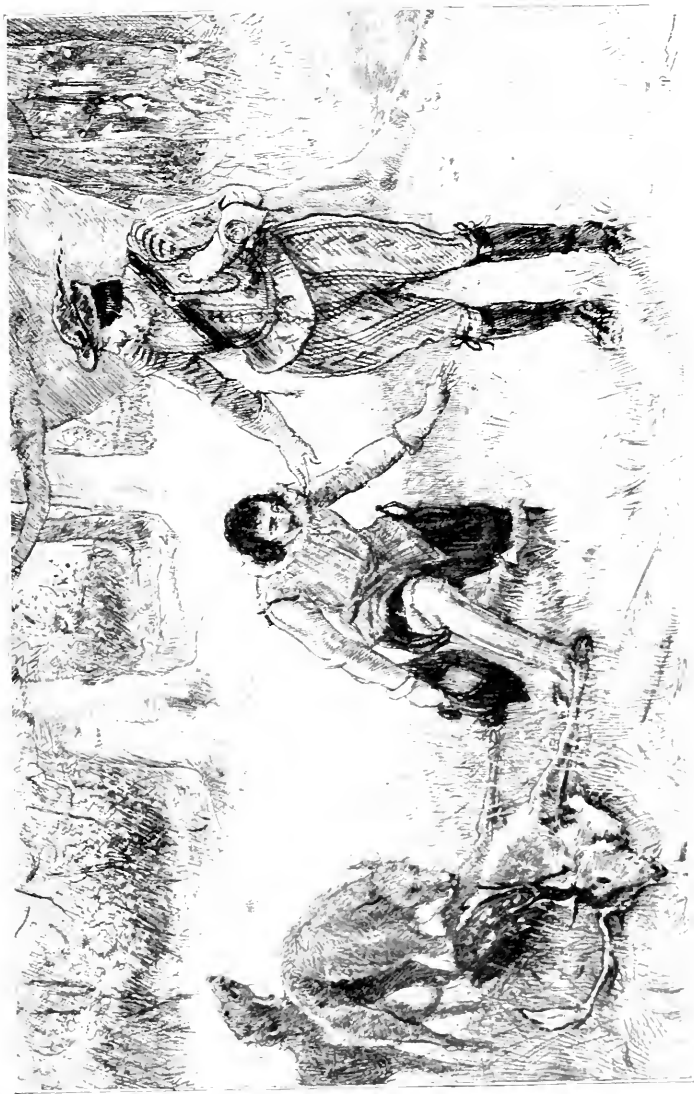
NIGEL AND THE KING.