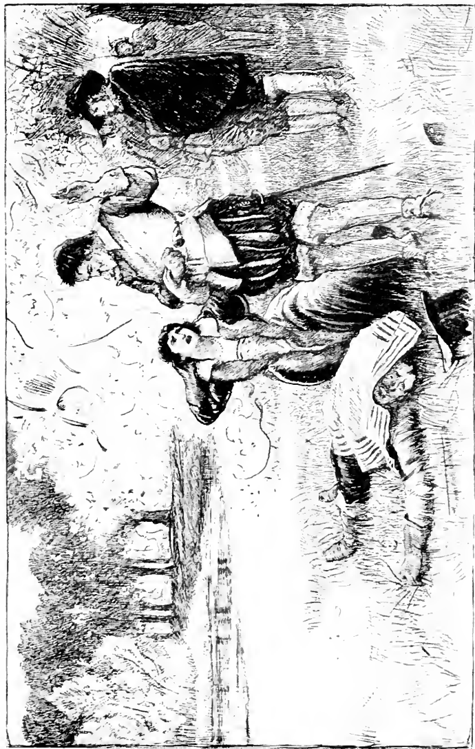
DEATH OF DALGARNO.—Drawn by R. W. Macbeth, A.R.A.