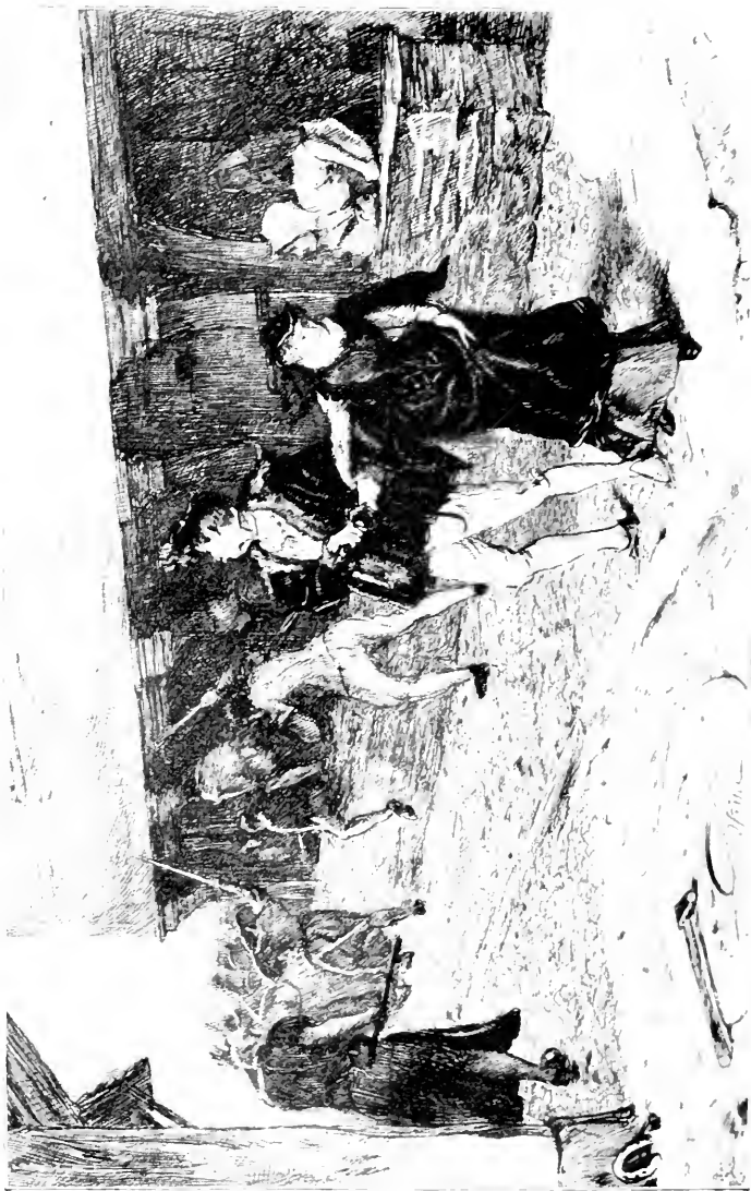
THE PRENTICE FIGHT. Painted by John Pettie, R.A.