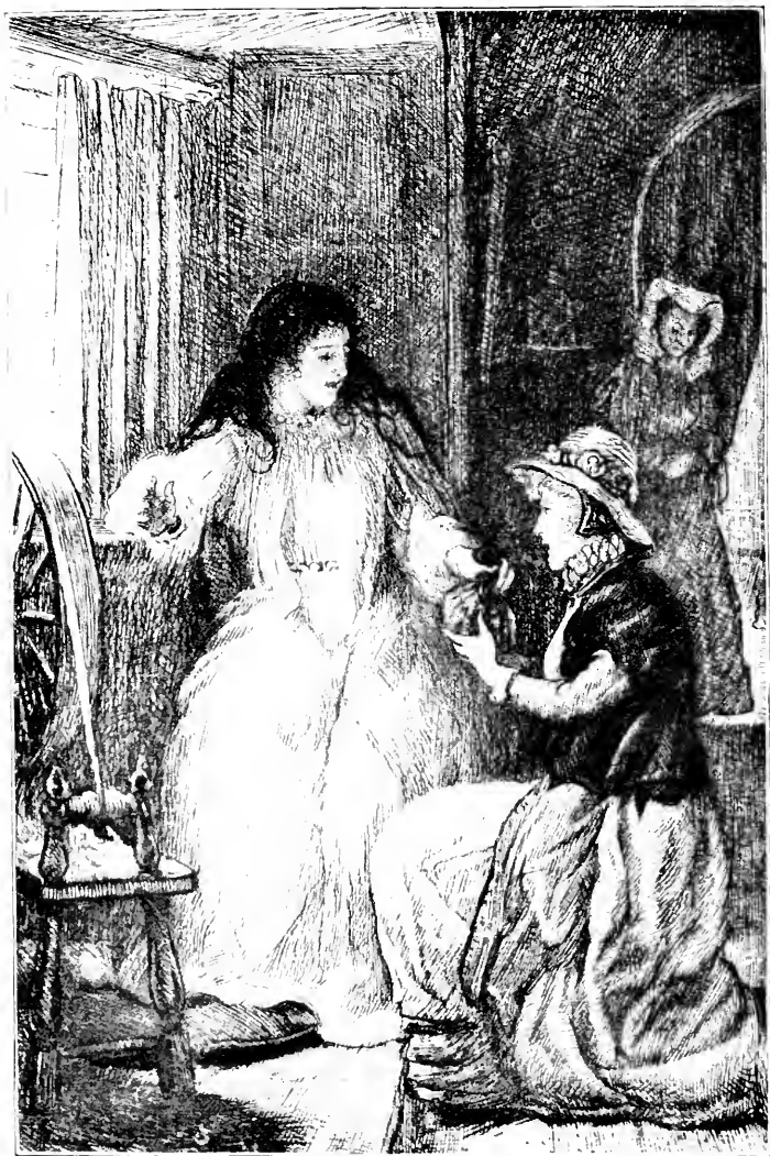
MARGARET AND THE LADY HERMIONE.