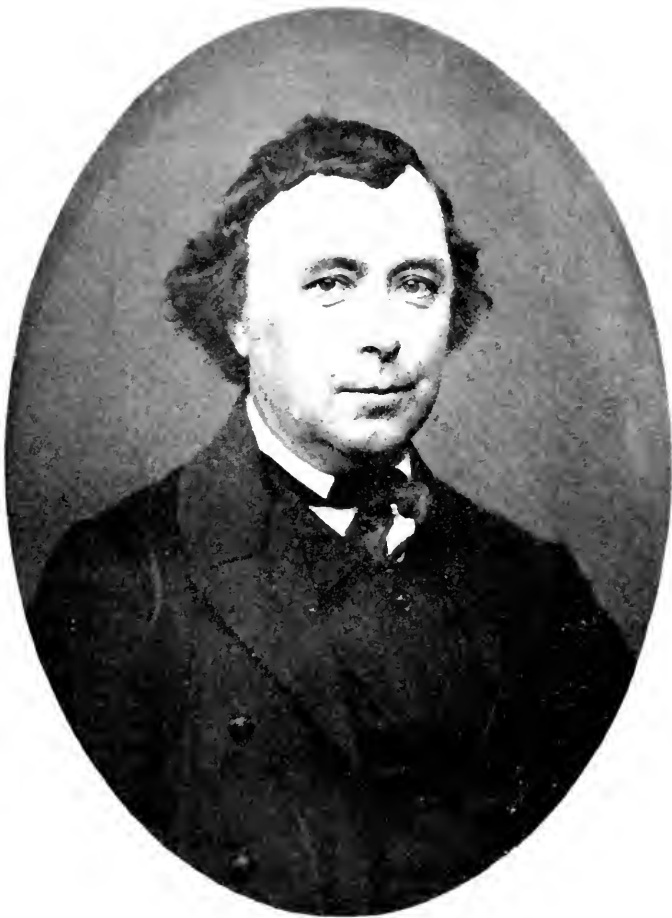
FATHER CHINQUY AT 50 YEARS OF AGE