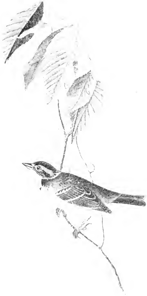
ONE OF TWO ORIGINAL WATER COLOR DRAWINGS BY AUDUBON DESIGNED FOR HIS BIRDS OF AMERICA