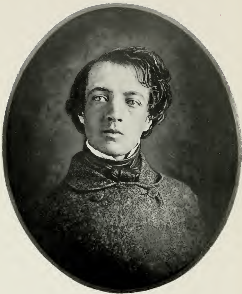
Frederick Law Olmsted in 1850