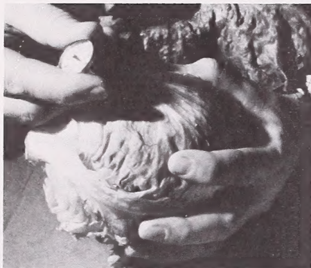
The pulp temperature of lettuce is taken as part of the grading process.