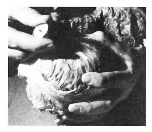
The pulp temperature of lettuce is taken as part of the grading process.