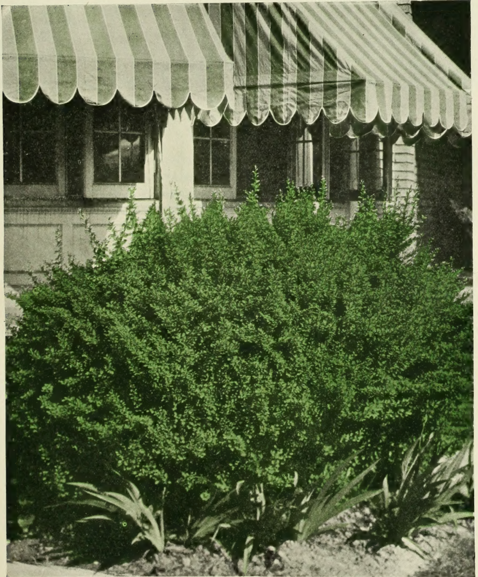
Japanese Barberry in Spring