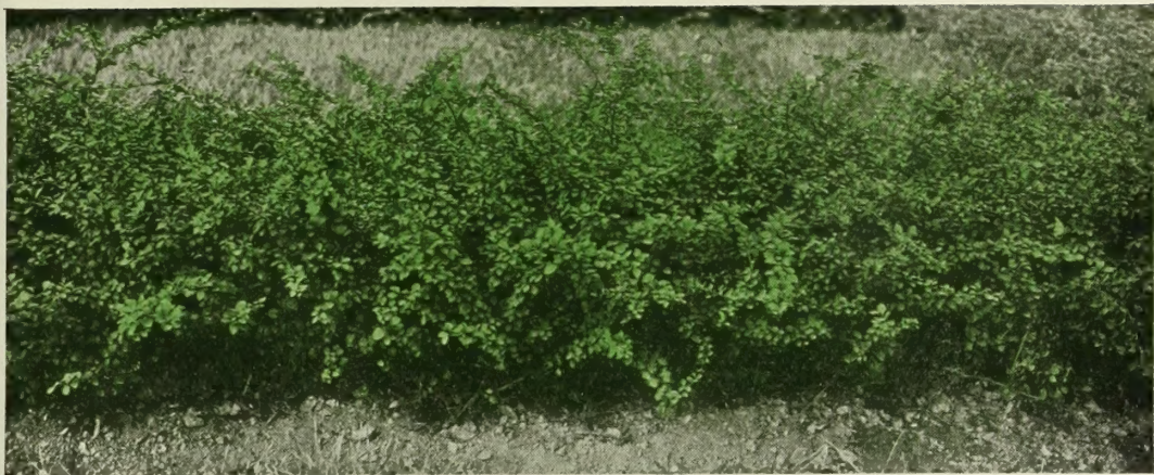
Thunberg's Japanese Barberry—the best hardy hedge.

Barberry is "A thing of beauty and joy forever." It requires no trimming and a minimum of care which is amply repaid by its all year beauty. In the summer the intense vivid green of its beautiful foliage is striking indeed; in the autumn this foliage takes on the most beautiful tints of crimson and gold, and the winter is brightened by the profusion of bright scarlet berries, which also serve as food for the song-birds when food is hard to find.