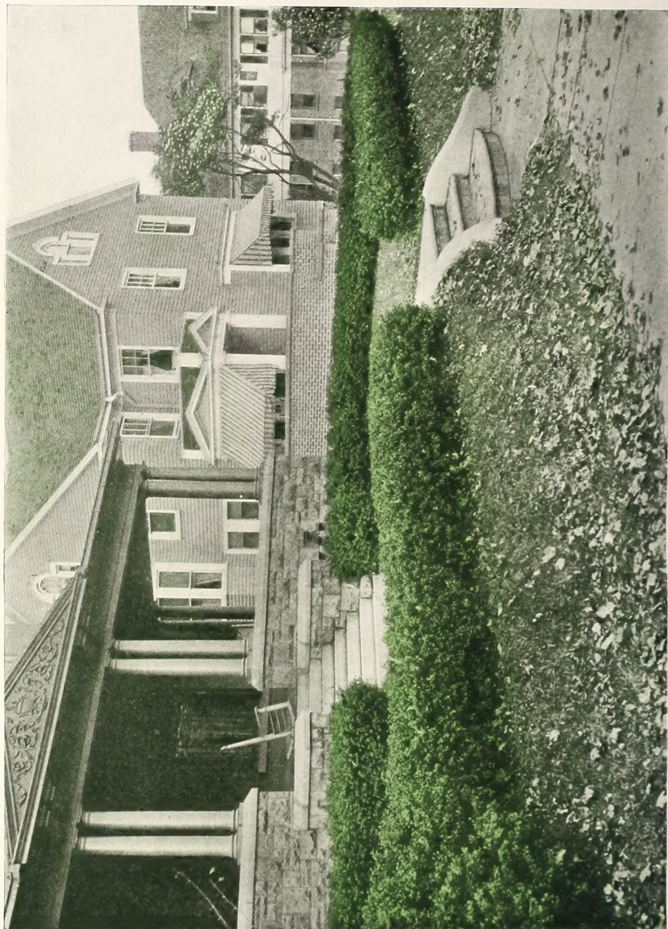
Japanese Barberry Thunbergii in the Fall—Beautiful at all seasons of the year.