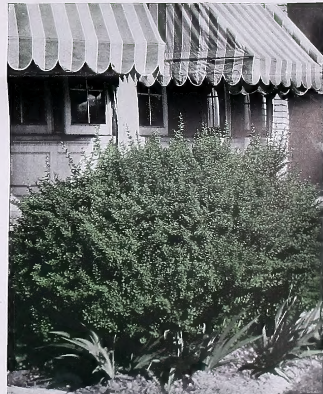
Barberry Foundation Planting

Every salesman of ours can tell his customers that no matter whether they order one or one hundred thousand, these plants—every single one of them—carry our customary guarantee. We will replace absolutely free any plant which fails to grow.