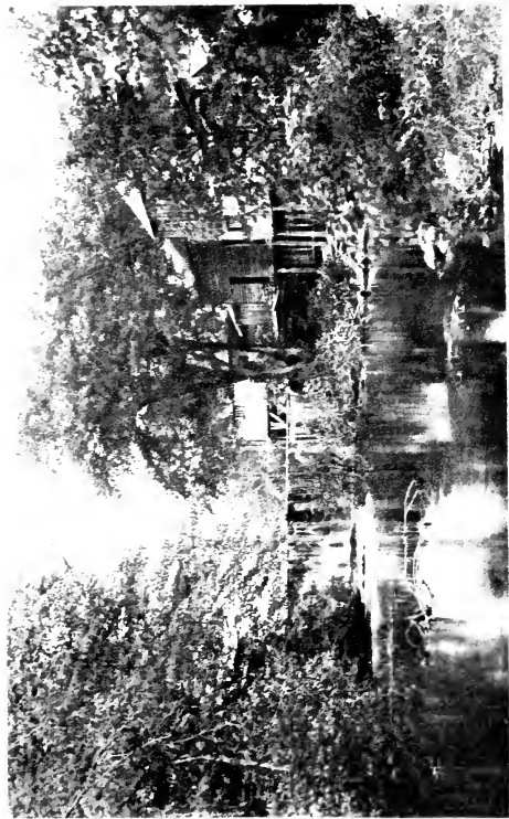
THE MILL AT MILL