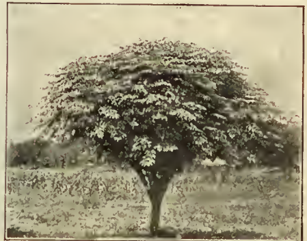
Texas Umbrella Tree at Fruitland (see opposite page)

Annularis, or Ring-Leaved. Of rapid growth, erect, and with leaves singularly curled like a ring. Very odd. 25 cts. each, $2 for 10.