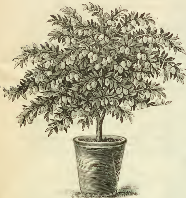
Kinkan, or Kum Kwat Oranges