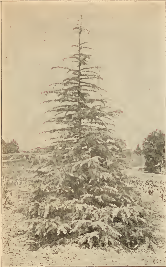
Cedrus deodara at Fruitland