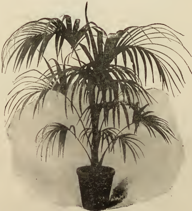
Kentia Belmoreana (See page 46)

☞ Those unfamiliar with Palms will do well to allow us to select for them, as our experience enables us to send out plants which will be most hardy and effective, and show the greatest distinction in any location.