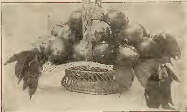
Red Nagate and Abundance Plums at Fruitland

Red Nagate, Red June, or Long Fruit. Pointed; 1\frac{3}{4} by 1\frac{1}{2} inches; skin thick, purplish red, with blue bloom. Flesh yellow, solid, somewhat coarse-grained, juicy, subacid, with Damson flavor; clingstone; quality good. Very prolific, showy and attractive in color. It ripens a week before Abundance, and is the earliest large-fruited market variety. Keeps well. Splendid shipper.