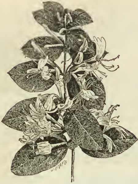
Spray of Honeysuckle