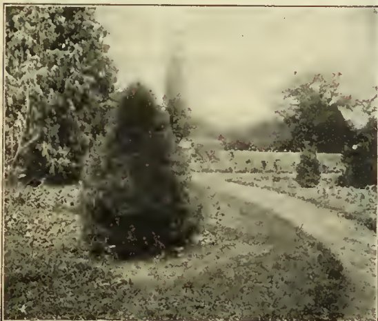
Biota Japonica filiformis at Fruitland

Thuja globosa . Of spherical and compact growth. Ultimate height, 4 to 6 feet. 25 to 50 cts.