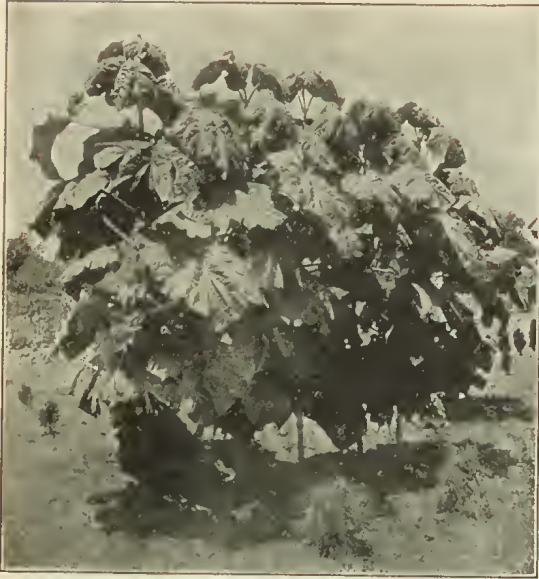
Paulownia imperialis at Fruitland