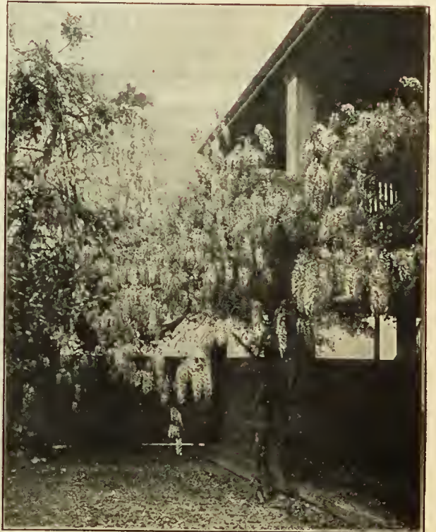
Wistaria Sinensis at Fruitland

Frutescens magnifica. Flowers in long tassels, pale blue; blooming later than the Chinese varieties, and also producing flowers during the summer; extremely vigorous.