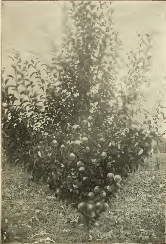
Four-year-old Kieffer Pear Tree at Fruitland.

from Sept. to Oct. Tree very vigorous and very prolific. Begins to bear when four years old. As a fall Pear, there is no variety as yet disseminated which has given such profitable returns, and the wonderful fertility of the trees is surprising. Many of our trees, four years after planting, have yielded as high as three bushels of perfect fruit. If allowed to hang upon the tree until the beginning of October, and then carefully ripened in a cool, dark room, there are few Pears which are more attractive. In point of quality it combines extreme juiciness with a sprightly subacid flavor and the peculiar aroma of the Bartlett; it is then an excellent dessert fruit.