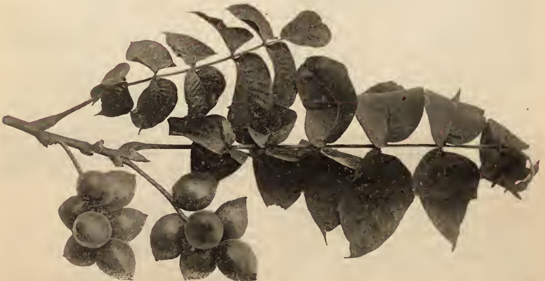
Japan Walnut ( Juglans Sieboldii ) at Fruitland