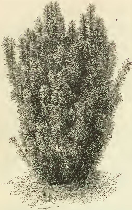
Podocarpus Koransis at Fruitland