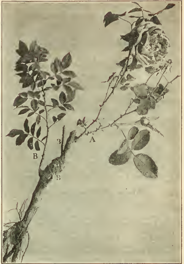
Rose Budded upon Manetti

Sunset. A sport of Perle des Jardins, of a rich, tawny yellow.