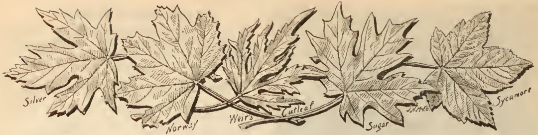
Specimens of Maple Leaves