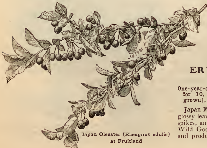
Japan Oleaster ( Elæagnus edulis ) at Fruitland

Elæagnus edulis. A low-growing shrub. Our specimens, about 8 feet high and 10 feet spread, have