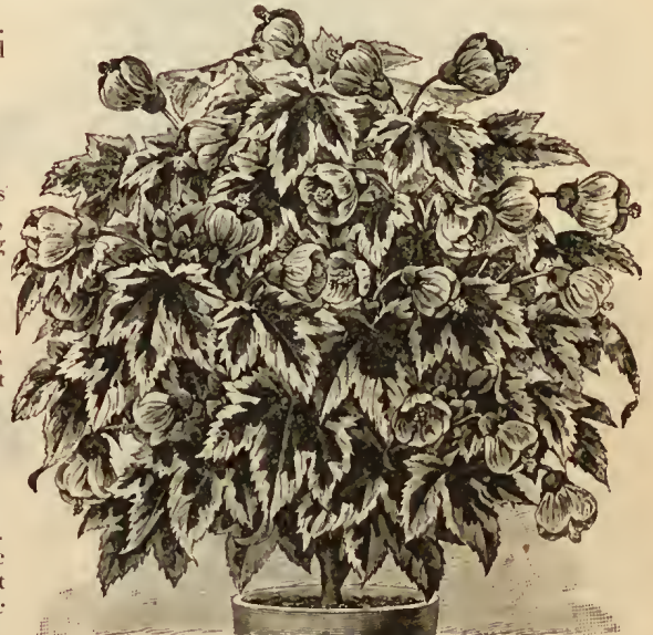
Abutilon, Souvenir de Bonn

A most ornamental plant of the Caladium family, with immense, light-green, stiff leaves. 25 cts. to $1.