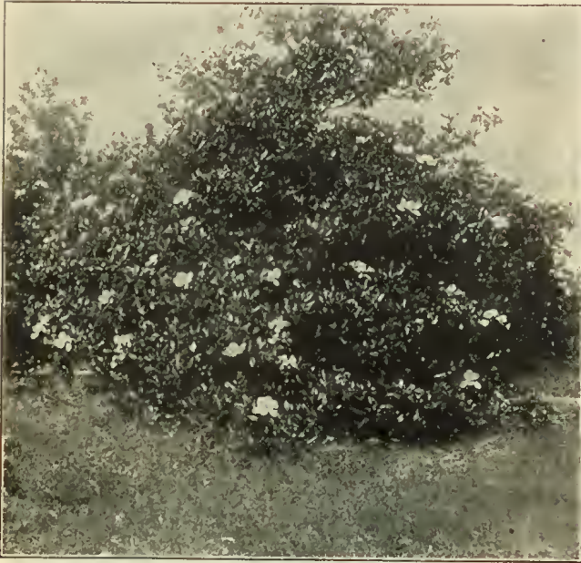
Magnolia grandiflora at Fruitland

A shrub of medium height: foliage very glossy; flowers creamy white, produced in great profusion during June, and delightfully fragrant, rivaling in this the popular Tea Olive. The flowers are followed by red berries, which are retained all winter. 25 and 50 cts.