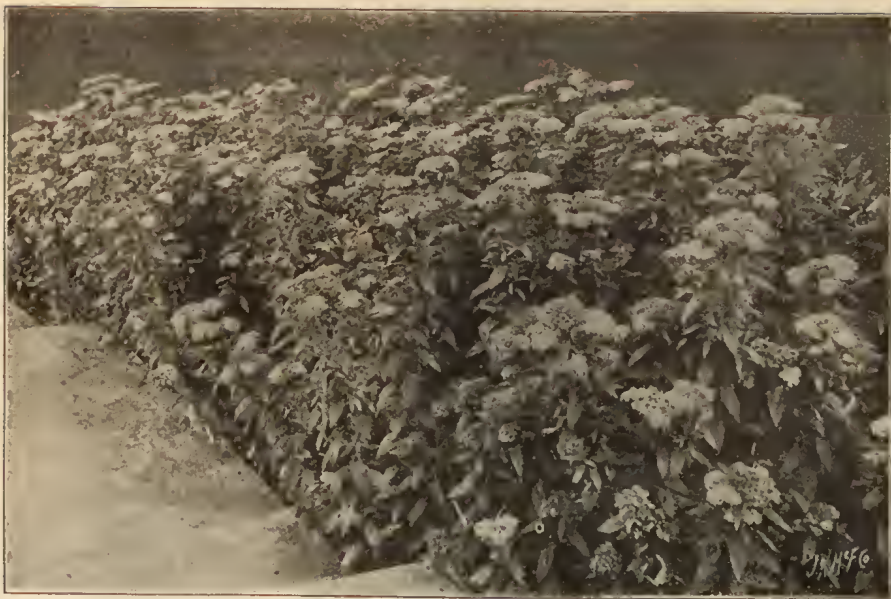
Spiræa Anthony Waterer at Fruitland