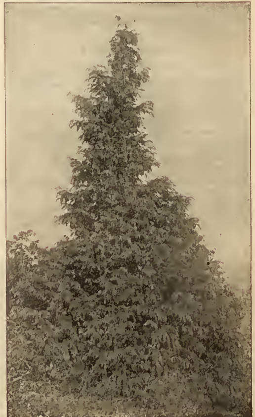
Cupressus Lawsoniana at Fruitland

Sempervirens pyramidalis (Oriental, or Pyramidal Cypress). Of compact and shaft-like habit. 25 to 50 cts.; large specimens, $1 and $2.