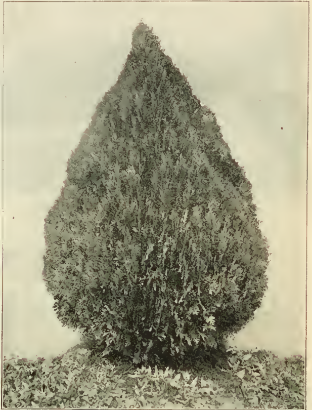
Biota aurea nana at Fruitland

Biota aurea conspicua . Another new variety of