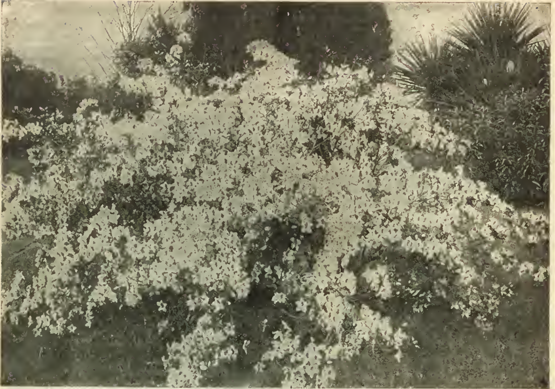
Azalea Indica at Fruitland