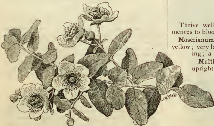
Hypericum Moserianum at Fruitland

This plant has created a sensation in Europe, where it was offered in 1892 for the first time. It is a Scotch Broom with red and yellow flowers, and has already become very popular for forcing, although the plant is hardy here. Flowers on long bunches; ground color of corolla is golden yellow; lower and lateral petals with a crimson border. This plant is in full bloom during April, and is most attractive. Strong plants, 25 cts. each.