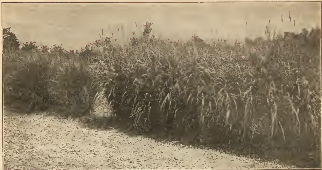
Eulalia Japonica zebrina and Univittata at Fruitland