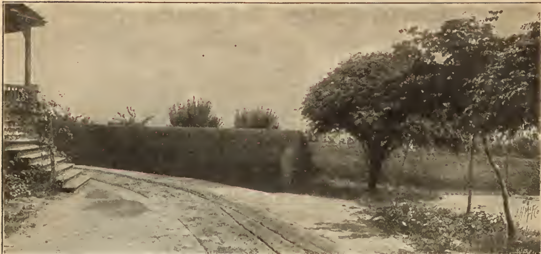
Amoor River Privet Hedge