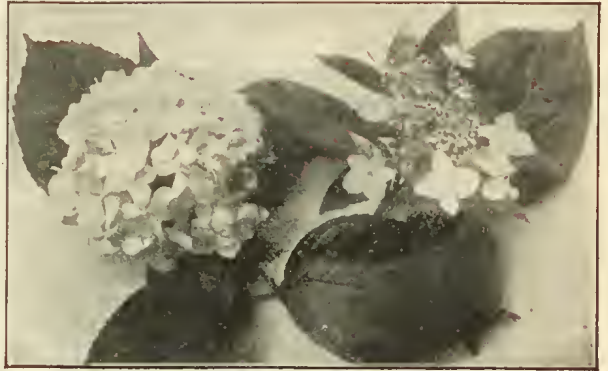
Hydrangeas, Thomas Hogg and Japonica, at Fruitland

Otaksa . An improved variety of Hortensis; flower heads very large; pale rose or blue, according to soil.