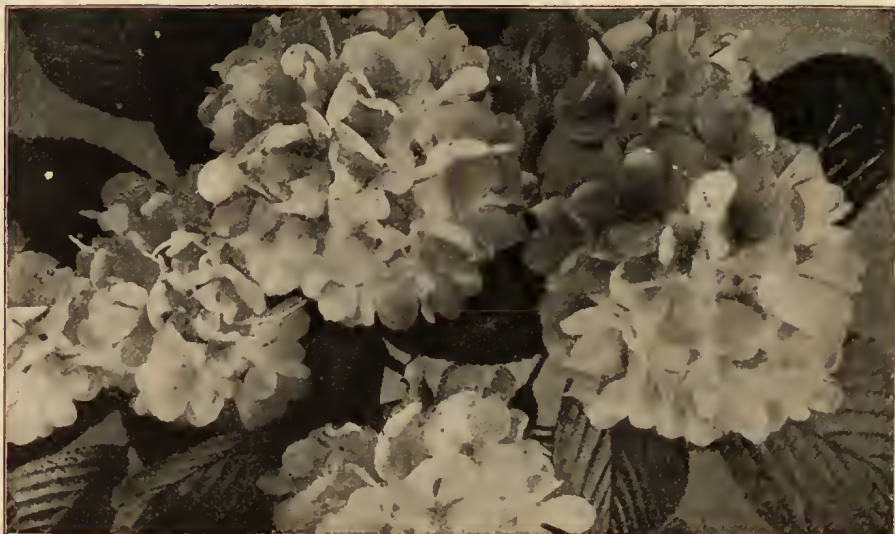
Viburnum at Fruitland

A beautiful ornamental foliage and flowering plant. Its sword-like foliage and tall, branched spikes of large, fragrant, creamy white flowers make it an effective plant for the lawn. Desirable for urns and jardinières in exposed positions. 25 and 50 cents.