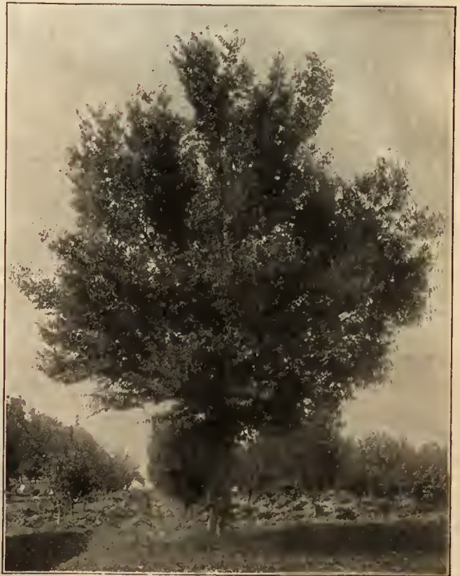
Celtis Davidiana at Fruitland

ing branches; foliage deep green and very smooth bark. A very rare and desirable shade tree which, after 15 years' trial in our grounds, has been entirely free from insect depredations. The picture shows its beautiful shape and character. Plants from 4-inch pots, 3 feet high, 25 cts.; 5 to 6 feet, 50 cts.