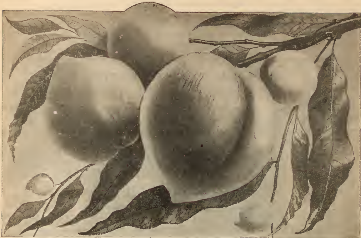
Everbearing Peach (about two-thirds natural size) From a photograph taken by us from original tree