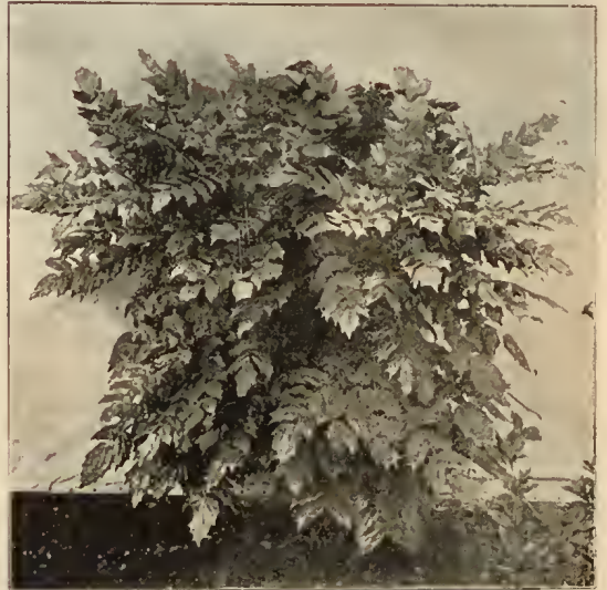
Berberis Japonica at Fruitland

These are valuable shrubs; their principal merits are great vigor, beautiful, broad, shiny foliage, and