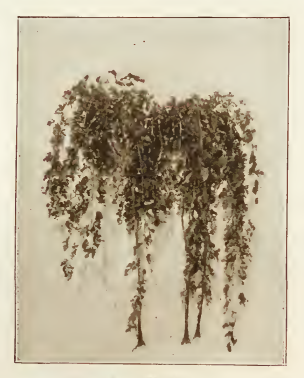
TEAS' WEEPING MULBERRY.