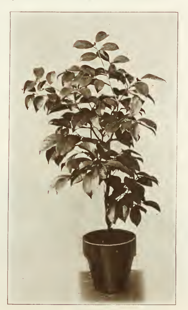
POT GROWN CAMELLIA JAPONICA

ported. Can supply in November a large quantity of this old favorite plant. The plants will be well branched and shape-ly. Our collection contains about fifteen nported.