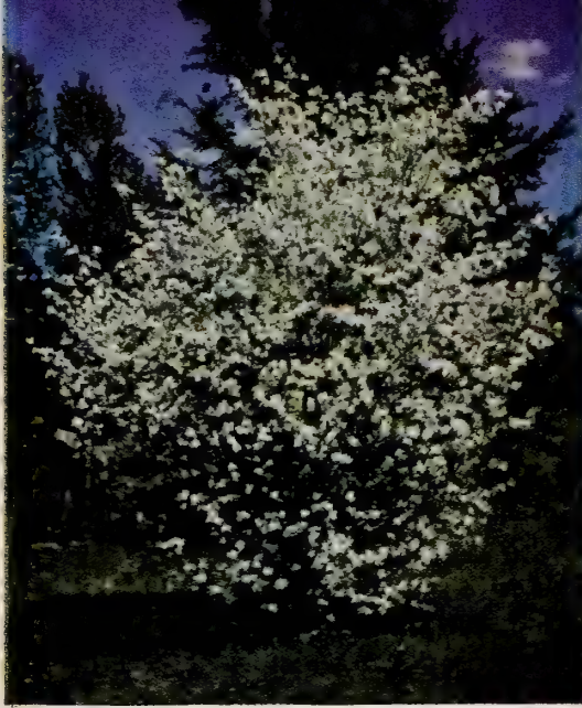
WHITE FLOWERING DOGWOOD (See Page 10)