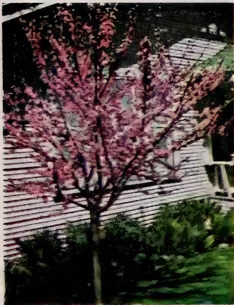
PRUNUS CAMPANULATA . . . See Page 11)

Each 8 to 10 ft. (Wt. 25 lbs.) $4.00 6 to 8 ft. (Wt. 20 lbs.) 3.00 5 to 6 ft. (Wt. 15 lbs.) 2.50