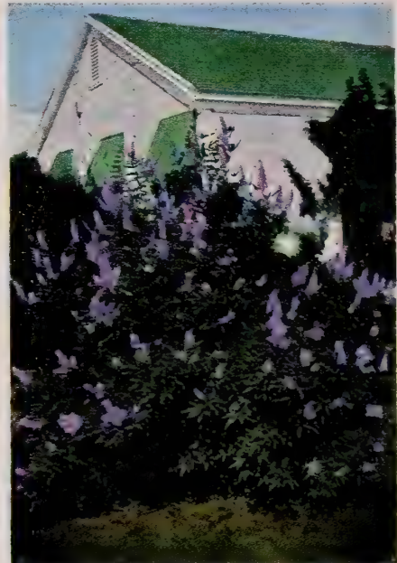
VITEK . . . See Page 11)