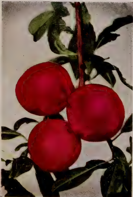
BURBANK PLUM... See Page 3