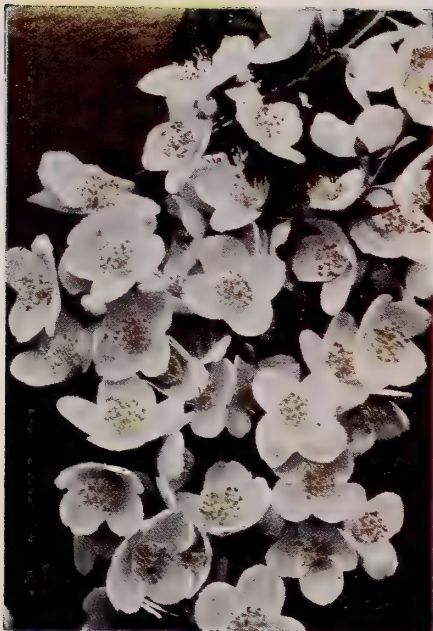
PHILADELPHUS (Mock Orange) (See Page 7)