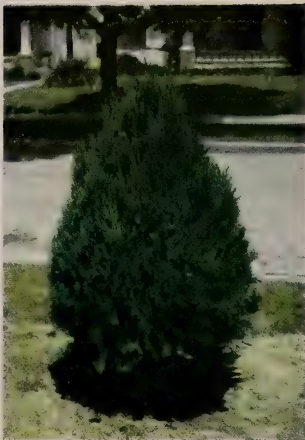
THUJA AUREA NANA