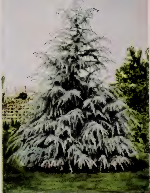
CEDRUS DEODARA . . . See Page 30

Due to increased shipping costs, no order will be accepted for less than $3.00.