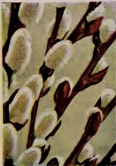
SALIX DISCOLOR (Pussywillow) (See Page 7)