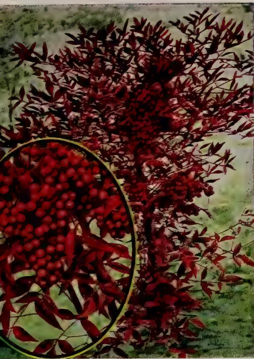
NANDINA DOMESTICA . . . See Page 27