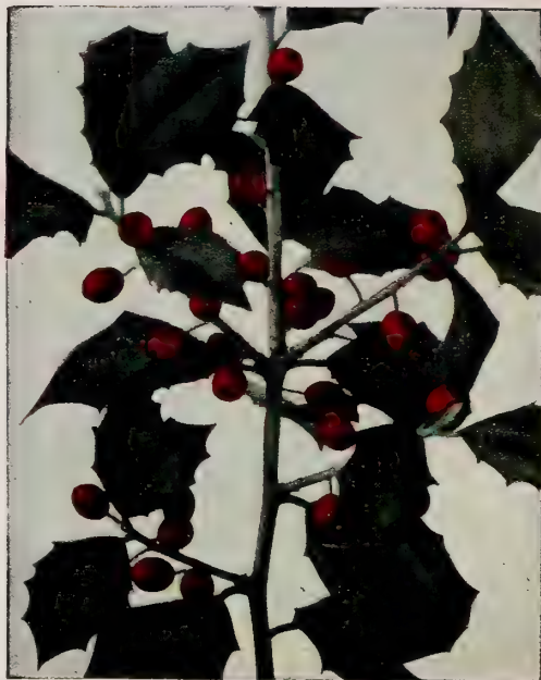
ILEX HOLLY . . . See Page 23