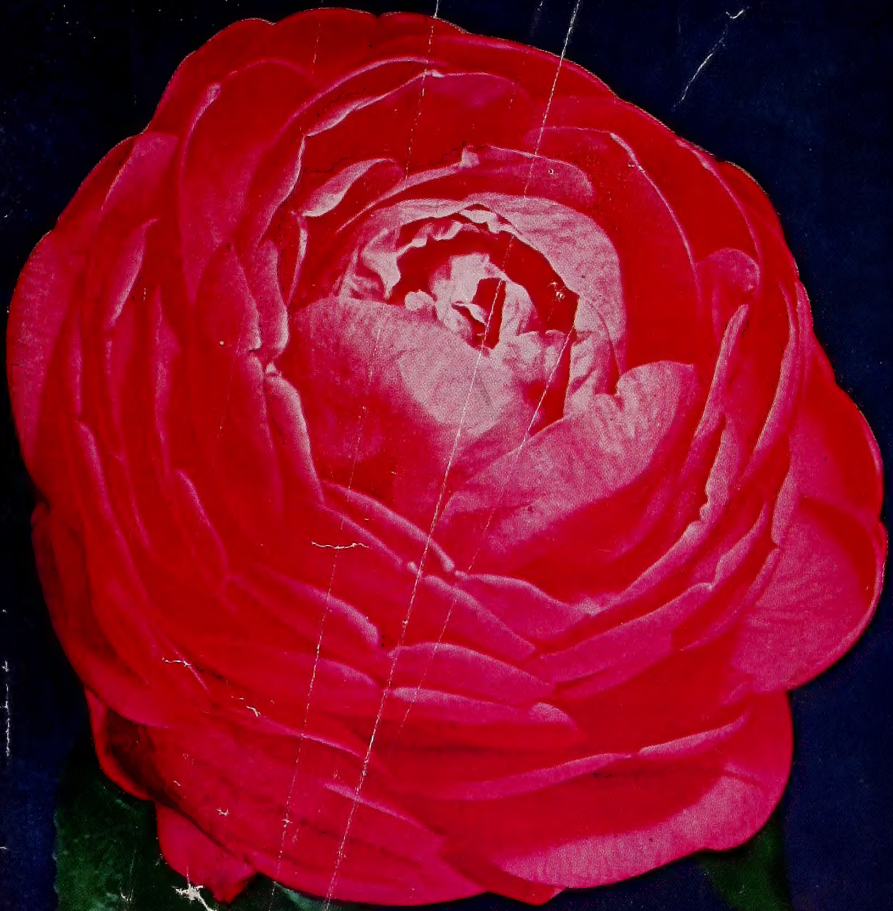
Camellia Japonica-American Girl