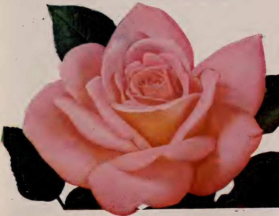
HELEN TRAUBEL (Plant Pat. 1028) (See Page 43)