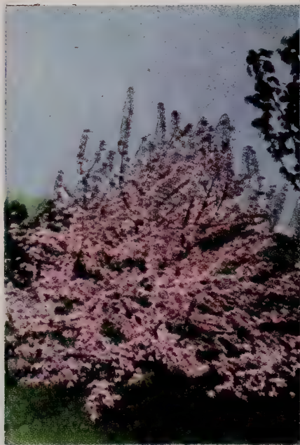
CREPE MYRTLE . . . See Page 10