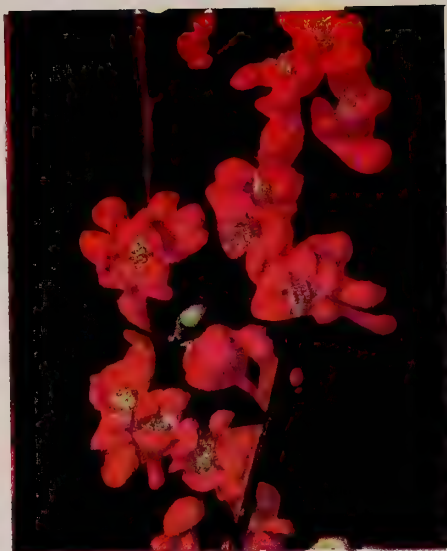
CYDONIA—Japan Quince . . . See Page 6