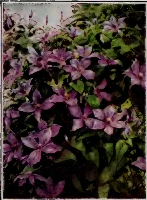
CLEMATIS JACKMANI . . . See Page 34