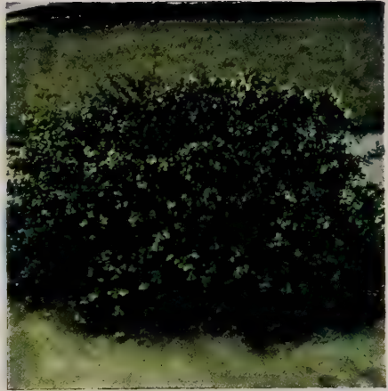
BERBERIS JULIANAE (See Page 15)