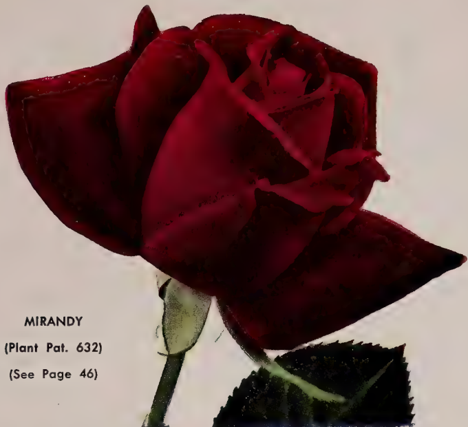
MIRANDY (Plant Pat. 632) (See Page 46)