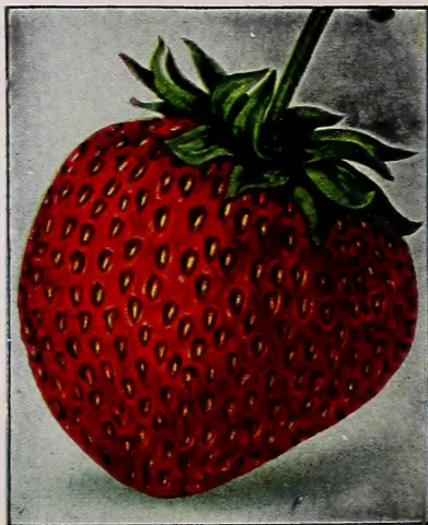
STRAWBERRY . . . (See Page 3)