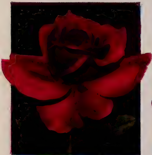
ETOILE DE HOLLANDE