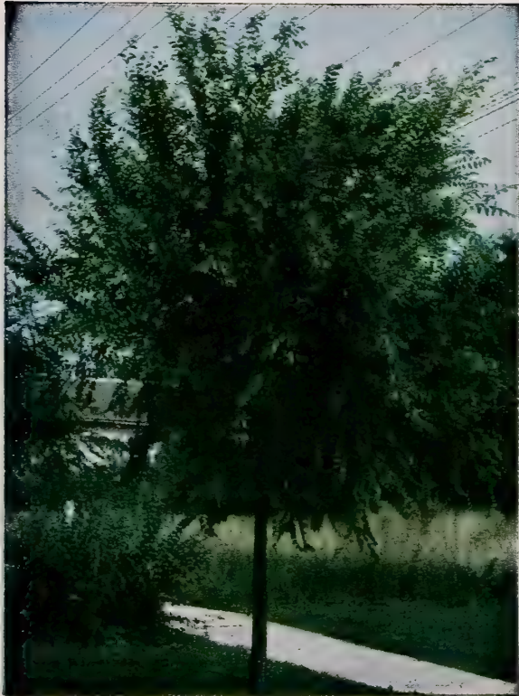
CHINESE ELM . . . See Page 12