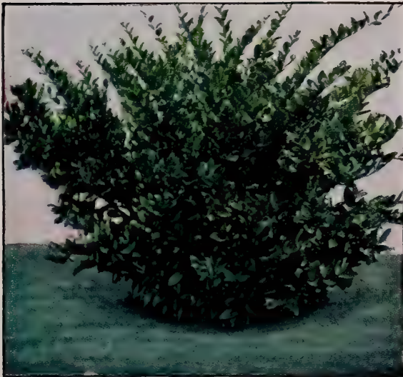
LIGUSTRUM LUCIDUM . . . See Page 26