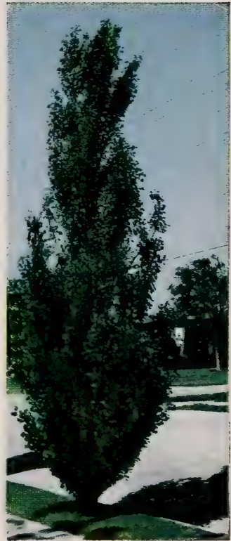
LOMBARDY POPLAR . See Page 11