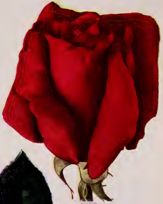
CHRYSLER IMPERIAL (Plant Patent No. 1167) (See Page 43)