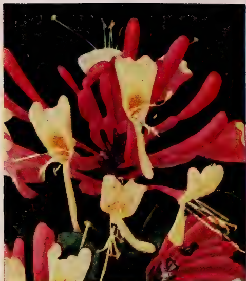
HECKROTTI LONICERA . . . See Page 35