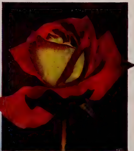
CONDESA DE SASTAGO