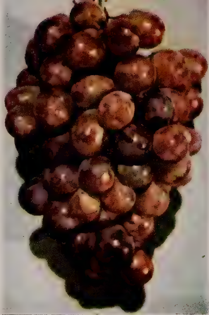
CACO . . . See Page 4

3 to 4 ft. (Wt. 8 lbs.) ..... Each $2.50