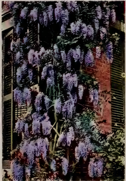
PURPLE WISTARIA . . . See Page 35