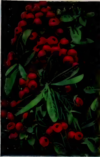
PYRACANTHA FORMOSANA (See Page 28)

Please remember, our Nursery is open every day except Sunday.