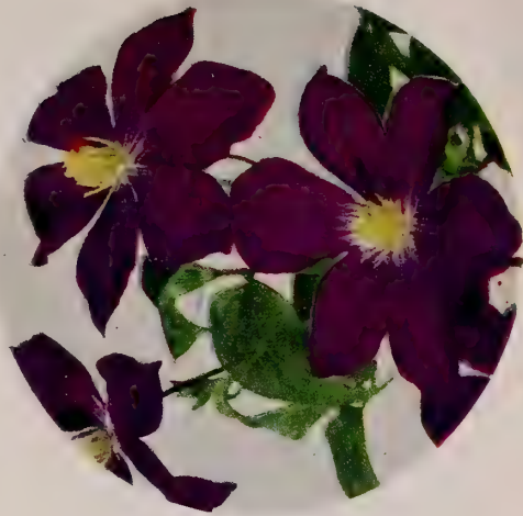
CLEMATIS EDOUARD ANDRE