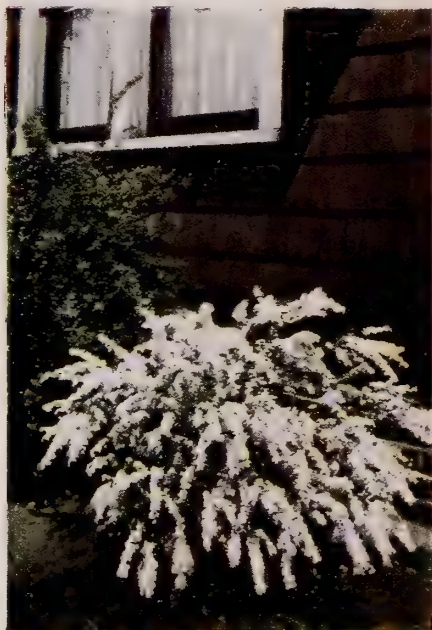
SPIREA VANHOUEITEI (See Page 7)