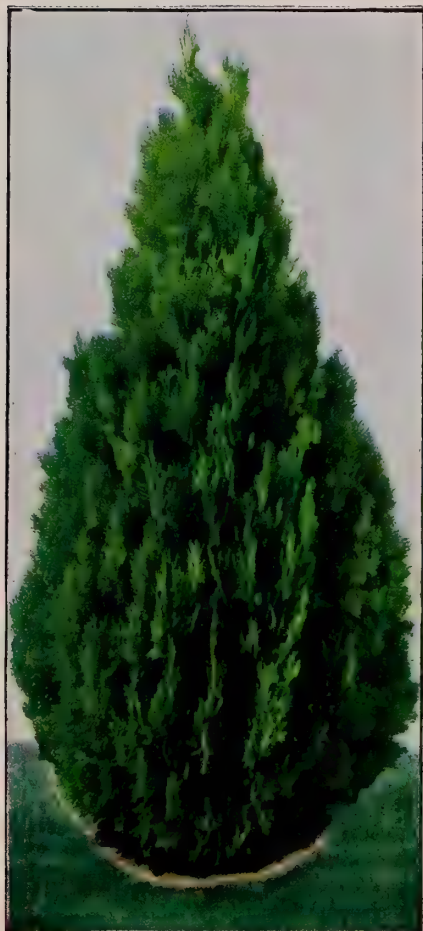
THUJA BAKER (See Page 34)