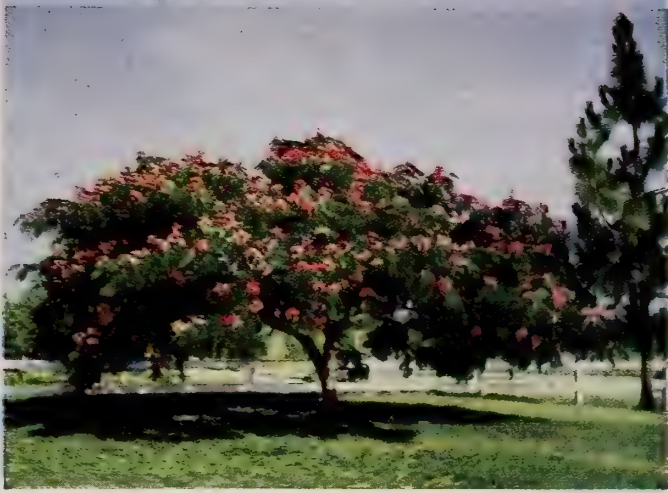
MIMOSA . . . See Page 10