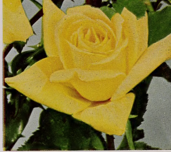
LEMON CHIFFON (Pat. 1241) THE YELLOW ROSE OF TEXAS