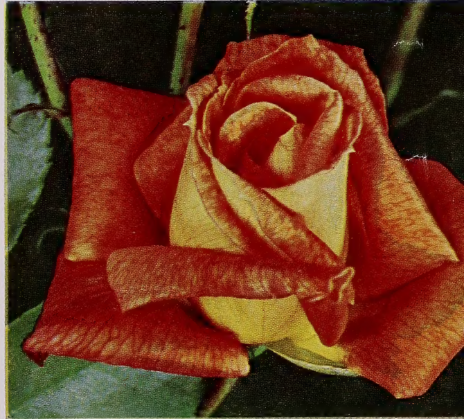
FLORIBUNDA GOLDEN SLIPPERS (PPRR)