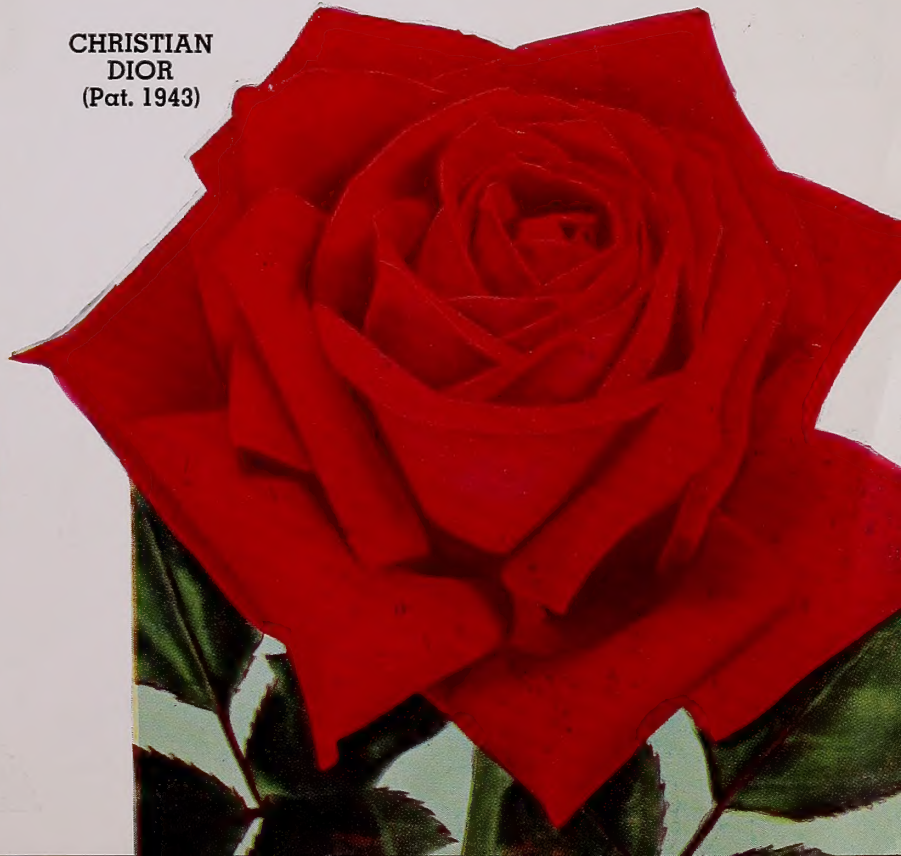
CHRISTIAN DIOR (Pat. 1943)