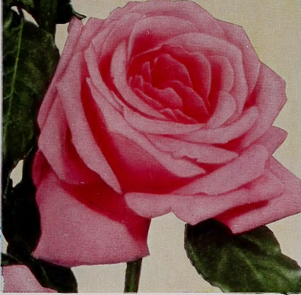
PINK FROST (Pat. 1269)