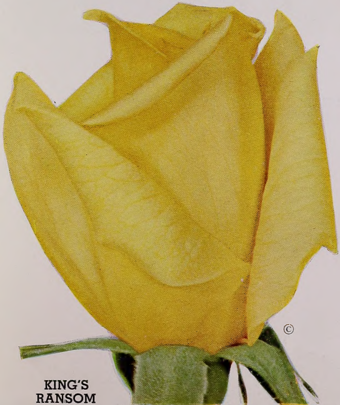
KING'S RANSOM (Pat. 2103)