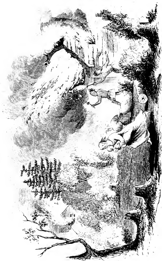
BURNING OF ROYALTON.