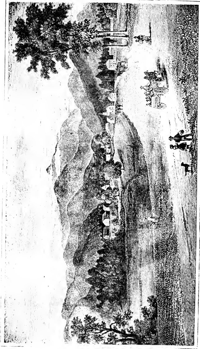
MOUNT WASHINGTON, NORTH CONWAY.